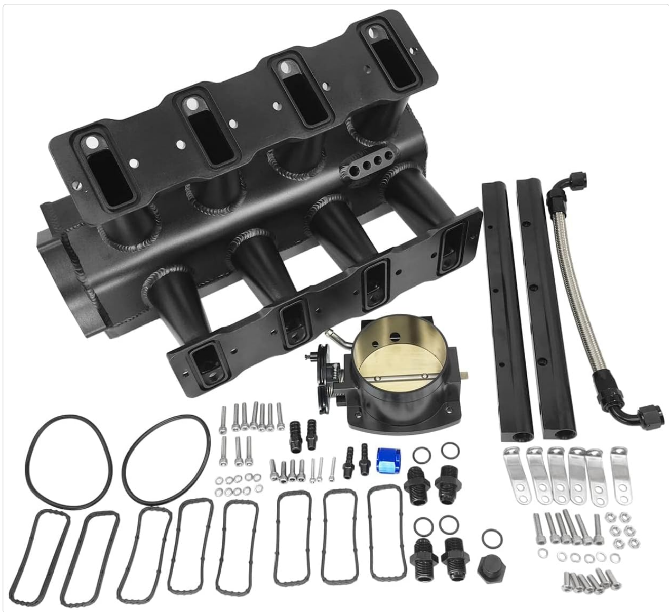
Figure 3: All components of the kit laid out, including gaskets, hardware, and fuel system parts.