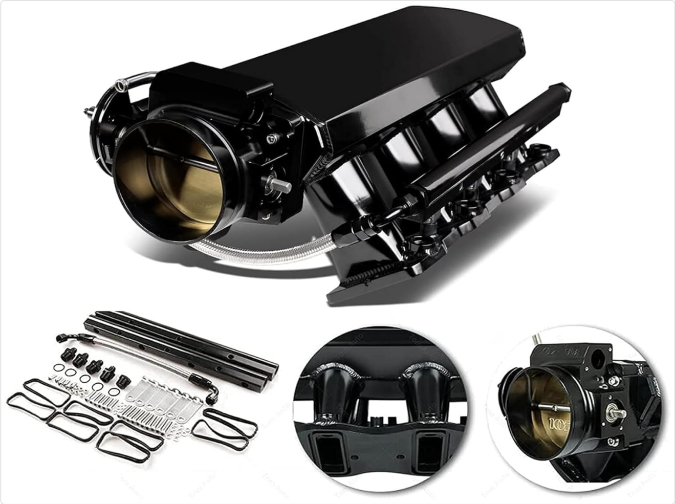
Figure 1: Complete TOM 102mm Heads Intake Manifold Kit, including the manifold, throttle body, and fuel rails.