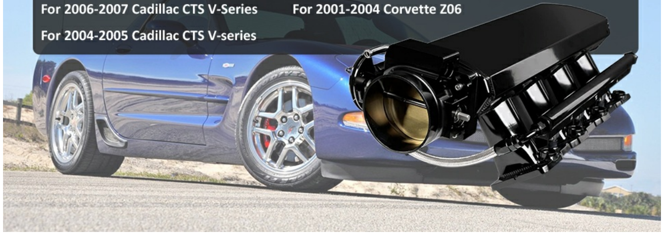
Figure 4: Visual representation of vehicle compatibility for the intake manifold kit.