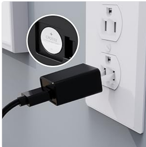
The alarm clock includes a CR2032 battery for backup, preserving settings during power interruptions.