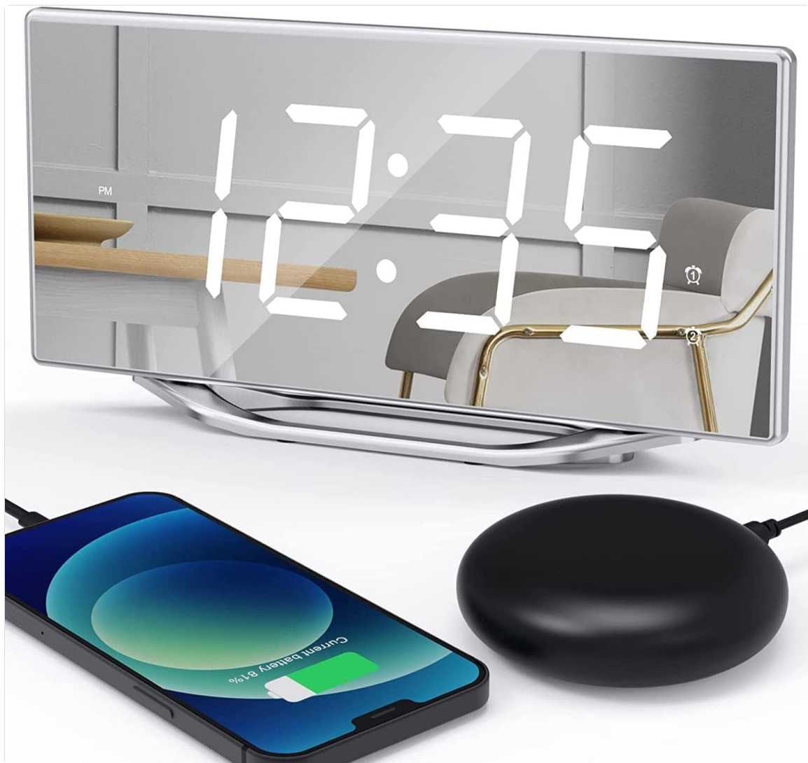
The ROCAM Digital Mirror Alarm Clock with its bed shaker and USB charging capability.

The ROCAM Digital Mirror Alarm Clock is designed to provide a reliable and versatile wake-up experience, especially for heavy sleepers. It features an 8.7-inch large LED display, a reflective mirror surface, multiple wake-up modes, and convenient charging options.