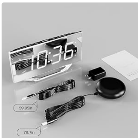
The bed shaker connects to the alarm clock via a dedicated port, providing a strong vibration for heavy sleepers.