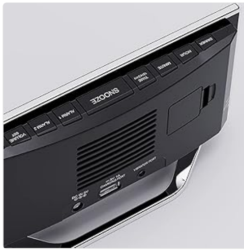
Rear view of the alarm clock showing the power input, USB charging port, and vibrator port.