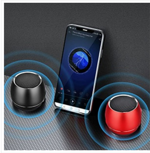
Figure 5: True Wireless Stereo Pairing