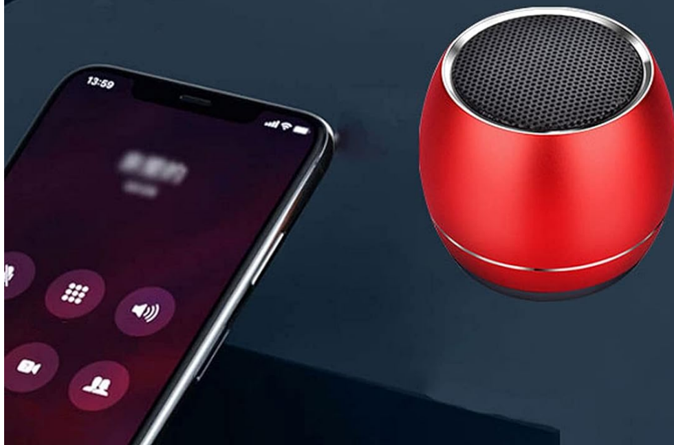
Figure 6: Hands-Free Calling