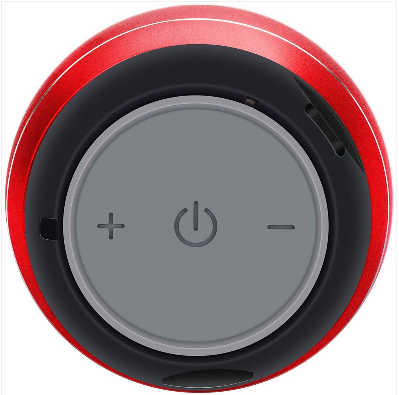
Figure 2: Top Control Panel