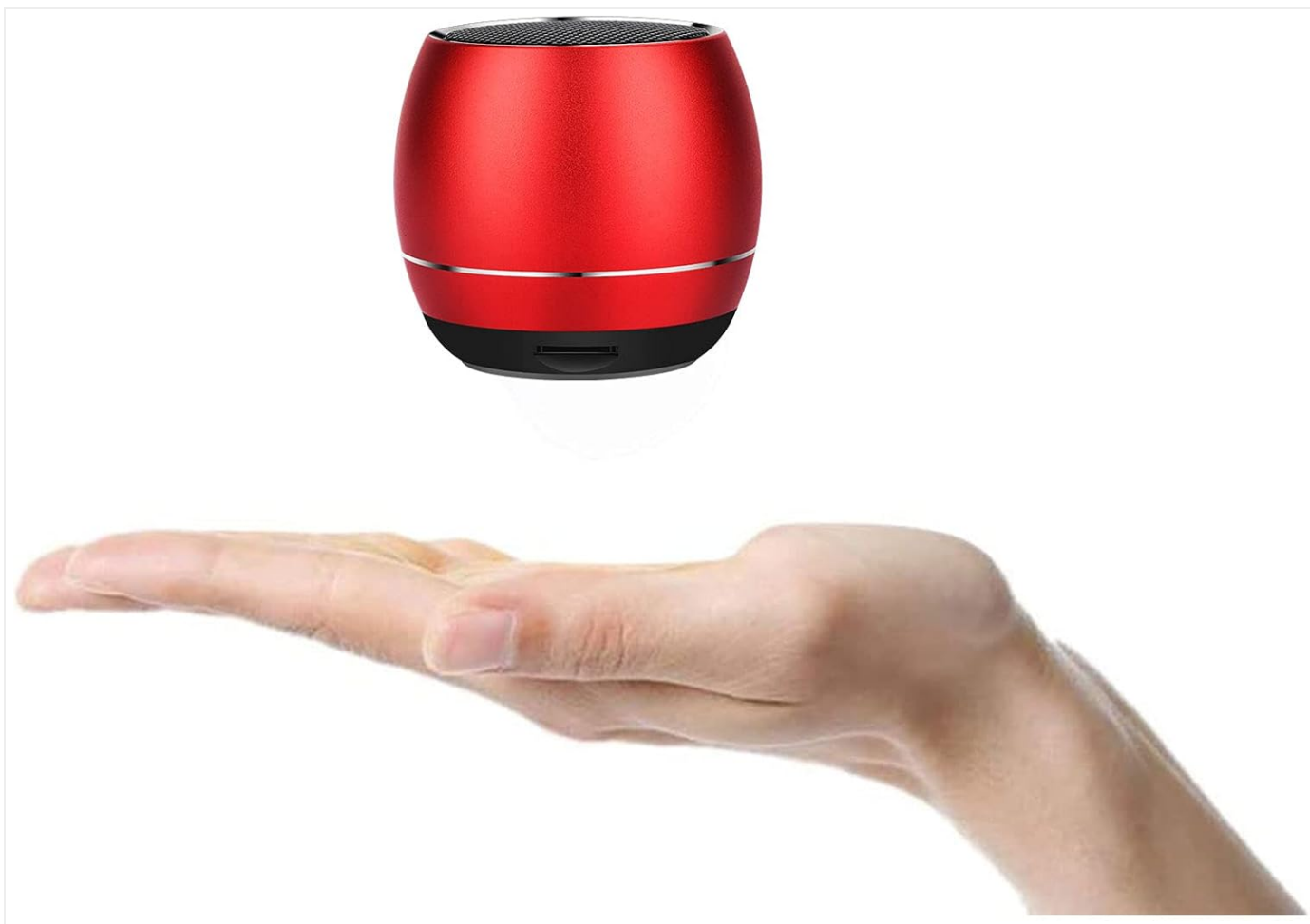
Figure 1: Aresrora M020/V7 Portable Bluetooth Speaker (Red)