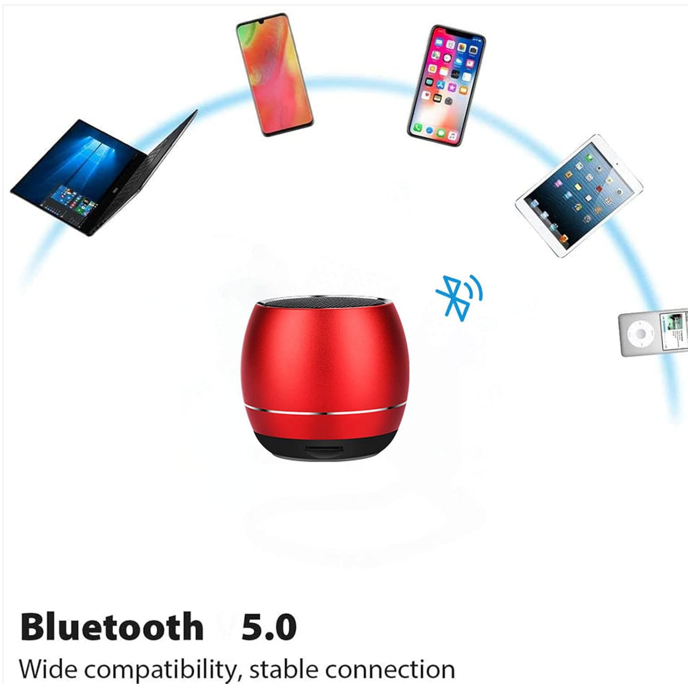
Figure 4: Bluetooth 5.0 Connectivity