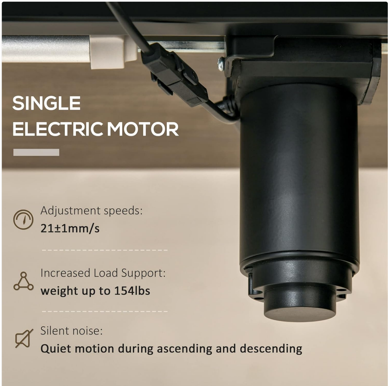
Figure 6: Single electric motor for smooth height adjustments.