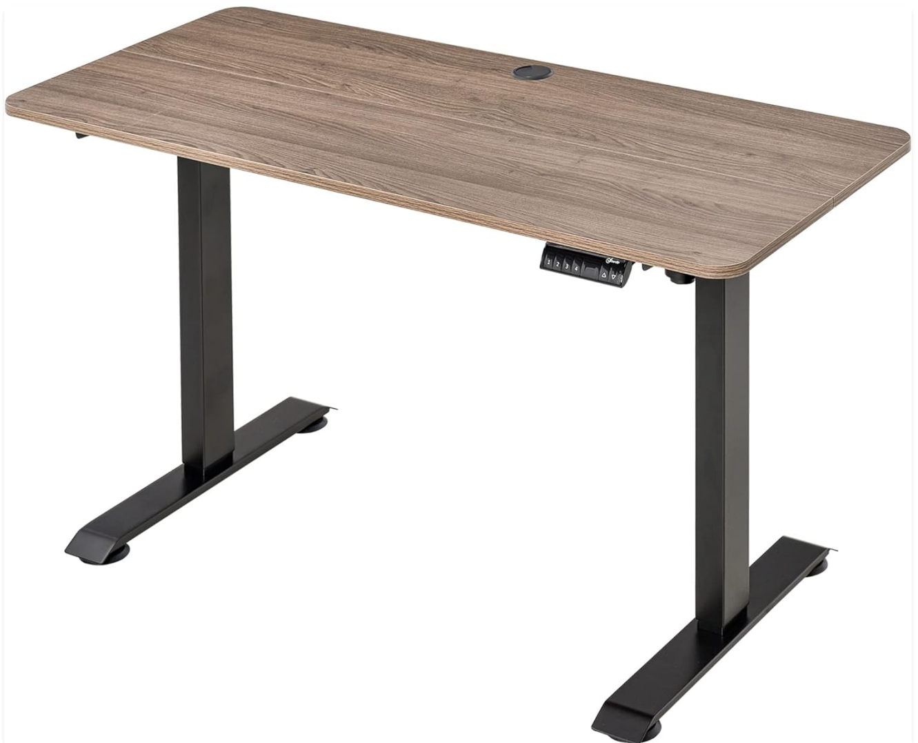
Figure 1: Vinsetto Electric Height Adjustable Standing Desk

This instruction manual provides essential information for the safe assembly, operation, and maintenance of your Vinsetto Electric Height Adjustable Standing Desk. Please read this manual thoroughly before use and retain it for future reference.