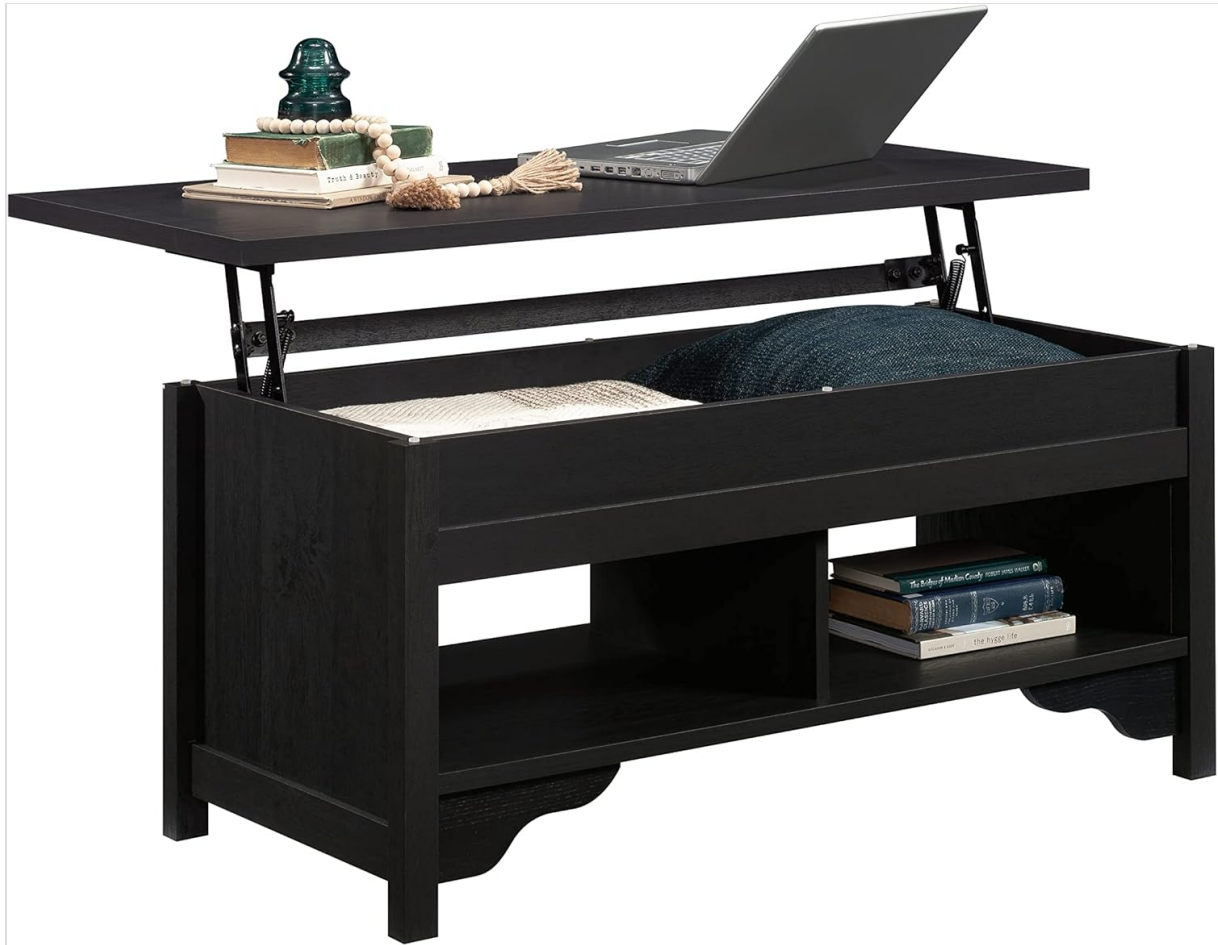
Image: The coffee table with its lift-top mechanism fully extended, displaying a laptop and other items on the raised surface.