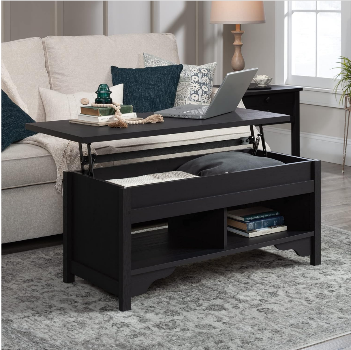
Image: The Sauder Dawson Trail Lift-Top Coffee Table positioned in a living room, showcasing its design and functionality.