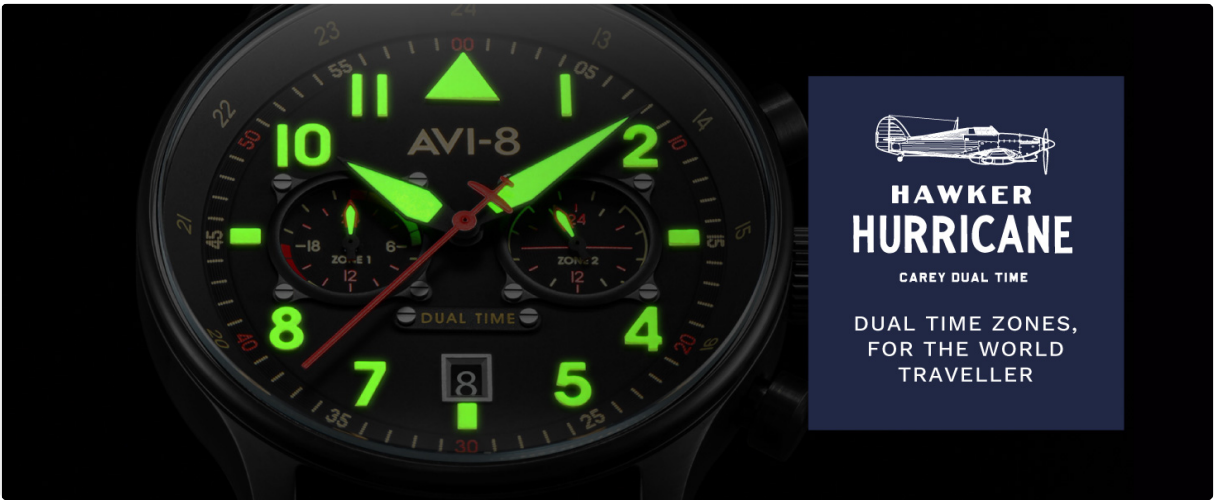
Image: The watch face illuminated in low light, demonstrating the visibility of the dual time zones.