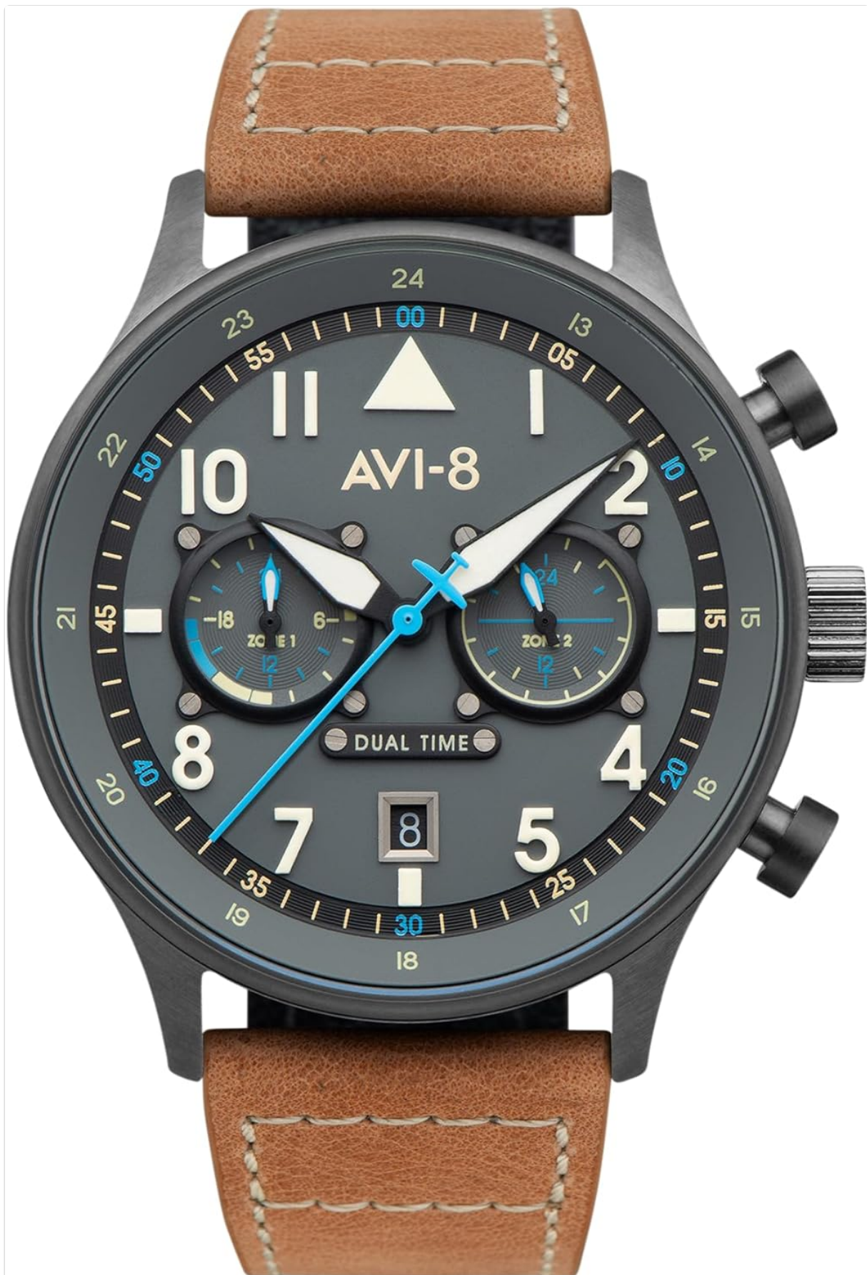
Image: Front view of the AVI-8 Hawker Hurricane AV-4088 watch, highlighting its intricate dial and controls.