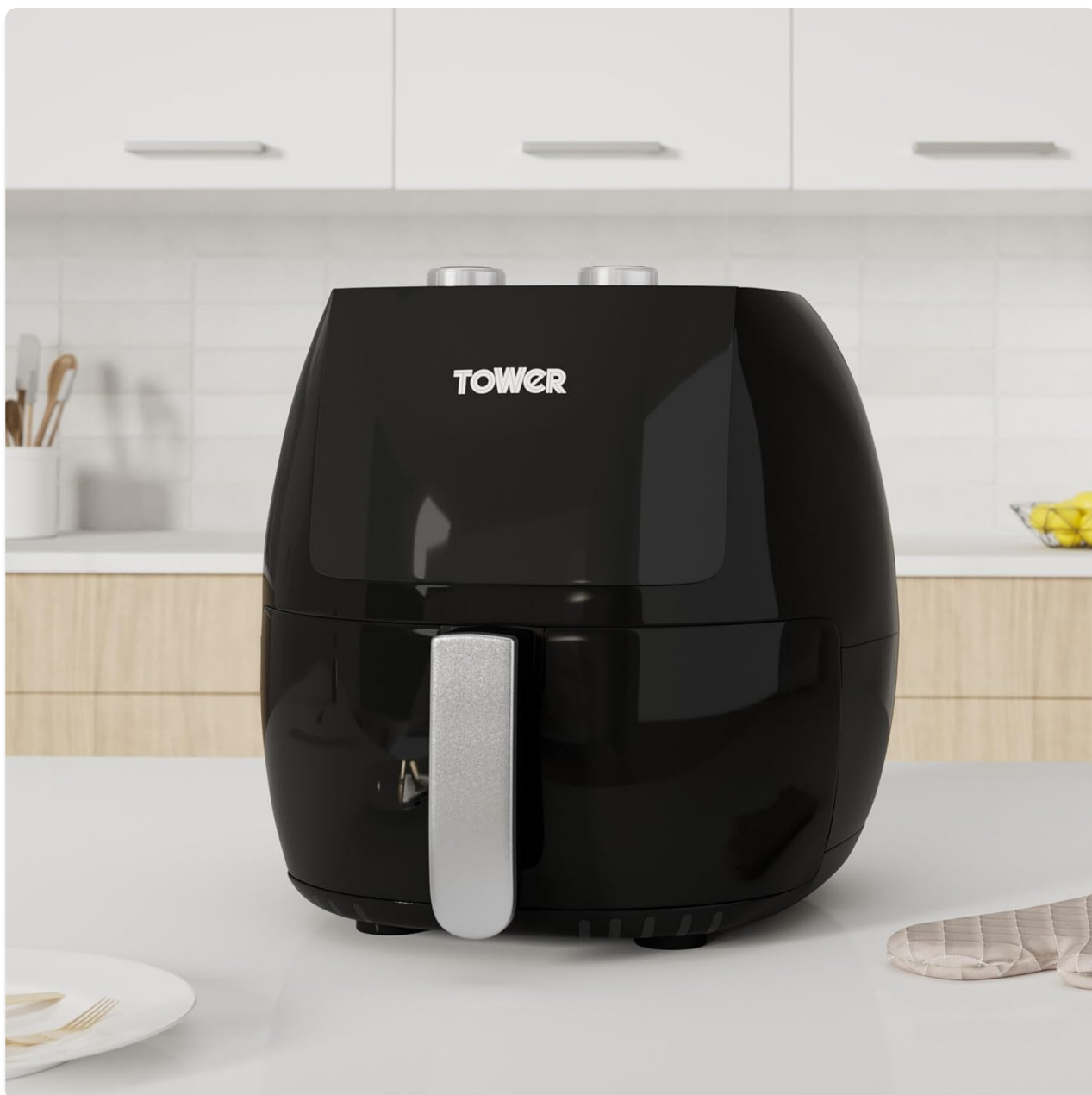
Image: The Tower Air Fryer positioned on a clean kitchen countertop, illustrating the recommended clearance from surrounding surfaces for proper ventilation.