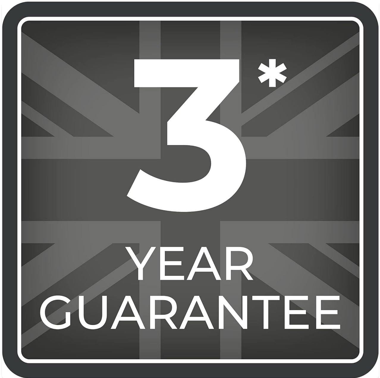
Image: A graphic displaying a '3 Year Guarantee' badge, indicating the product's warranty period.