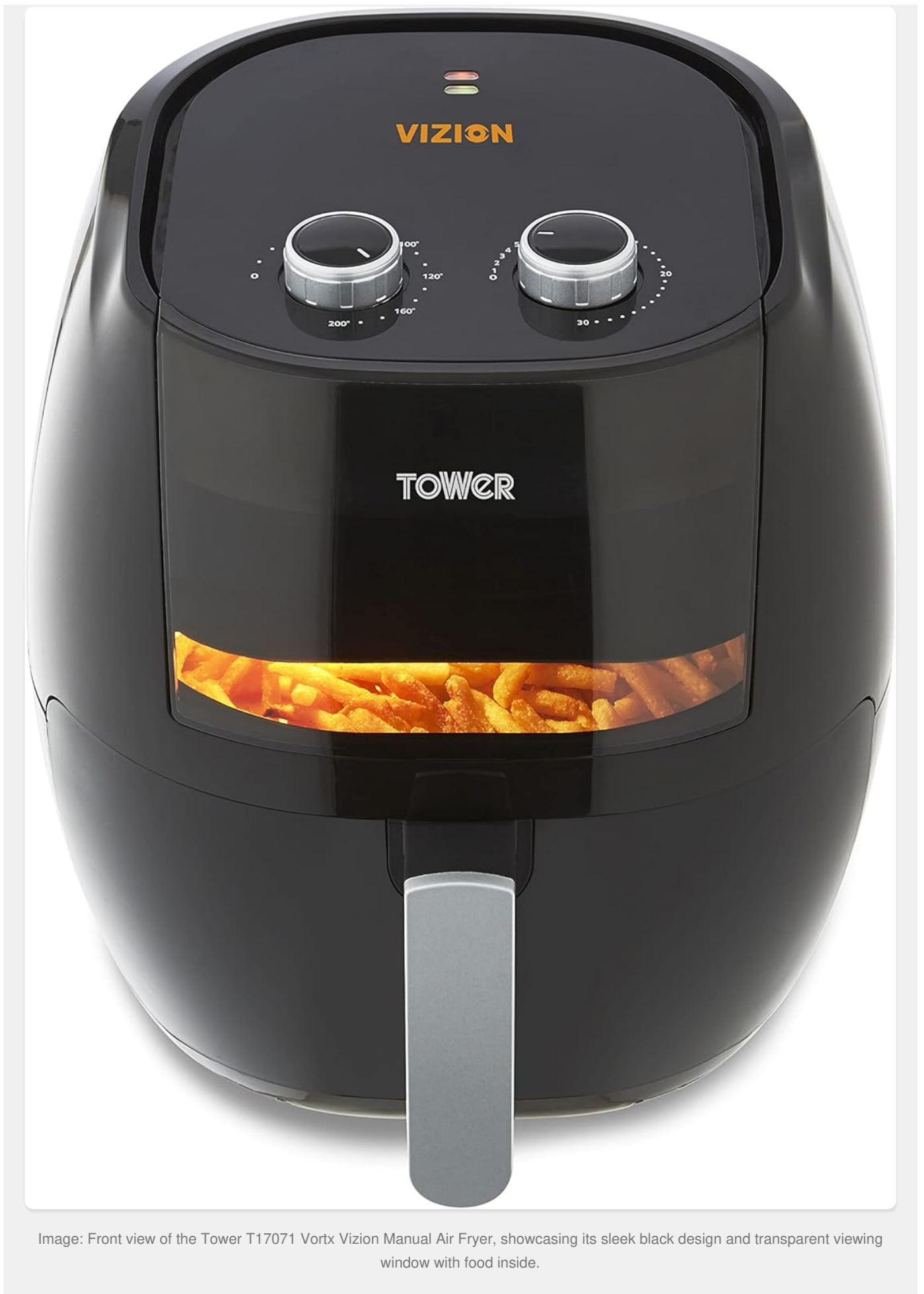
Image: Front view of the Tower T17071 Vortex Vizion Manual Air Fryer, showcasing its sleek black design and transparent viewing window with food inside.