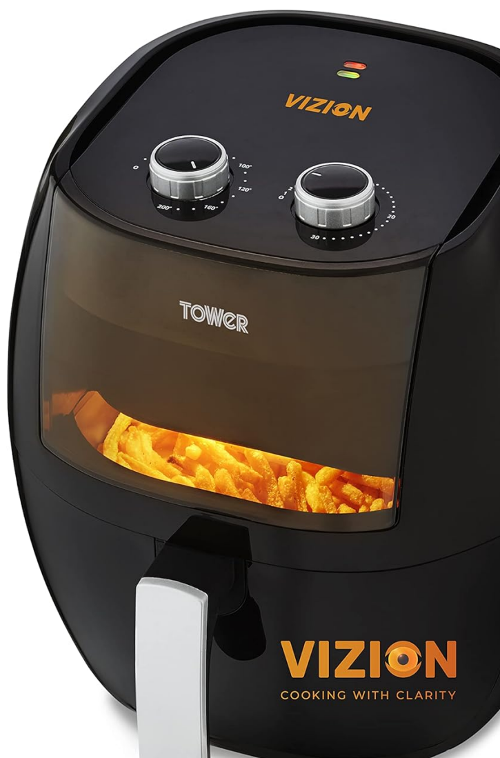
Image: Infographic highlighting key features of the Tower Air Fryer, such as the Vizion viewing window, Vortex technology for 99% less fat, faster cooking, 7L extra-large capacity, and simple controls.