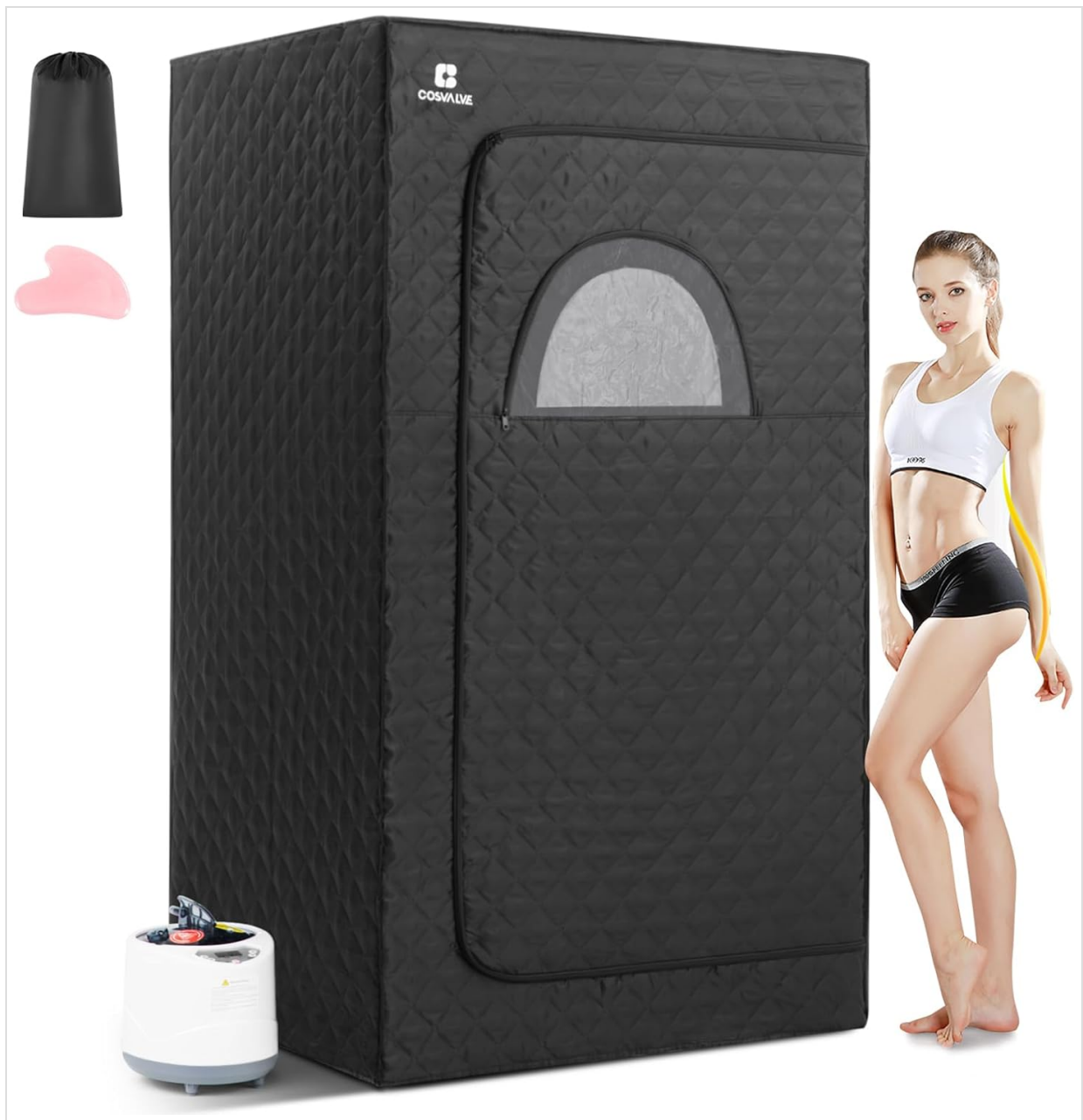
Figure 1: Fully assembled COSVALVE Portable Steam Sauna with steam generator.