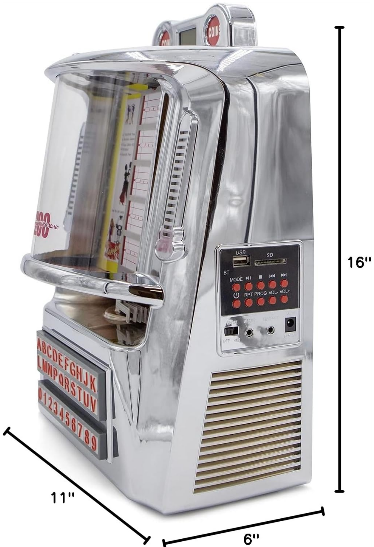
Figure 3: Dimensions of the jukebox for proper placement and fitting.