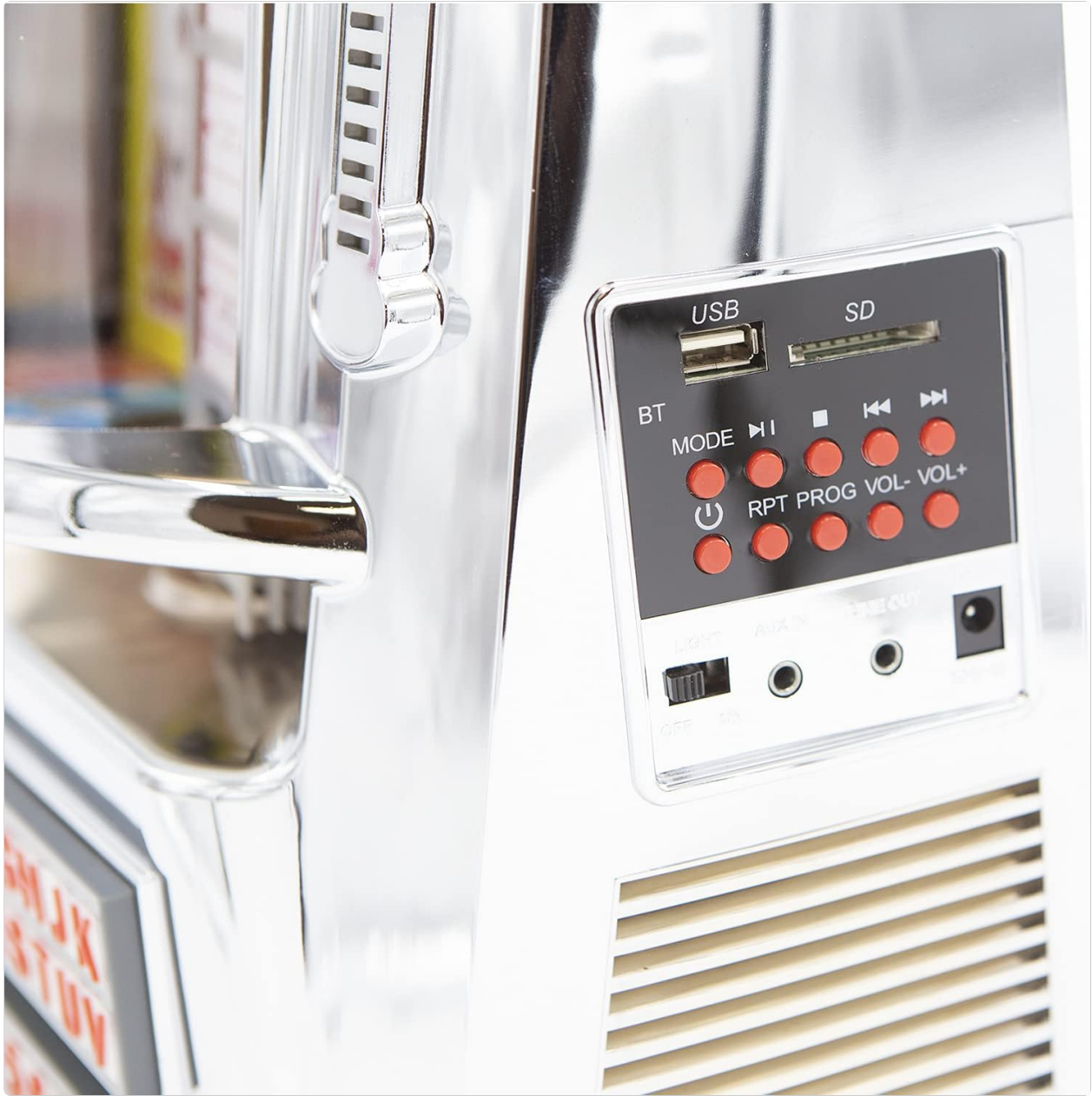
Figure 4: Side control panel with various input and control options.

The main control panel is located on the right side of the unit. It features various buttons and ports for different functions.