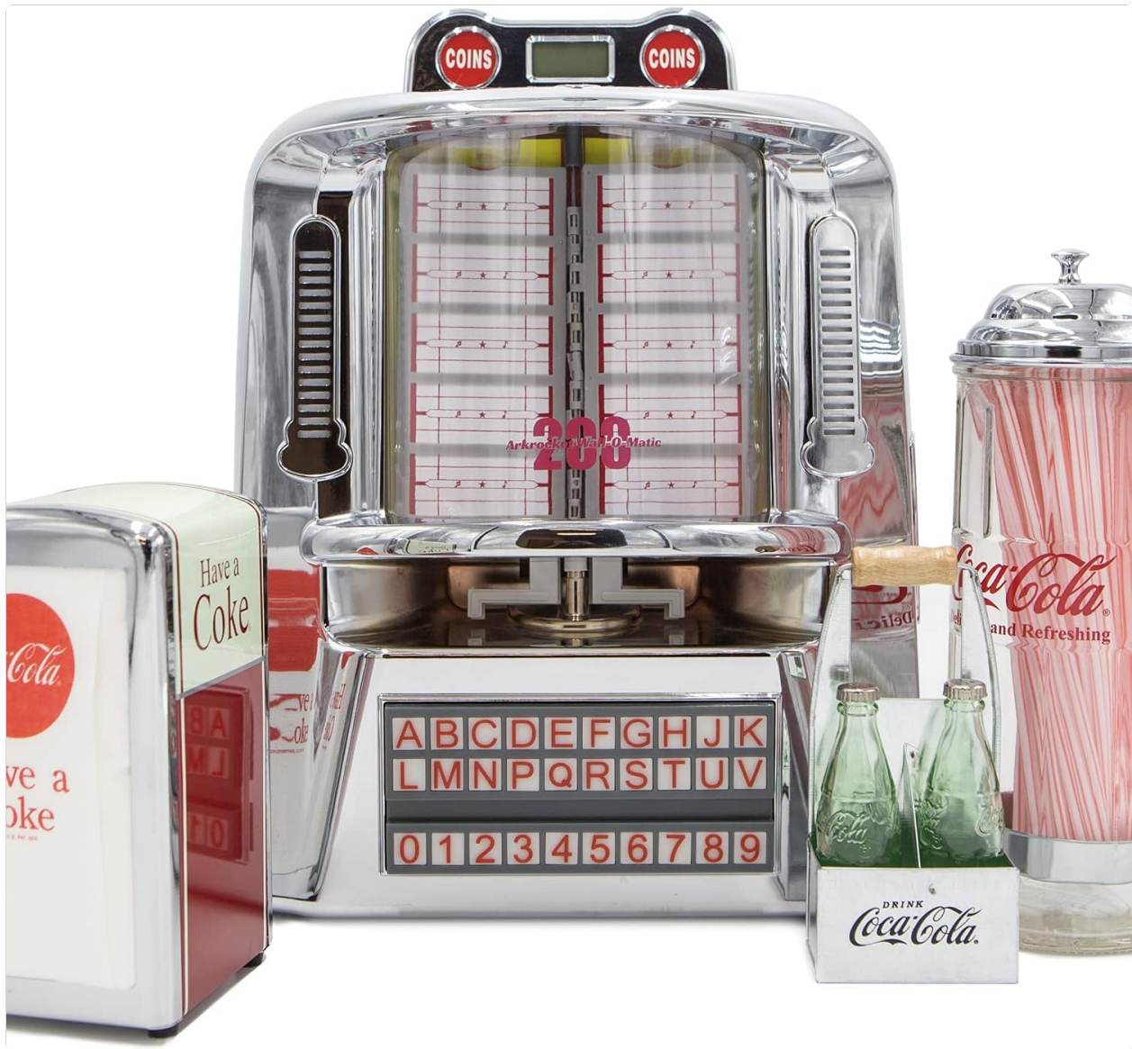
Figure 1: The arkrocket 200 Wall-O-Matic Table Jukebox, designed to complement retro American diner aesthetics.