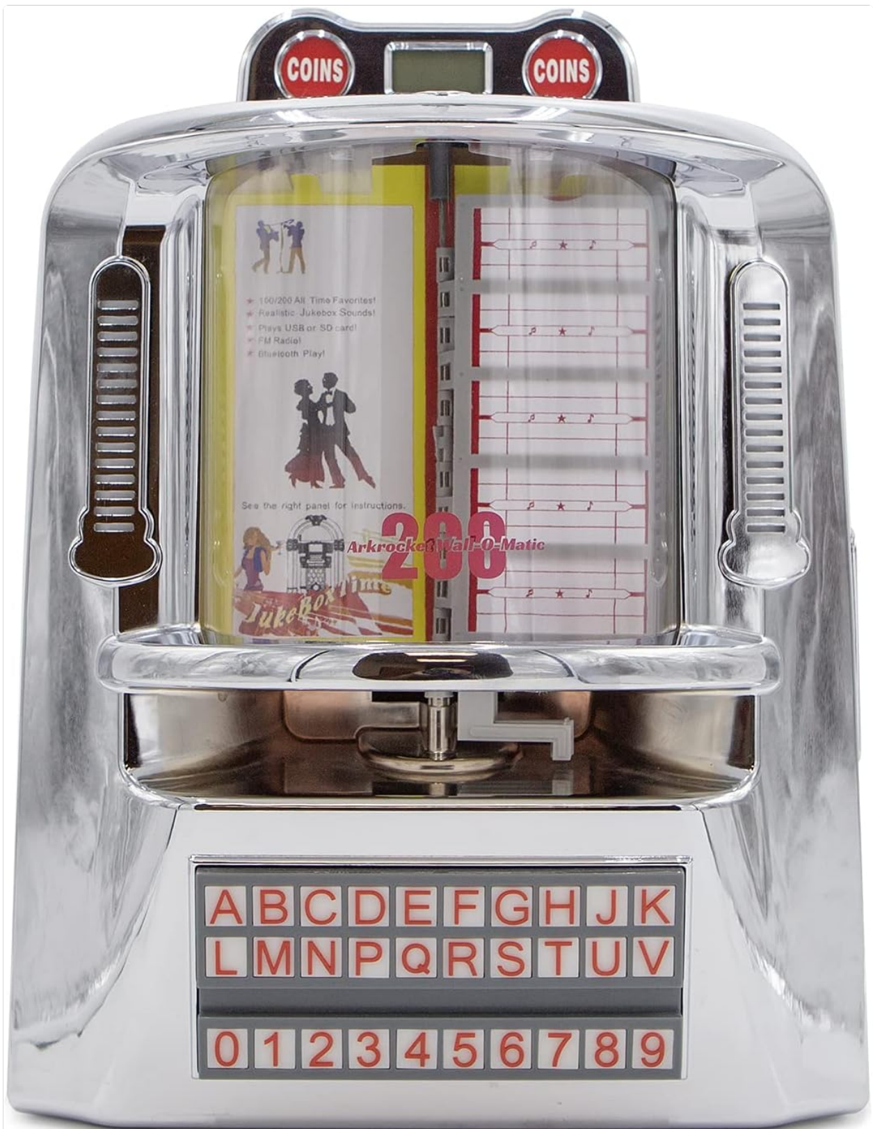
Figure 2: Front view of the jukebox, highlighting its classic design.