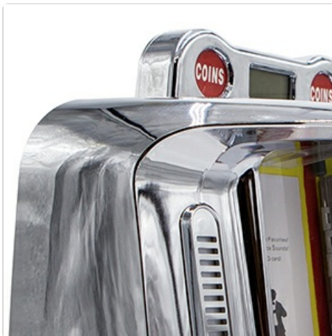
Figure 8: The jukebox with its ambient lighting activated, adding to the retro atmosphere.