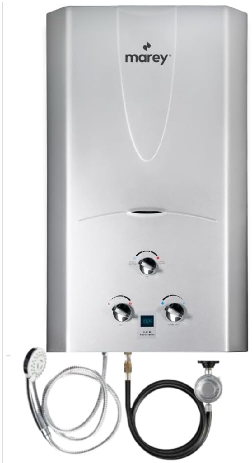
Image 1.1: Front view of the Marey 16L Gas Tankless Water Heater, showcasing the main unit along with the included shower head and gas regulator hose.