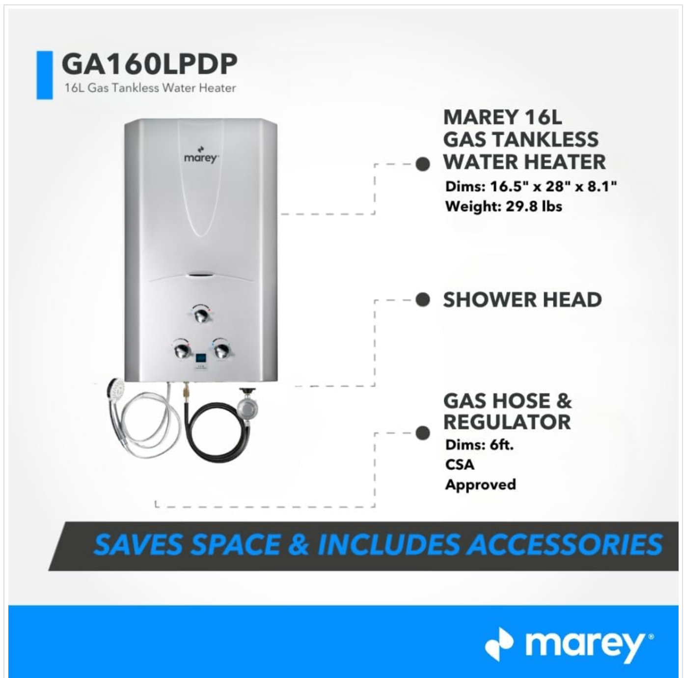
Image 3.2: An illustration detailing the Marey 16L Gas Tankless Water Heater, highlighting its dimensions (16.5" x 28" x 8.1") and weight (29.8 lbs), along with the included shower head and CSA approved 6ft gas hose and regulator.