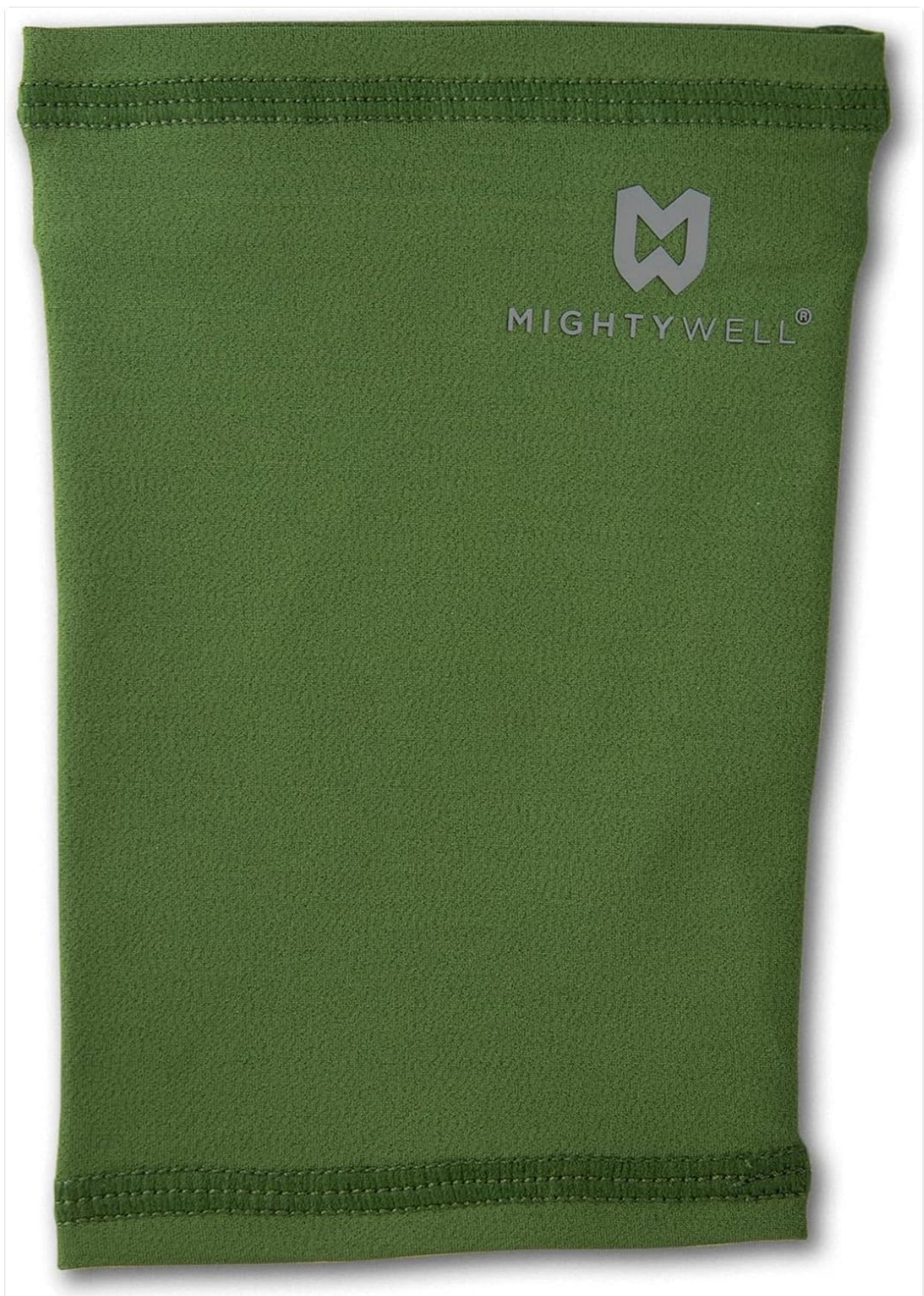
Image 1.1: The Mighty Well PICCPPerfect PICC Line Cover in Olive, showcasing the brand logo.