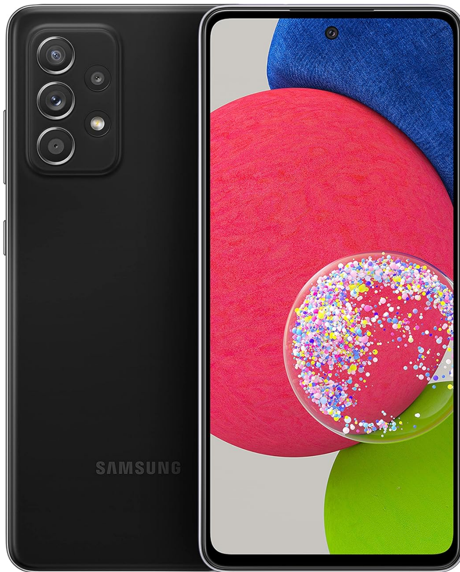
The Samsung Galaxy A52s 5G in black, showcasing its sleek design and camera module on the rear, and the Infinity-O display on the front.