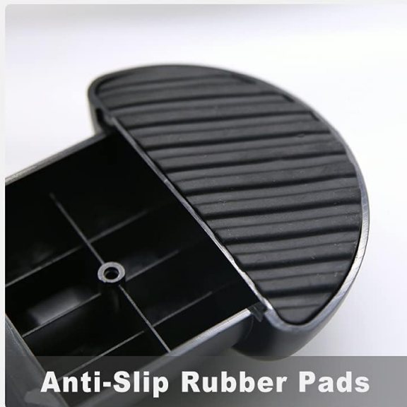
Anti-Slip Rubber Pads