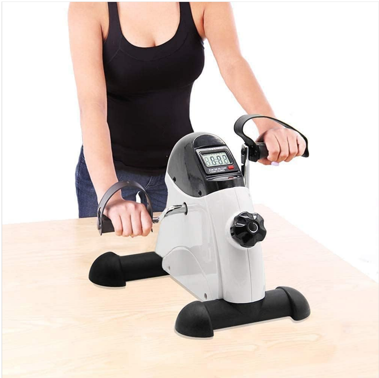
Image: A user demonstrating arm exercise with the pedal exerciser placed on a table.