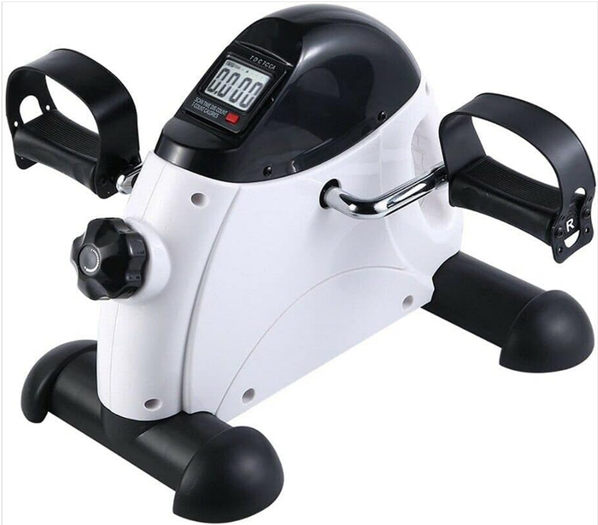
Image: Front view of the Lennox Hacienda Pedal Exerciser, showing the main unit, pedals, and the LCD display at the top.