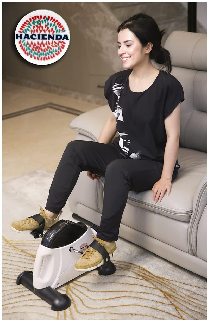
Image: A user demonstrating leg exercise with the pedal exerciser while seated on a sofa.