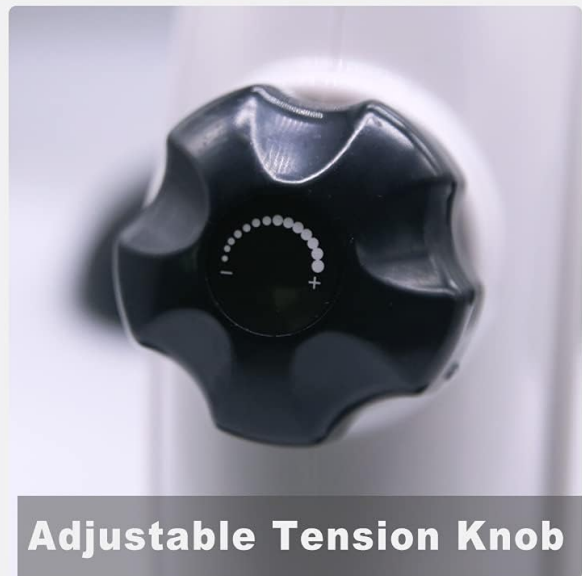
Adjustable Tension Knob