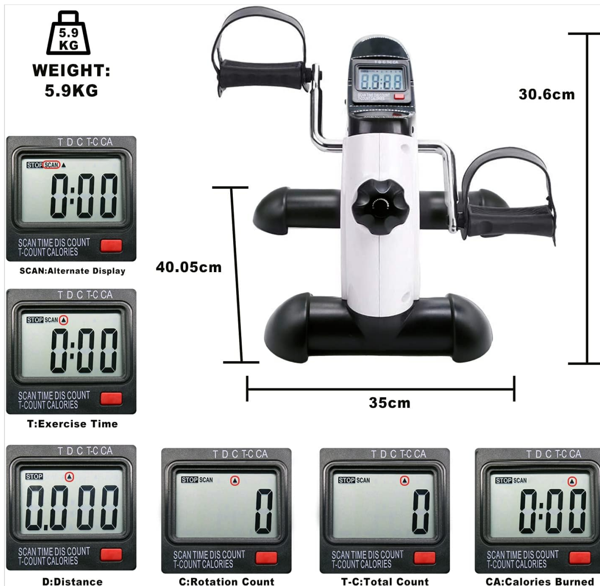
Image: Close-up views of the LCD display, illustrating the different metrics it tracks: Scan, Time, Distance, Count, Total Count, and Calories Burned.