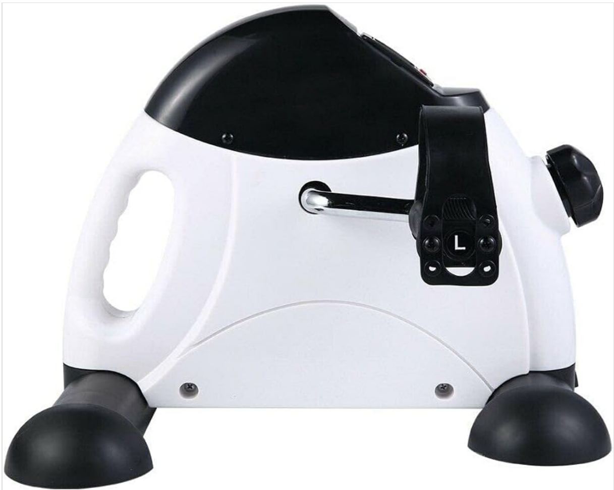
Image: Side view of the exerciser, illustrating the pedal attachment point and the 'L' marking on the left pedal.