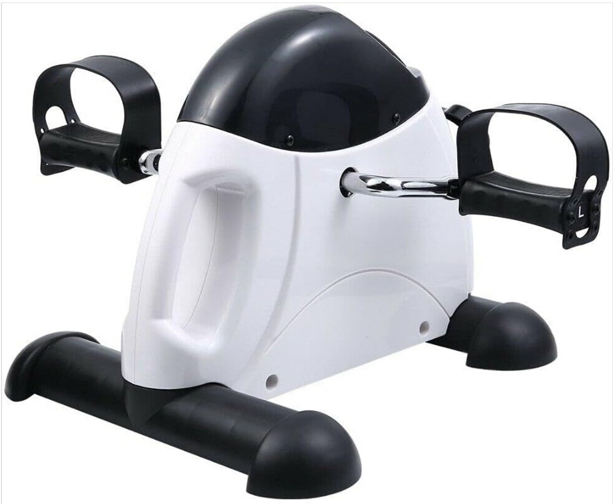
Image: Rear view of the pedal exerciser, highlighting the integrated transport handle for easy portability.