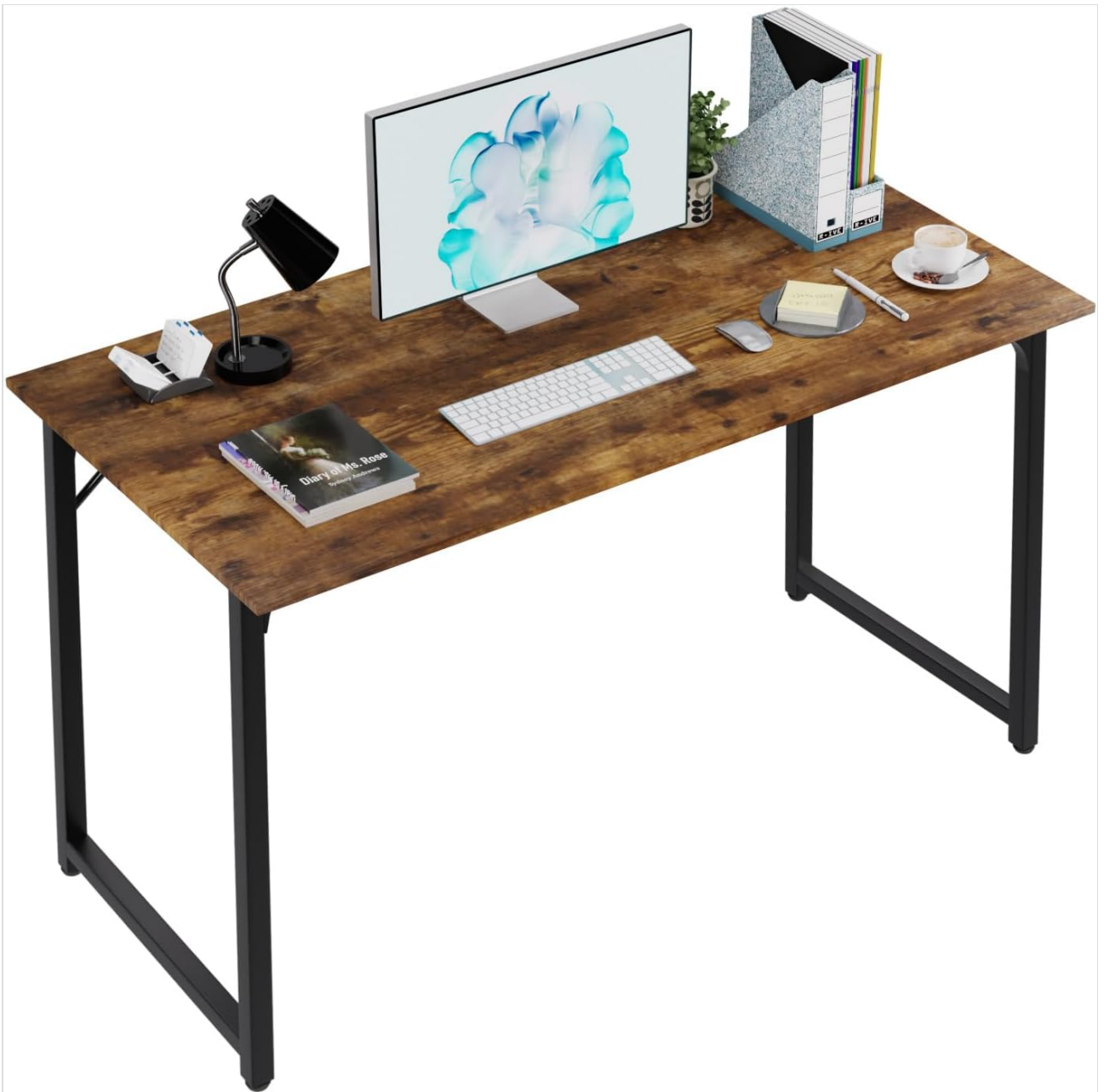
Image: Top-down view of the assembled desk, showcasing the spacious desktop.