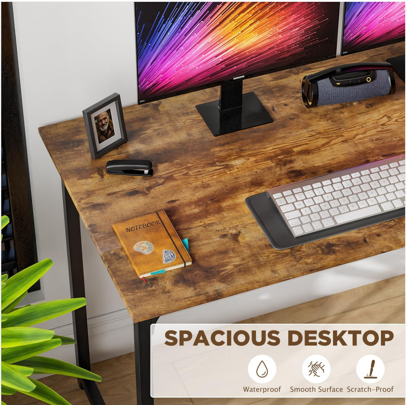
Image: Close-up of the desktop surface, highlighting its waterproof, smooth, and scratch-proof properties.