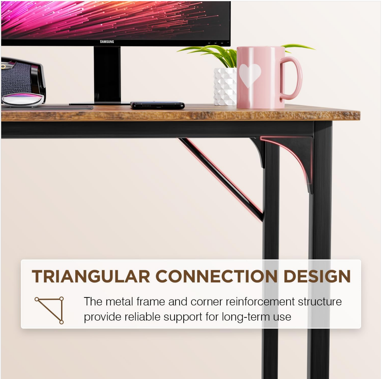
Image: Close-up of the triangular connection design, highlighting the metal frame and corner reinforcement structure for reliable support.

Identify the two main leg frames. Note the pre-drilled holes on the inner sides of the leg frames. Attach the cross braces (support bars) between the two leg frames using the provided hardware. Ensure the holes align correctly for a secure fit. Incorrect alignment will prevent the brace bars from fitting properly.