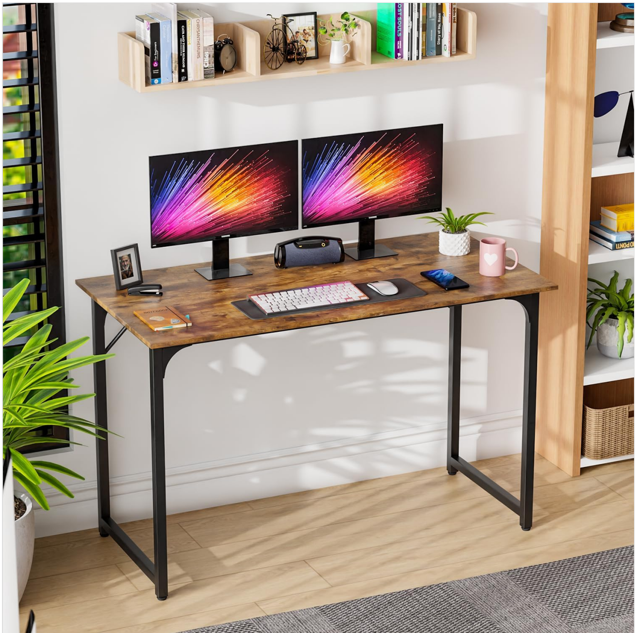
Image: The assembled desk in a home office setting, demonstrating its functional use.