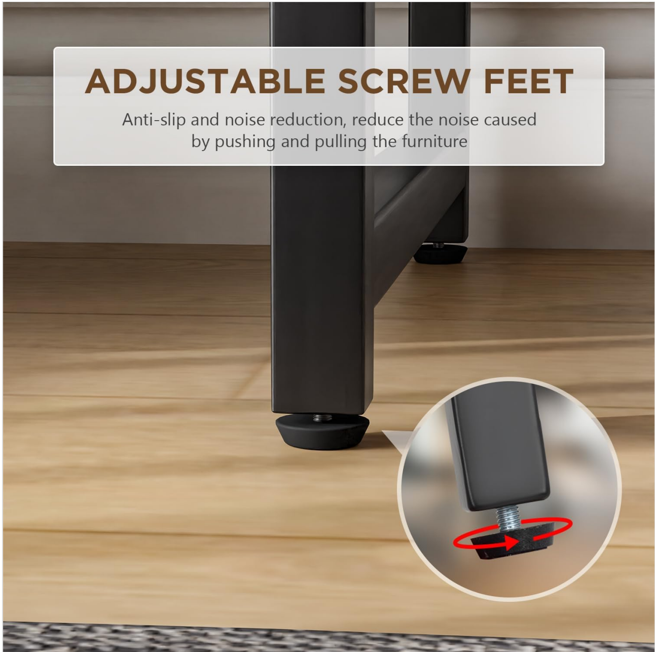
Image: Detailed view of the adjustable screw feet, designed for anti-slip and noise reduction.