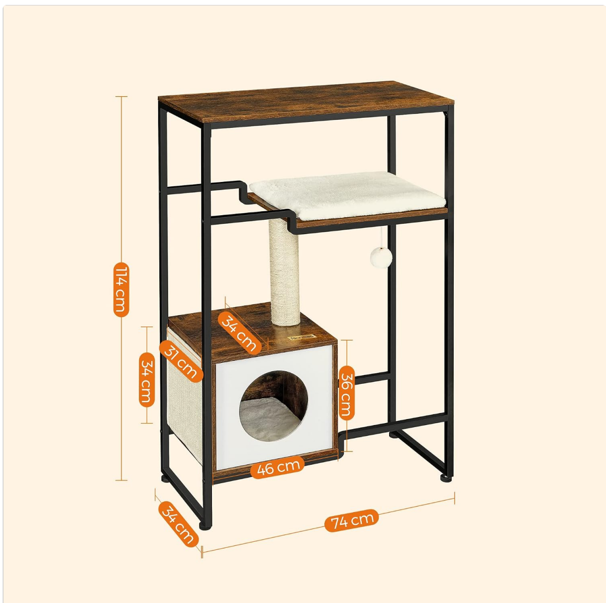
Image: Dimensional diagram of the cat tree house, illustrating its overall size and key component measurements.