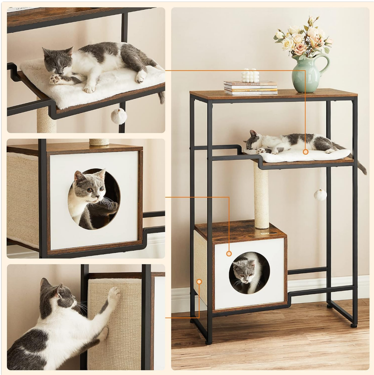
Image: A collage illustrating various ways cats interact with the tree, including resting in the cave, on the platform, and using the scratching post.