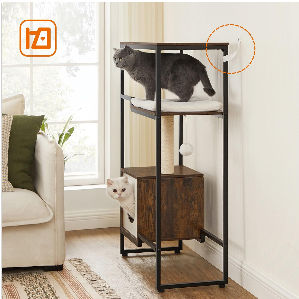
Image: Detail of the anti-tipping device, showing how it secures the cat tree to the wall for enhanced stability.