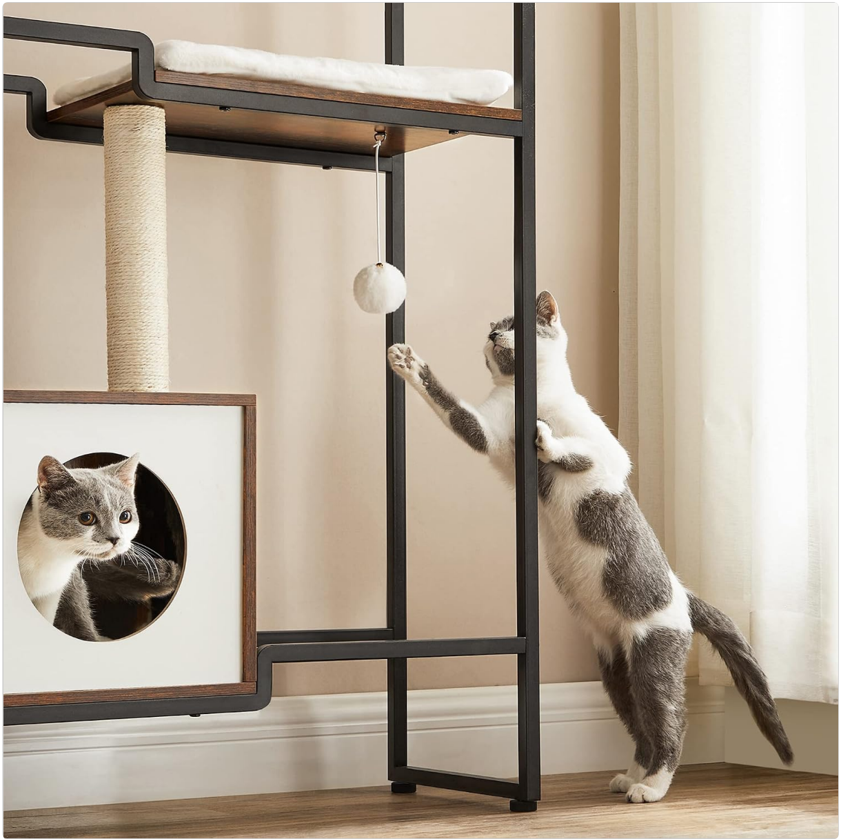
Image: A cat engaging with the dangling toy, highlighting the play features of the cat tree.