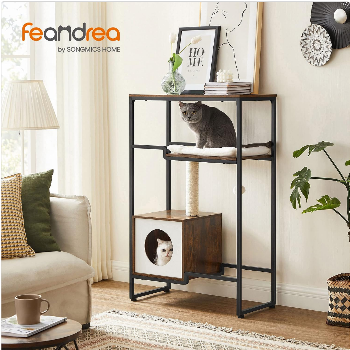
Image: The FEANDREA Cat Tree House PCT112X01, showcasing its rustic brown design and a cat comfortably resting on the upper platform.