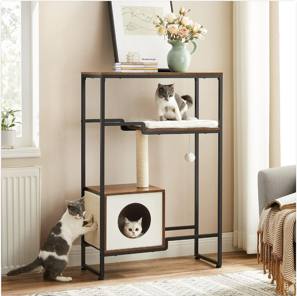
Image: Two cats utilizing the cat tree house, demonstrating the scratching surface and the upper resting platform.