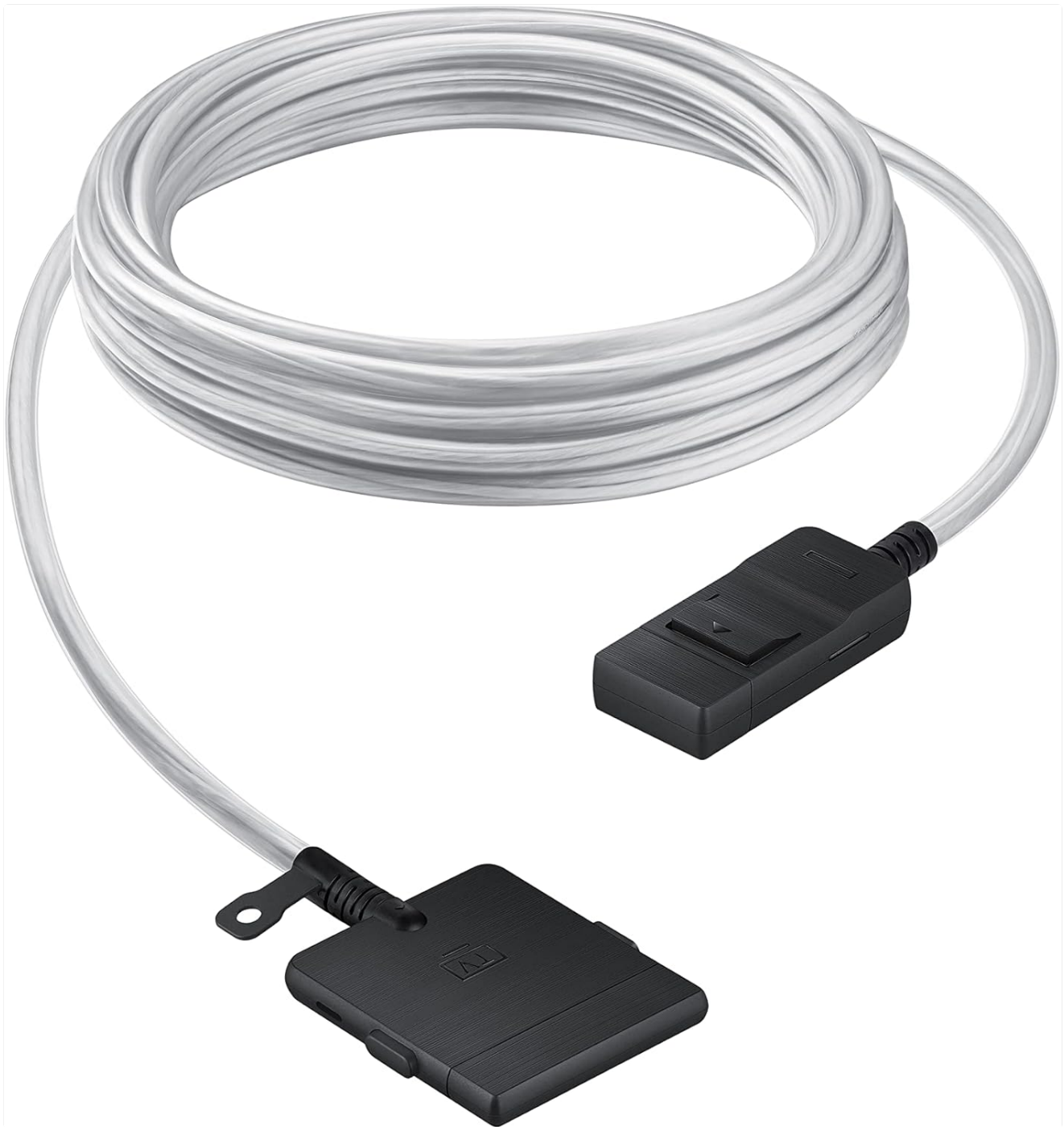
Image: The 5-meter One Invisible Connection Cable as it appears coiled in its packaging.

Your browser does not support the video tag.