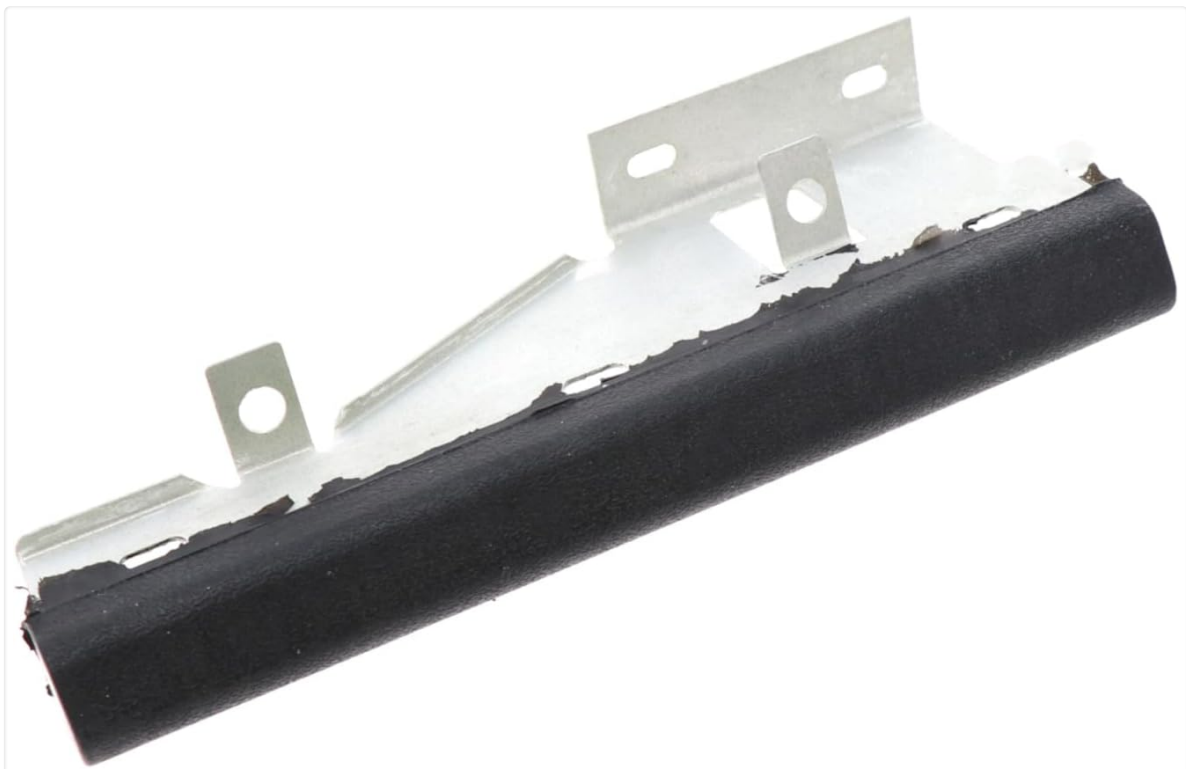
Figure 1: Angled view of the Freightliner Dash Support LH.

This manual provides essential information for the proper installation and maintenance of the Freightliner Dash Support LH, part number A18-26081-000. This component is designed to provide structural support for the dashboard assembly on the left-hand side of compatible Freightliner vehicles. Adhering to these instructions will help ensure correct fitment and long-term performance.