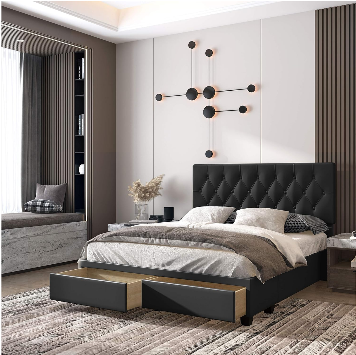
Figure 5.1: The integrated storage drawers in the open position.