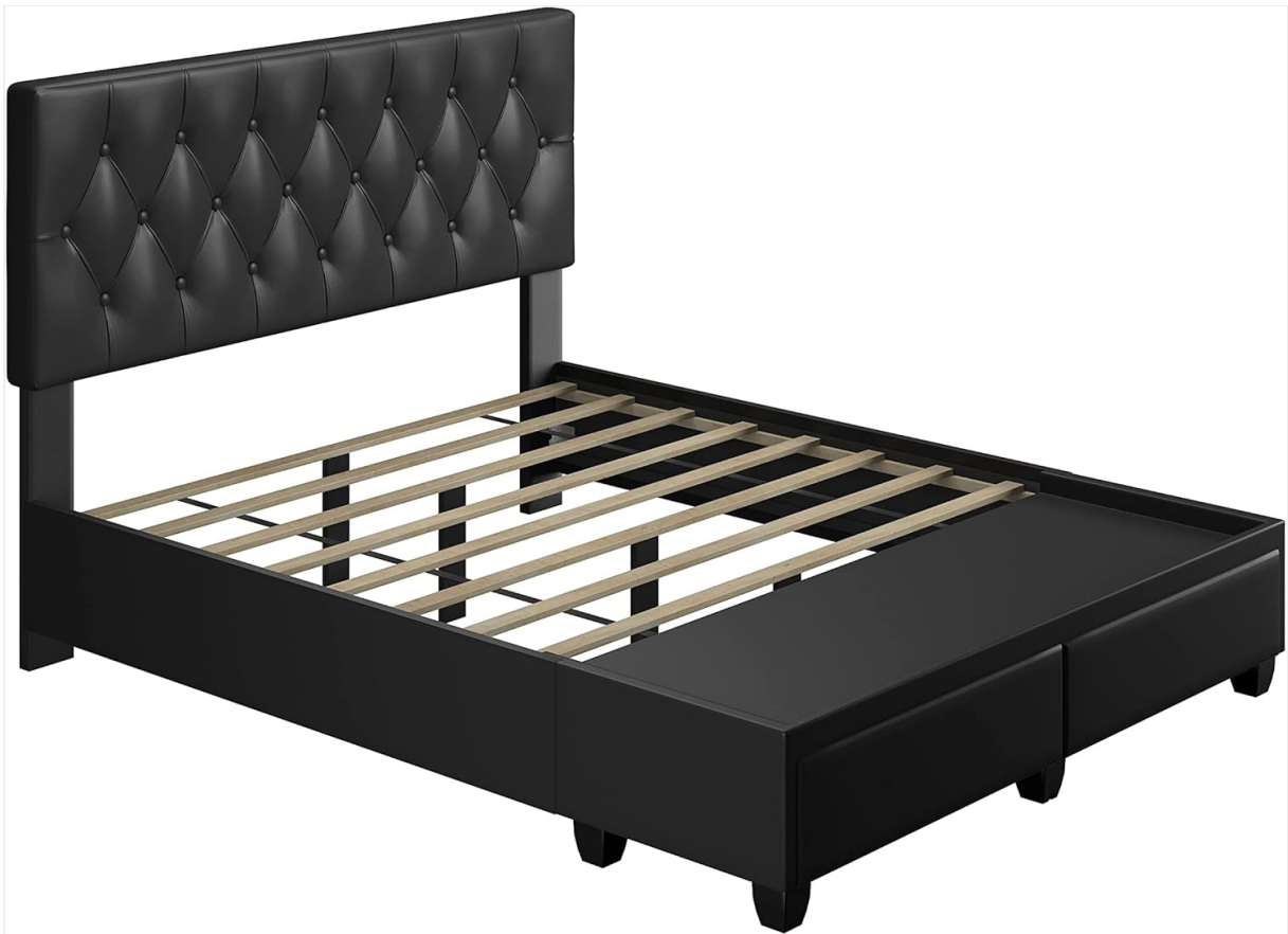
Figure 4.1: Overview of the bed frame structure with headboard, slats, and integrated storage drawers.