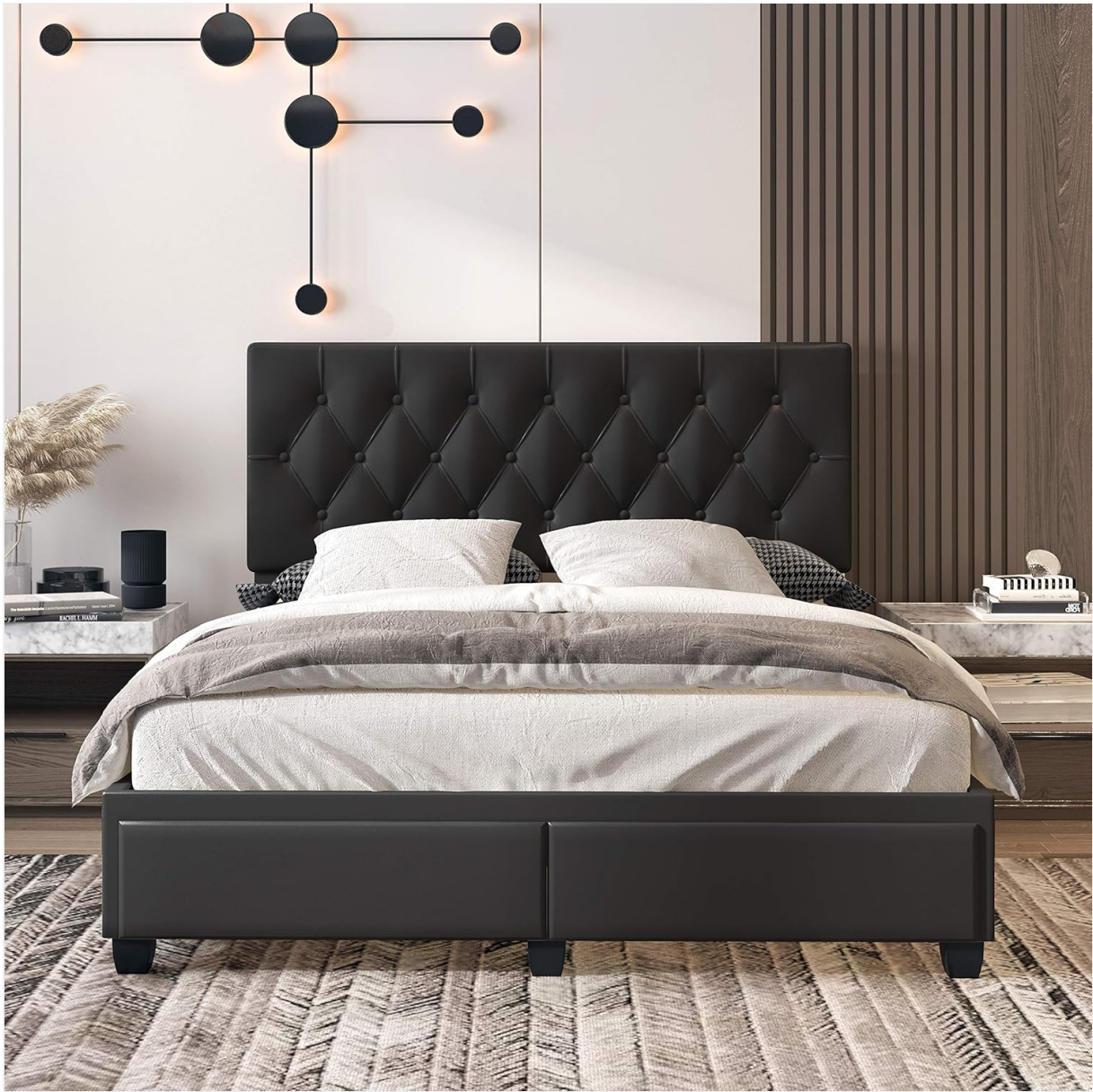
Figure 4.2: The Boyd Sleep Verona Platform Bed fully assembled, showcasing its design.