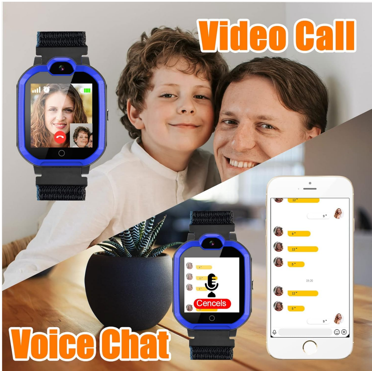
Figure 7: Video Call and Voice Chat features.