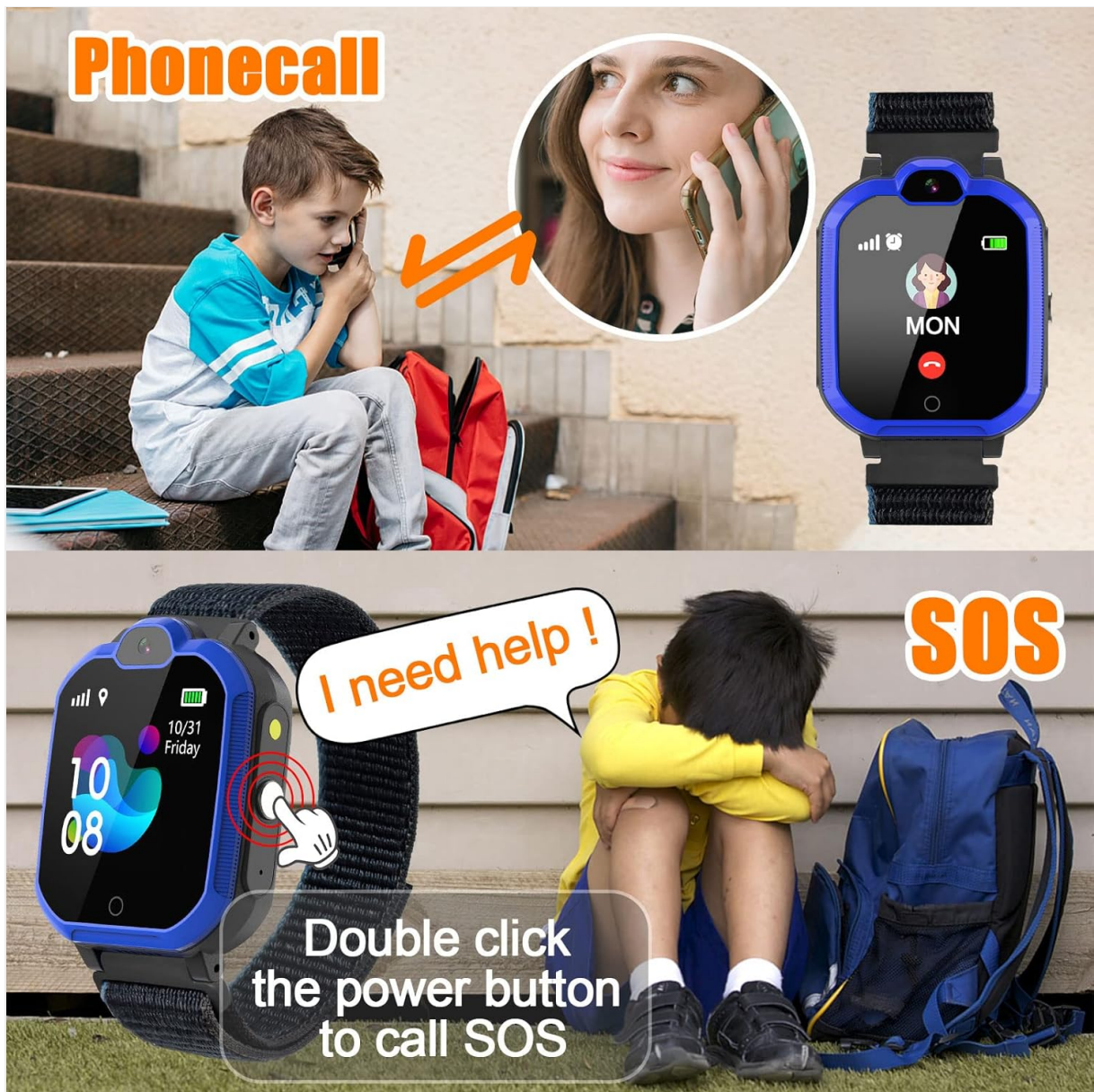
Figure 10: Voice chat interface on watch and phone.