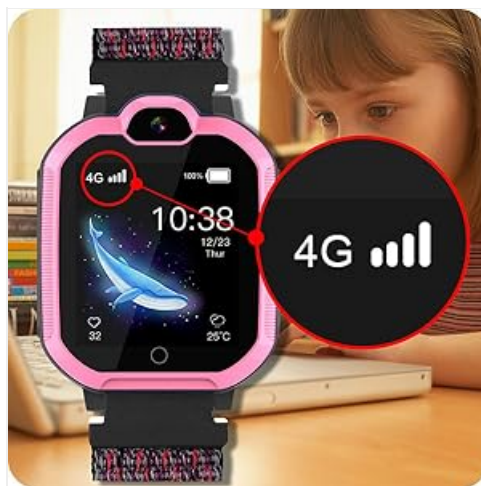
Figure 8: Initiating a video call.