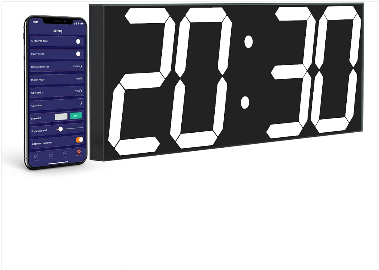
Figure 1: CHKOSDA Digital Wall Clock with mobile app interface.