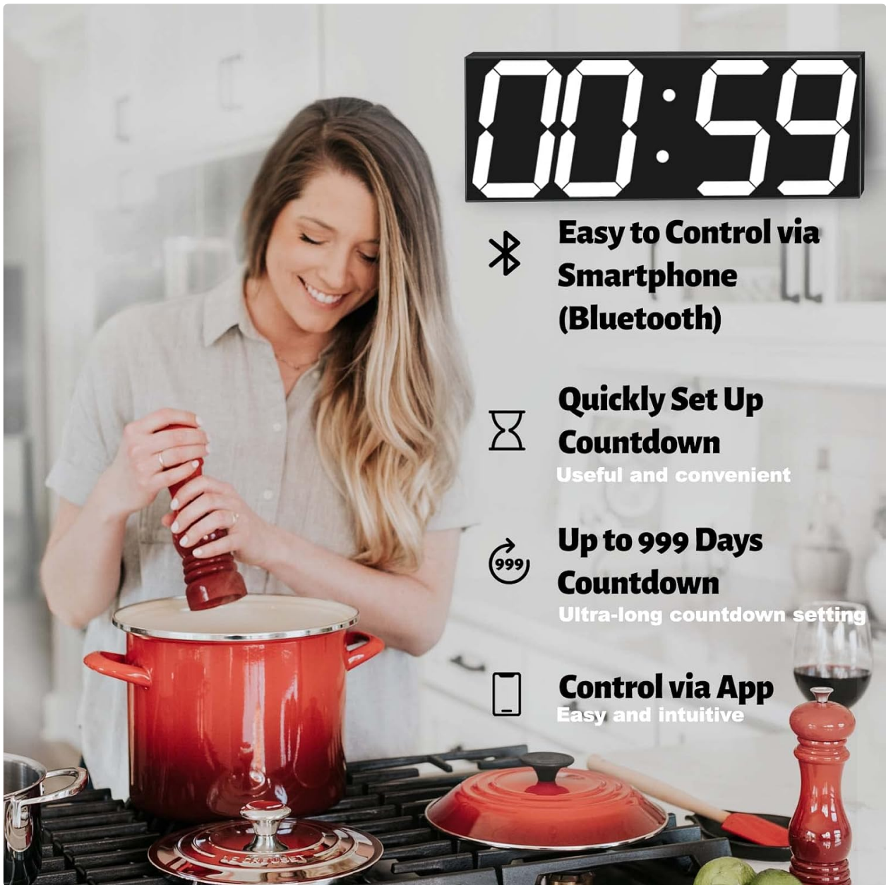
Figure 3: The clock's countdown feature in a kitchen setting.