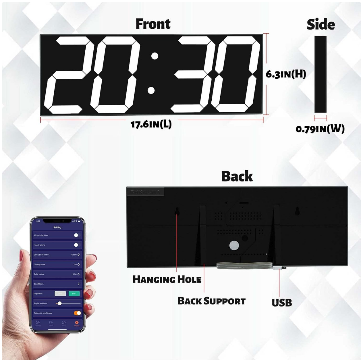
Figure 4: Physical dimensions and port locations for installation.