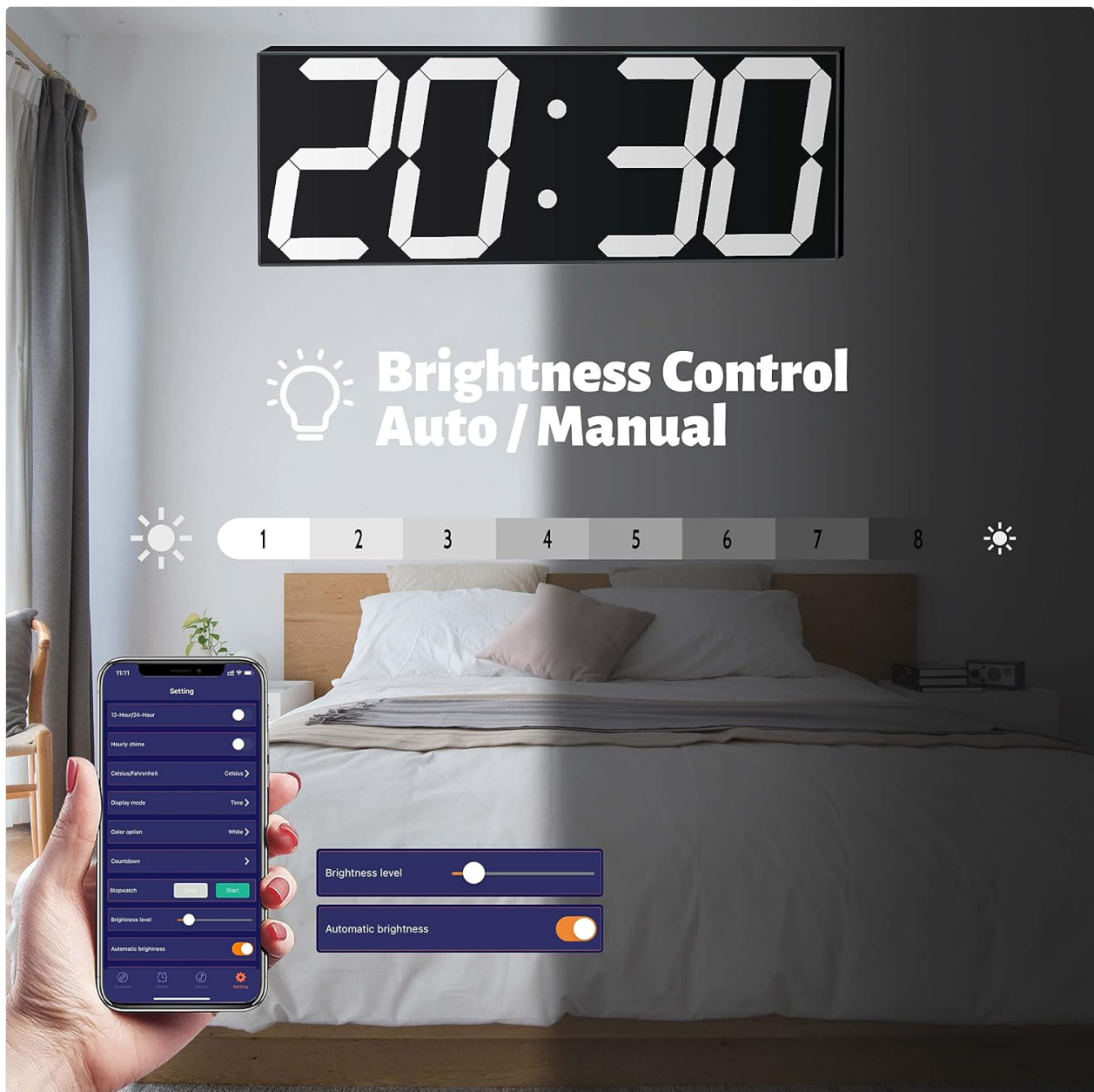
Figure 5: Brightness control interface in the mobile app.