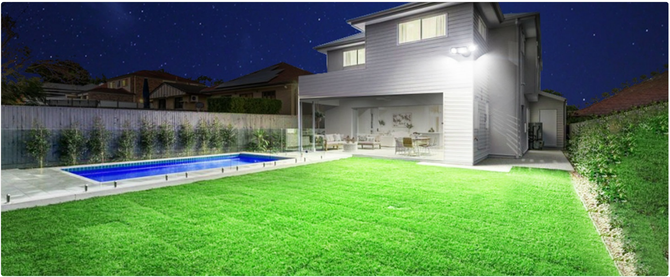
Figure 2: Eave and Wall Installation Examples. Demonstrates the versatility of mounting options.