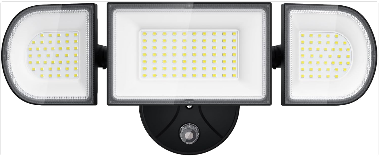
Figure 3: Adjustable Heads and Photocell. Illustrates the rotational capability of the light heads and the location of the photocell.