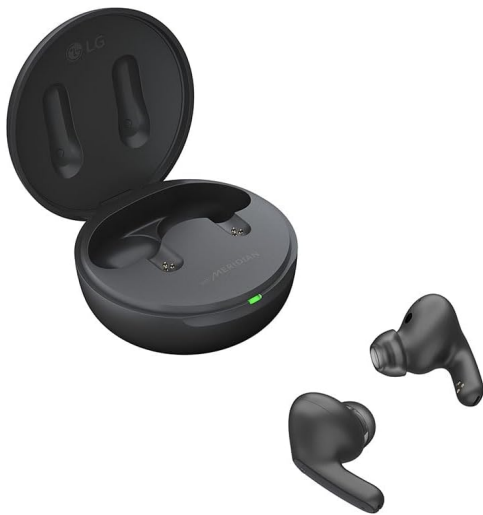
Image: The LG TONE Free FP5 earbuds placed inside their open charging case, illustrating how they fit for charging. Connect the USB-C charging cable to the charging port on the case and to a power source. The indicator light on the case will show the charging status. A full charge for the earbuds provides up to 8 hours of playtime, and the charging case provides an additional 14 hours. A quick 5-minute charge can provide up to 1 hour of playtime.