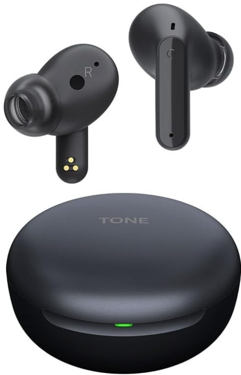
Image: The LG TONE Free FP5 earbuds resting in their charging case, with the case lid closed, showing the compact design.