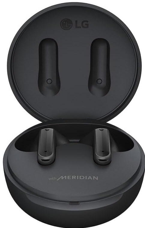
Image: A close-up view of the left and right LG TONE Free FP5 earbuds, highlighting the 'L' and 'R' indicators for correct placement.

Select the ear gels that provide the most comfortable and secure fit for your ears. Proper fit is crucial for optimal sound quality and Active Noise Cancellation performance.