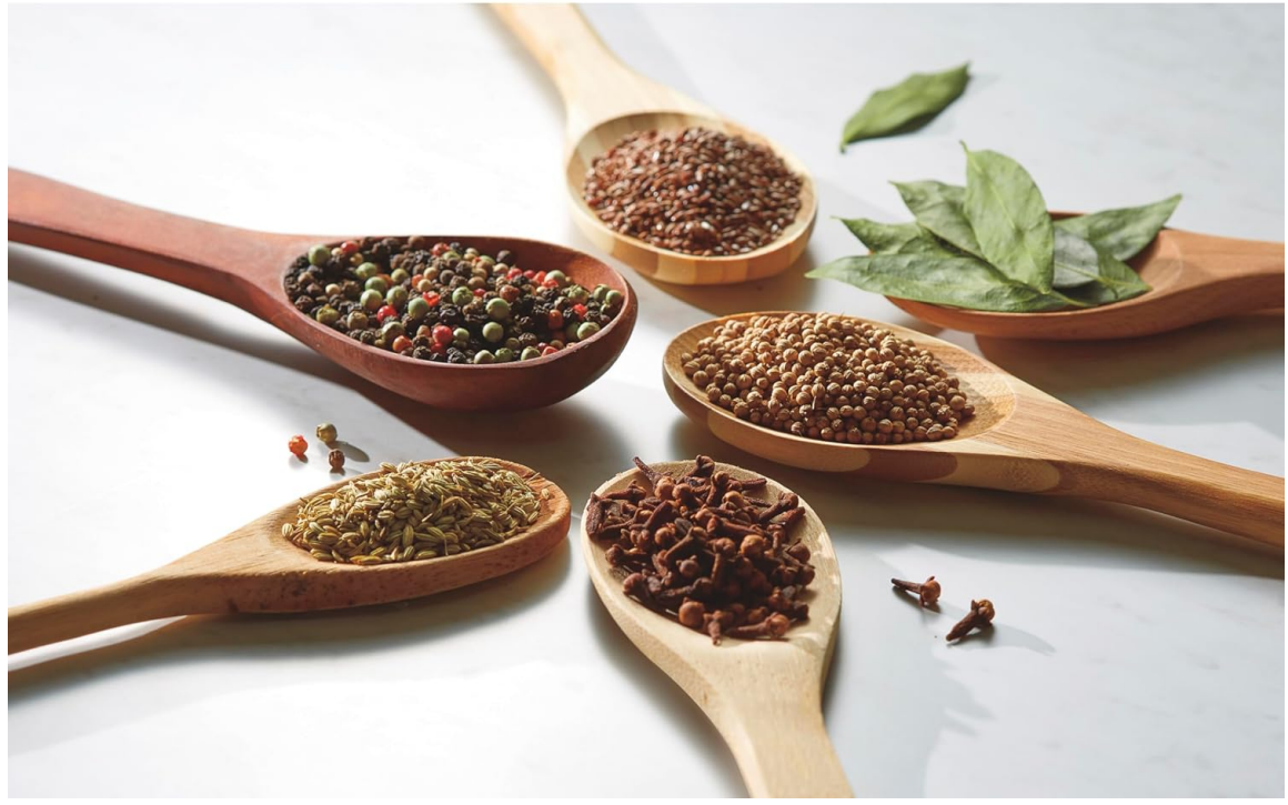
Image: An assortment of whole herbs and spices, including peppercorns, fennel, sesame, and chia seeds, displayed on wooden spoons.

From peppercorns and fennel to sesame and chia seeds