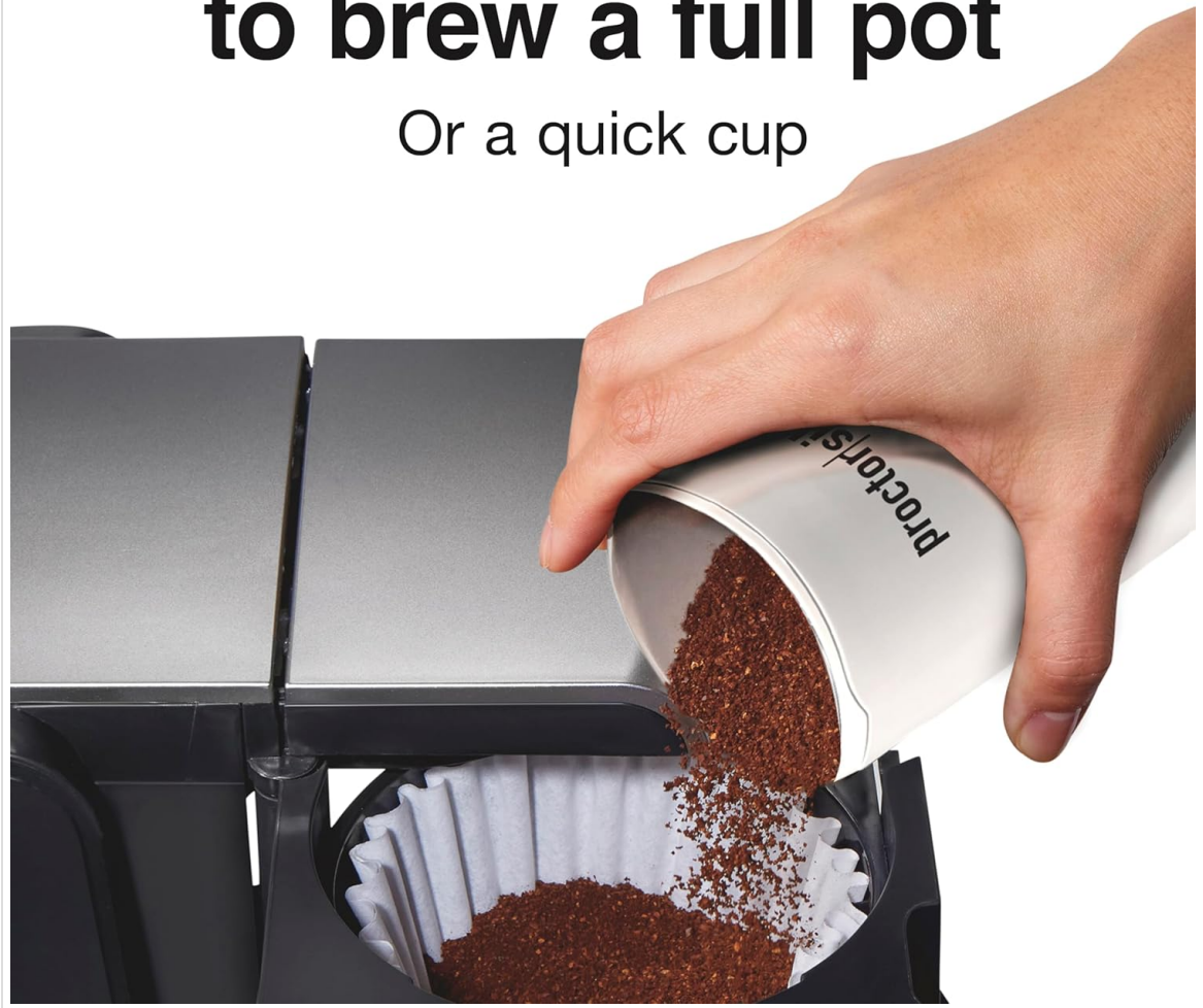
Image: A hand pouring freshly ground coffee from the grinder into a coffee filter in a coffee machine.