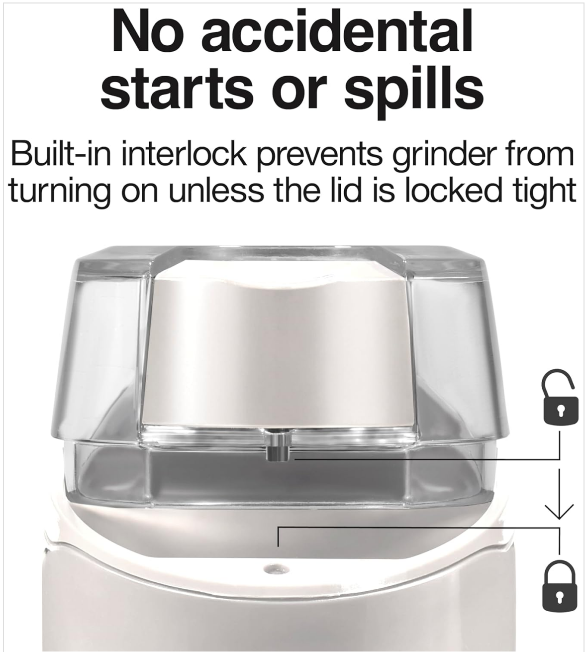
Image: A diagram illustrating the safety on/off button and lid interlock mechanism.

Built-in interlock prevents grinder from turning on unless the lid is locked tight