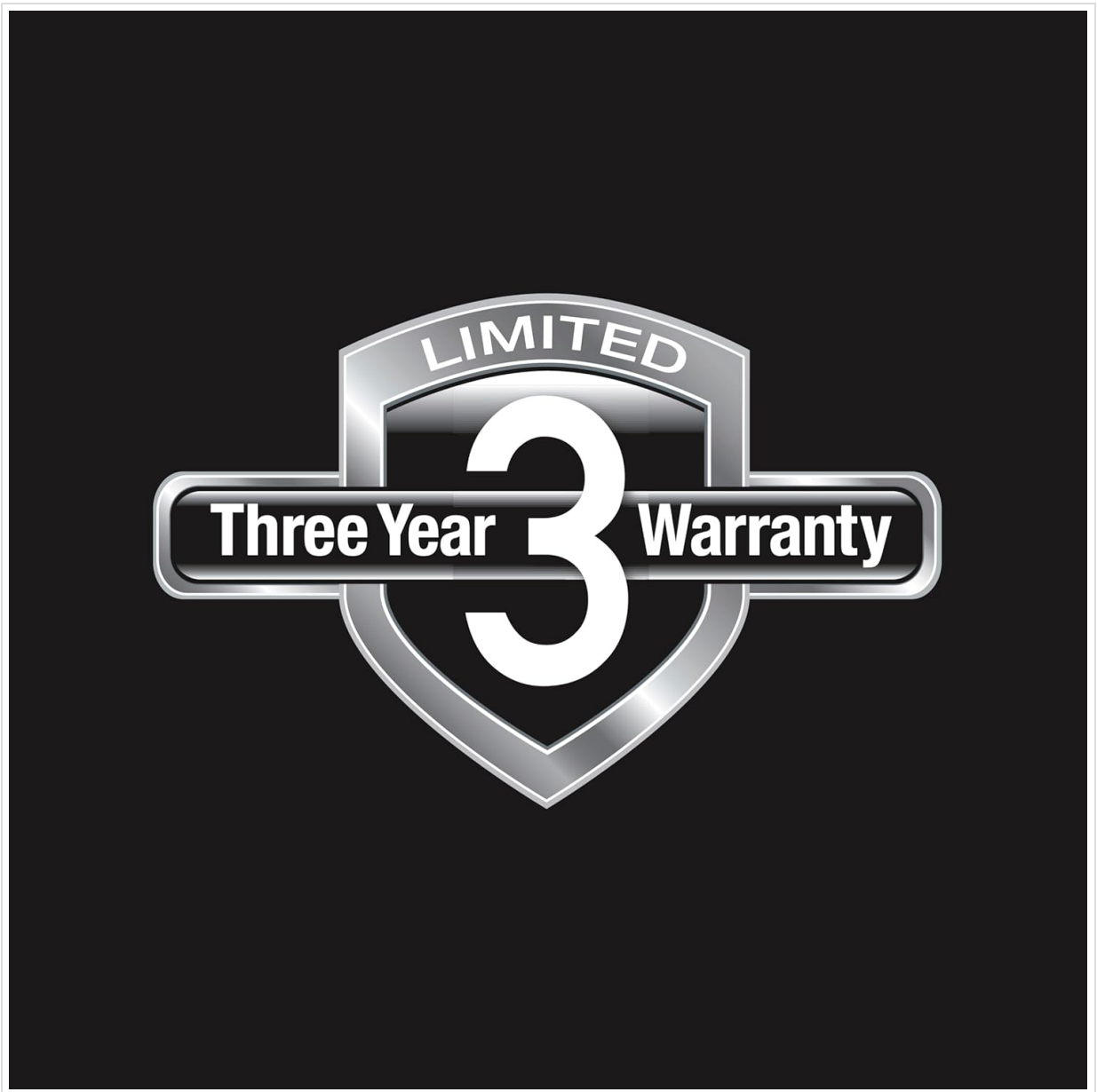
Image: A badge indicating a Limited Three Year Warranty.

For detailed warranty information, product registration, or customer support, please visit the official Proctor Silex website or contact their customer service department.