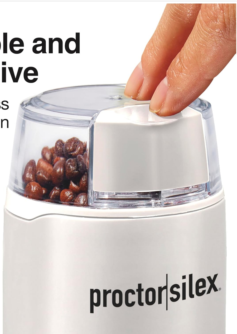
Image: A hand pressing the button on the grinder, showing coffee beans inside the clear lid.

Just press the button to grind coffee & release to stop