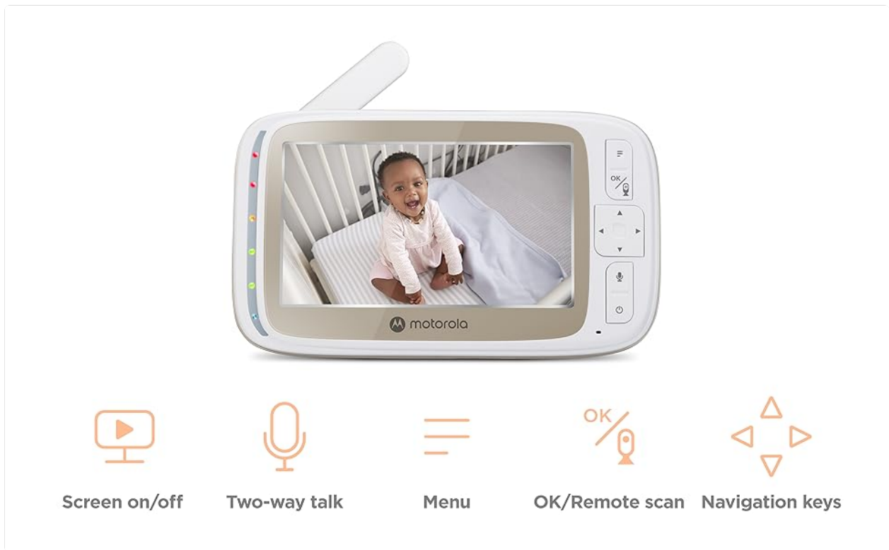
Image 4.1: Key controls on the parent unit for easy navigation and feature access.

The parent unit features a 5-inch screen for clear video monitoring. Use the navigation keys and 'OK' button to access various functions.