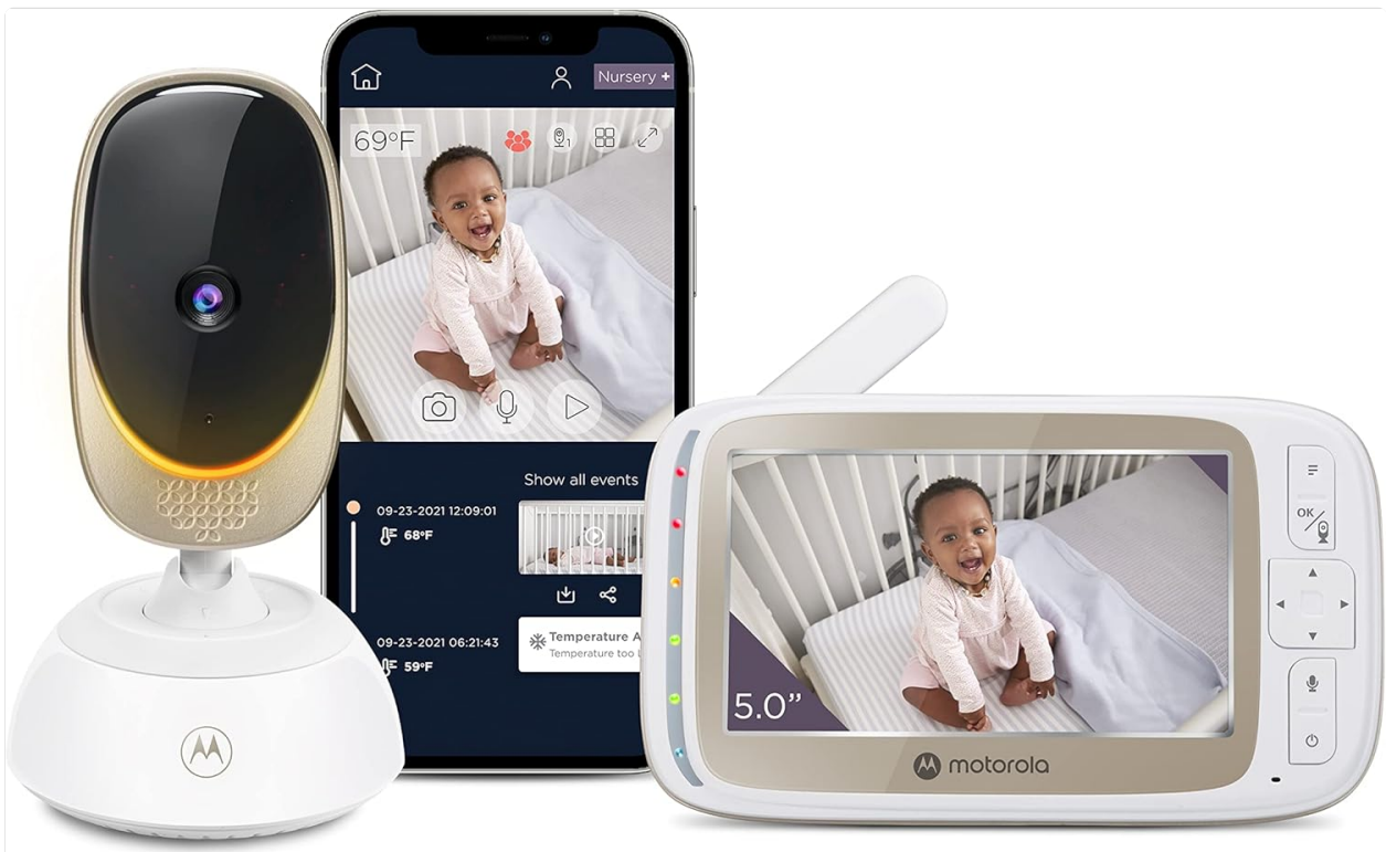
Image 1.1: The Motorola Nursery VM85CONNECT system, showing the camera unit, parent monitor, and the companion smartphone application interface.

This manual provides essential instructions for the safe and efficient operation of your Motorola Nursery WiFi Baby Monitor VM85CONNECT. Please read this manual thoroughly before using the product and retain it for future reference.