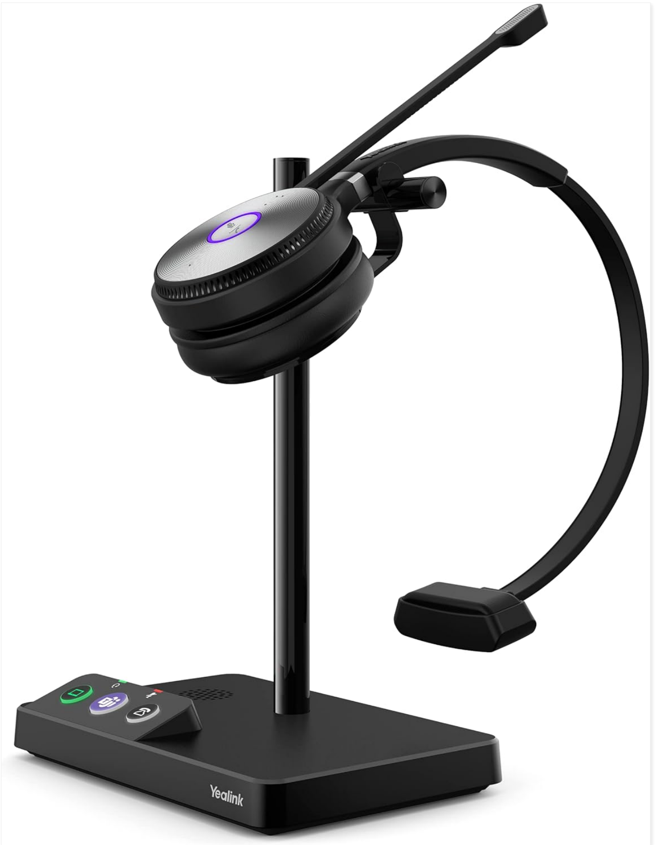
Figure 3.1: Yealink WH62 Mono UC Headset on its charging base.