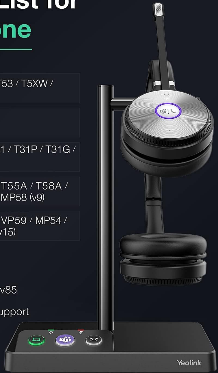
Figure 5.1: Broad compatibility with mainstream UC applications.