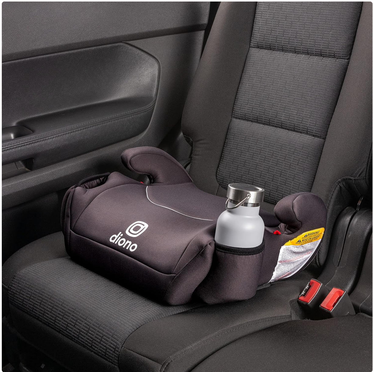
Image: A Diono Solana booster seat installed in a vehicle, highlighting the integrated cup holder.