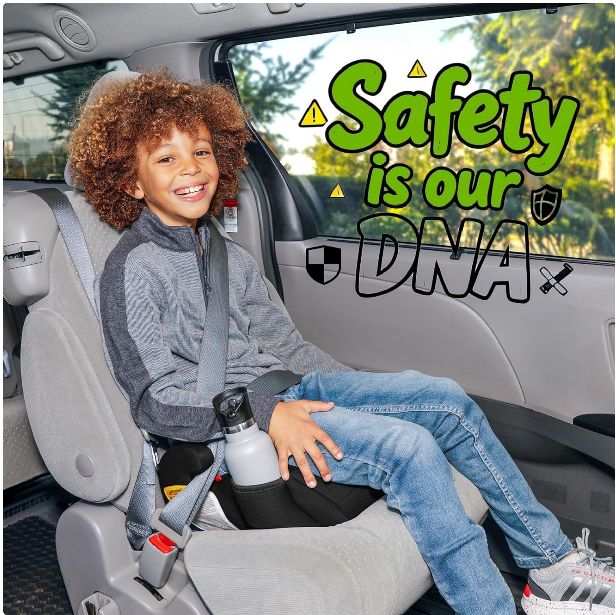
Image: A child correctly seated in the Diono Solana booster, demonstrating proper seat belt fit.