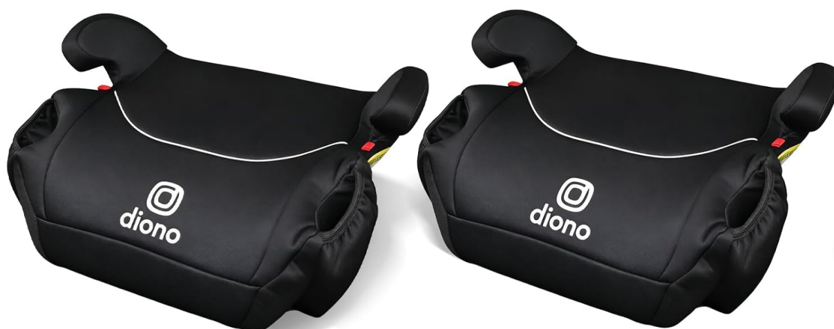
Image: Two Diono Solana backless booster seats, showcasing their compact design.