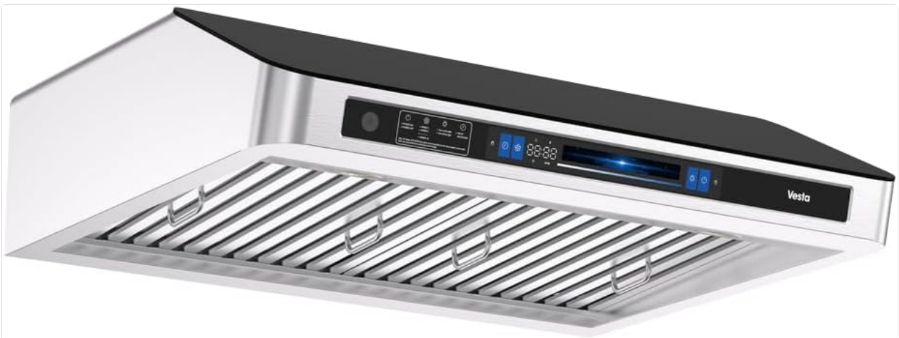
Figure 2: Angled view of the range hood, highlighting the control panel and baffle filters.