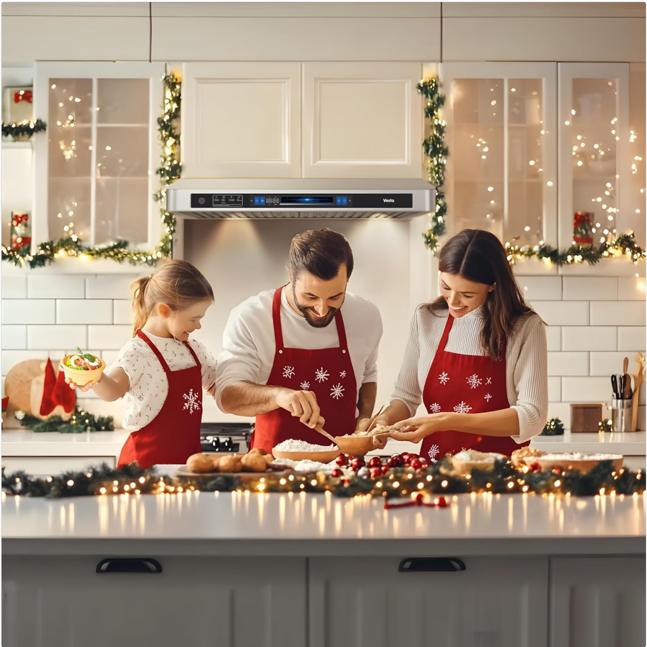
Figure 1: Front view of the Vesta Augusta 30-inch Under Cabinet Range Hood.