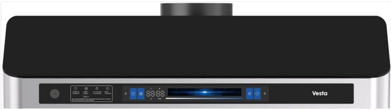
Figure 3: Detailed view of the mechanical control buttons for fan speed and lighting.