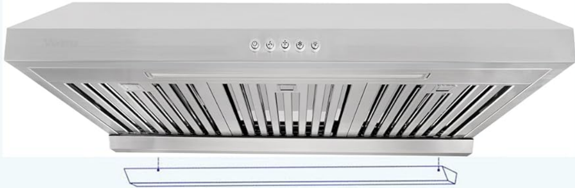
Figure 7: Baffle filters are dishwasher friendly for easy cleaning.