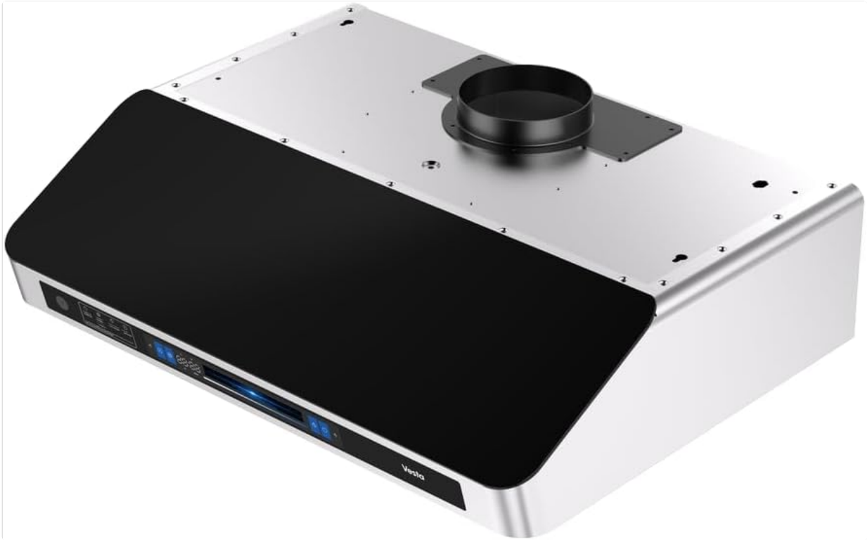
Figure 5: Top view of the range hood, illustrating the 6-inch round vent outlet.