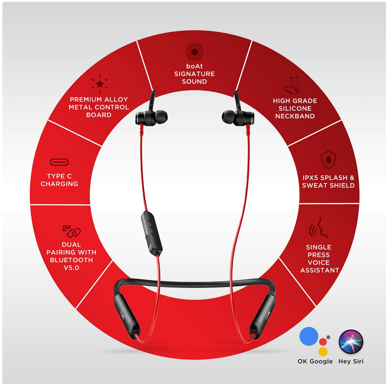
Image: Overview of the boAt Rockerz 335 Pro highlighting its key features and design elements.

Familiarize yourself with the components of your boAt Rockerz 335 Pro neckband.