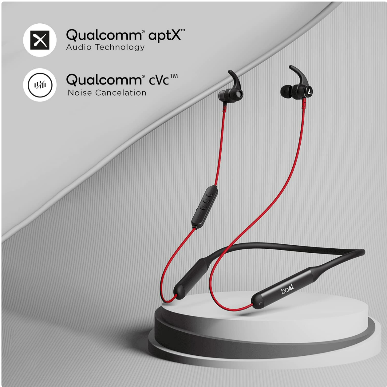
Image: Highlights the Qualcomm aptX audio technology for superior sound and cVc noise cancellation for clear calls.