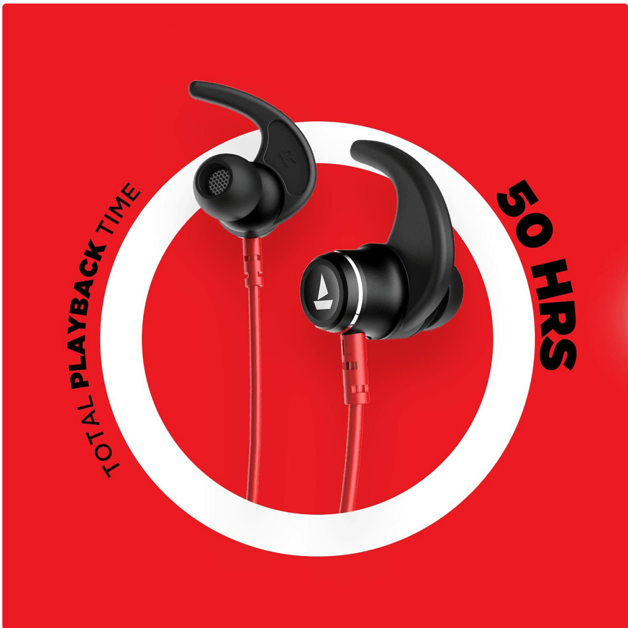
Image: Illustrates the impressive 50-hour total playback time of the neckband.