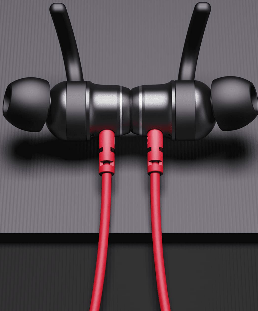
Image: Detail of the power-sensitive smartbuds, illustrating how separating them powers the device on and uniting them powers it off.

Separate to Power on / Unite to Power off