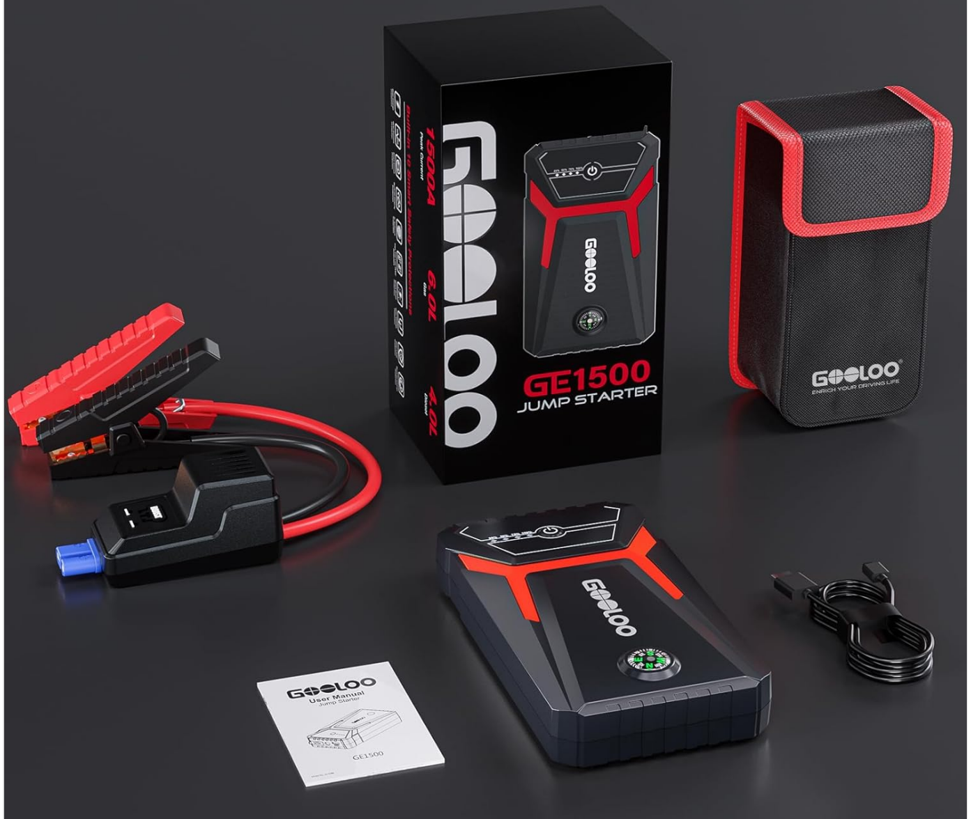
Image: All items included in the GOOLOO GE1500 product box.