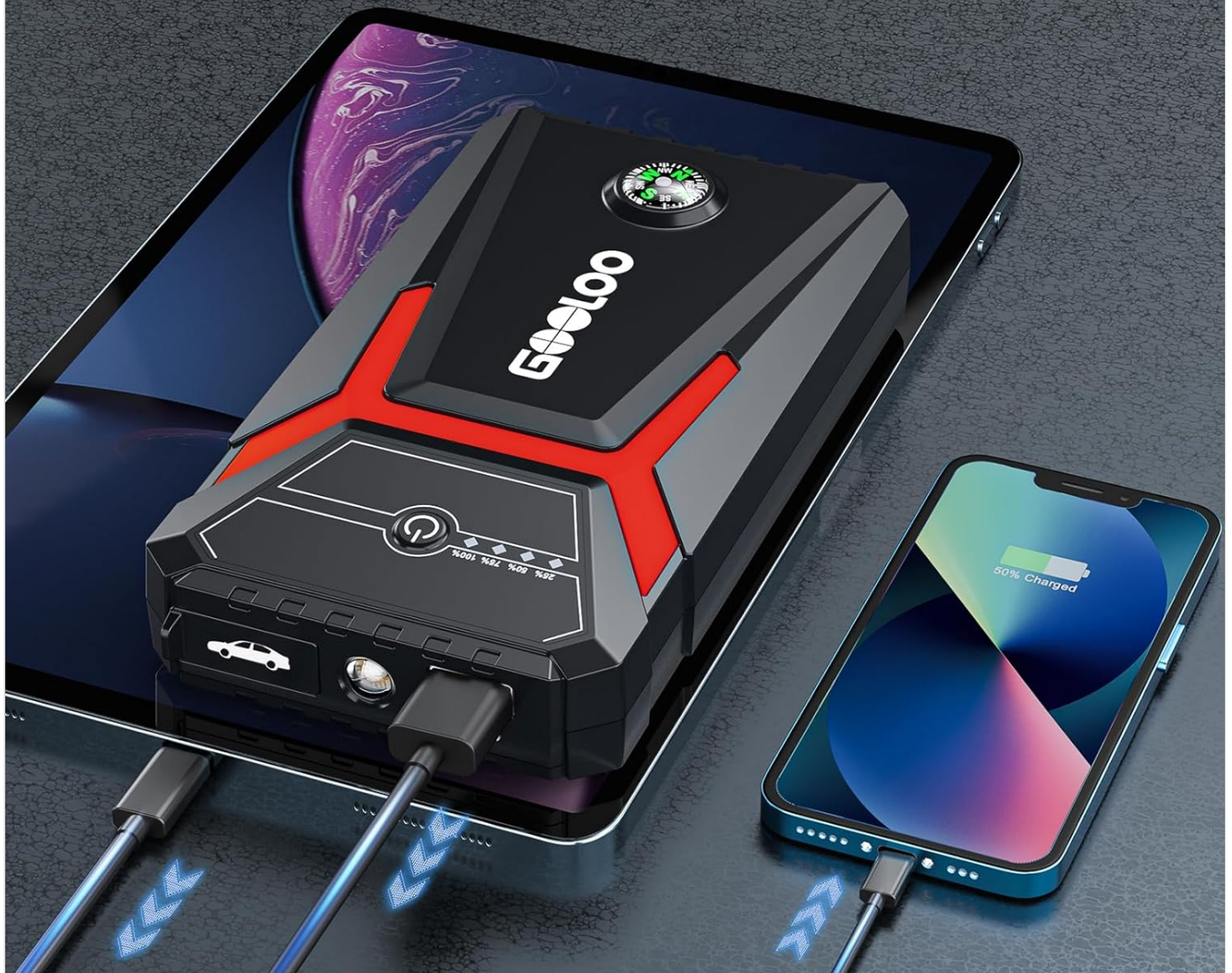
Image: The GOOLOO GE1500 being used to charge a tablet and a smartphone.

Always Have A Flashlight And A Charger In Your Car