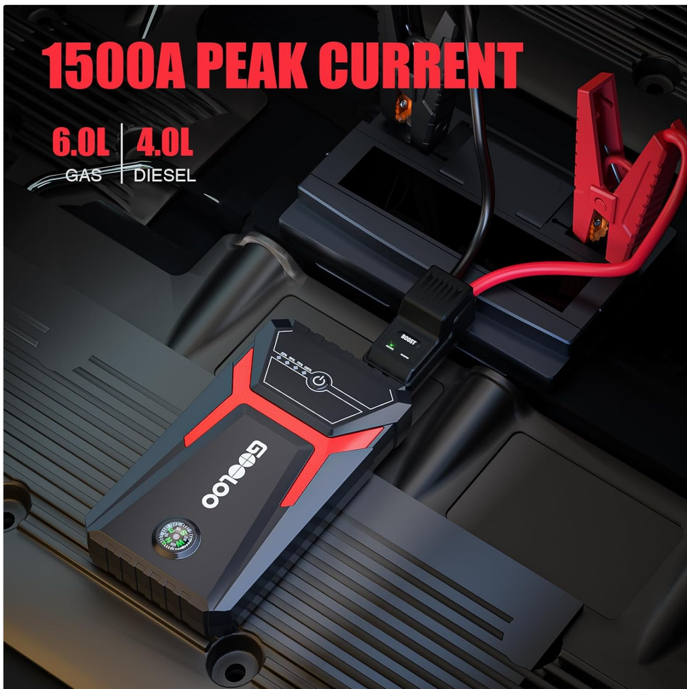
Image: The GOOLOO GE1500 Jump Starter connected to a vehicle battery.