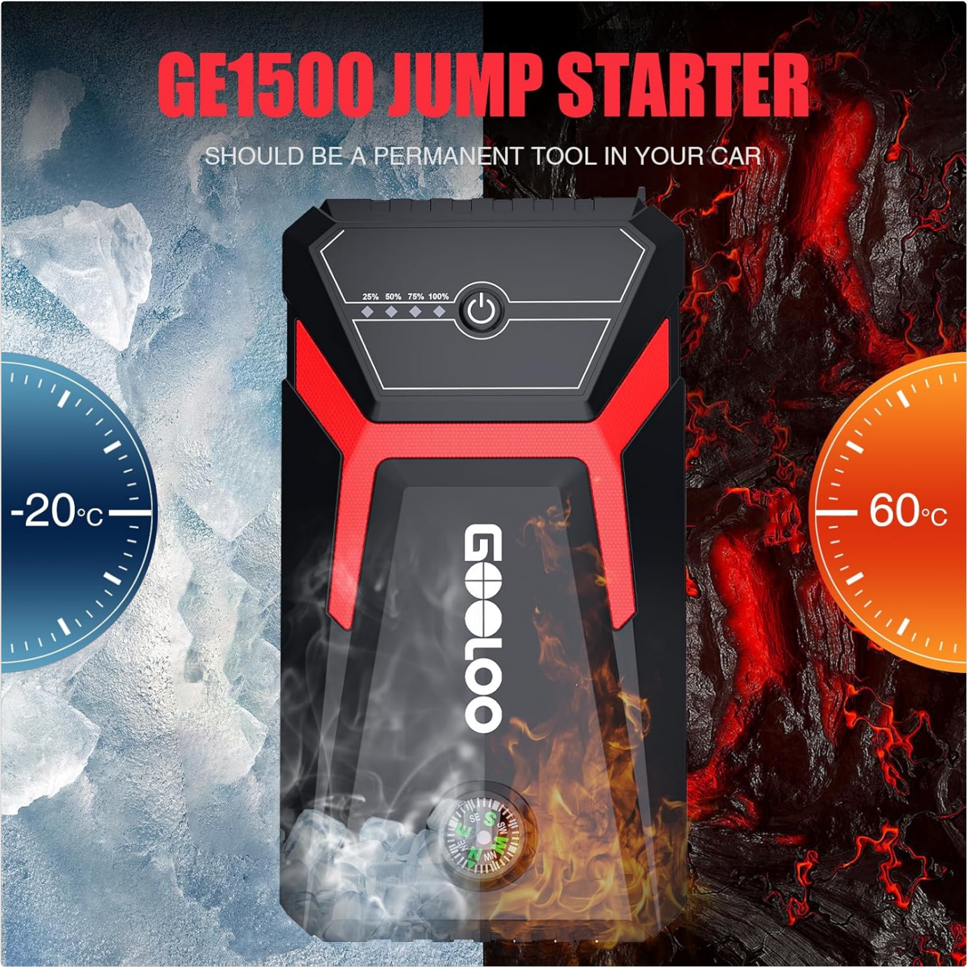
Image: The GOOLOO GE1500 is designed to operate in a wide temperature range.