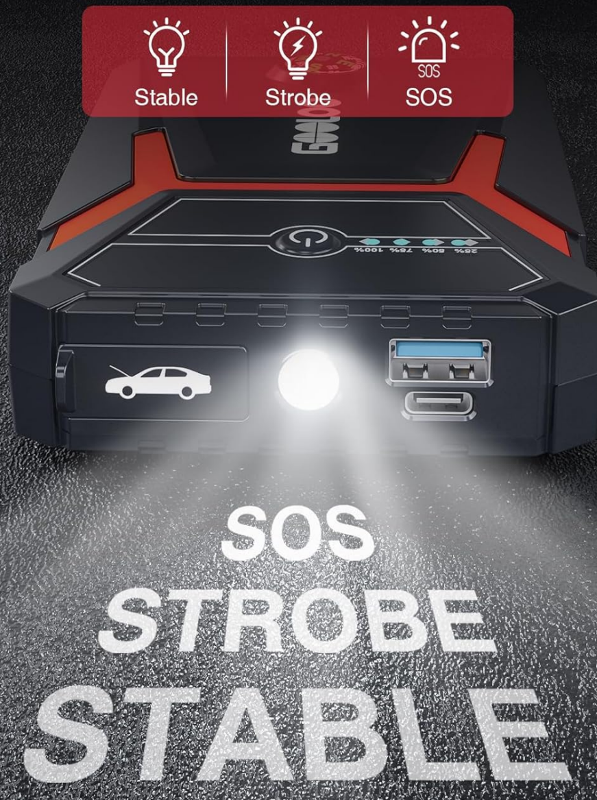
Image: The GOOLOO GE1500's LED flashlight demonstrating its various modes.