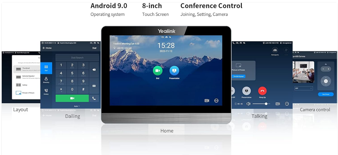
Figure 6: CTP18 Touch Panel User Interface. This image illustrates various screens of the CTP18 Touch Panel, including meeting controls, dialing, and camera adjustments.