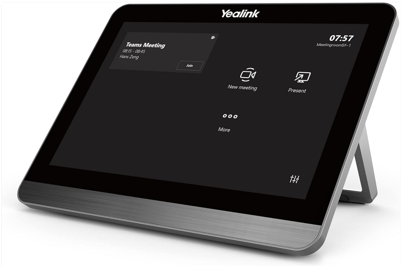
Figure 4: Yealink CTP18 Touch Panel. This image displays the CTP18 Touch Panel, which serves as the primary control interface for the A30 Meeting Bar system.