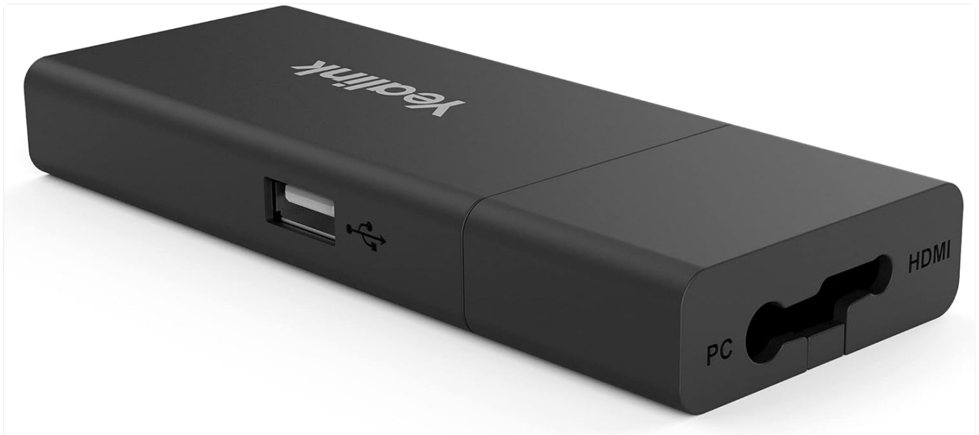
Figure 5: Yealink VCH51 Sharing Box. This image shows the VCH51 Sharing Box, used for wired content sharing from a PC.