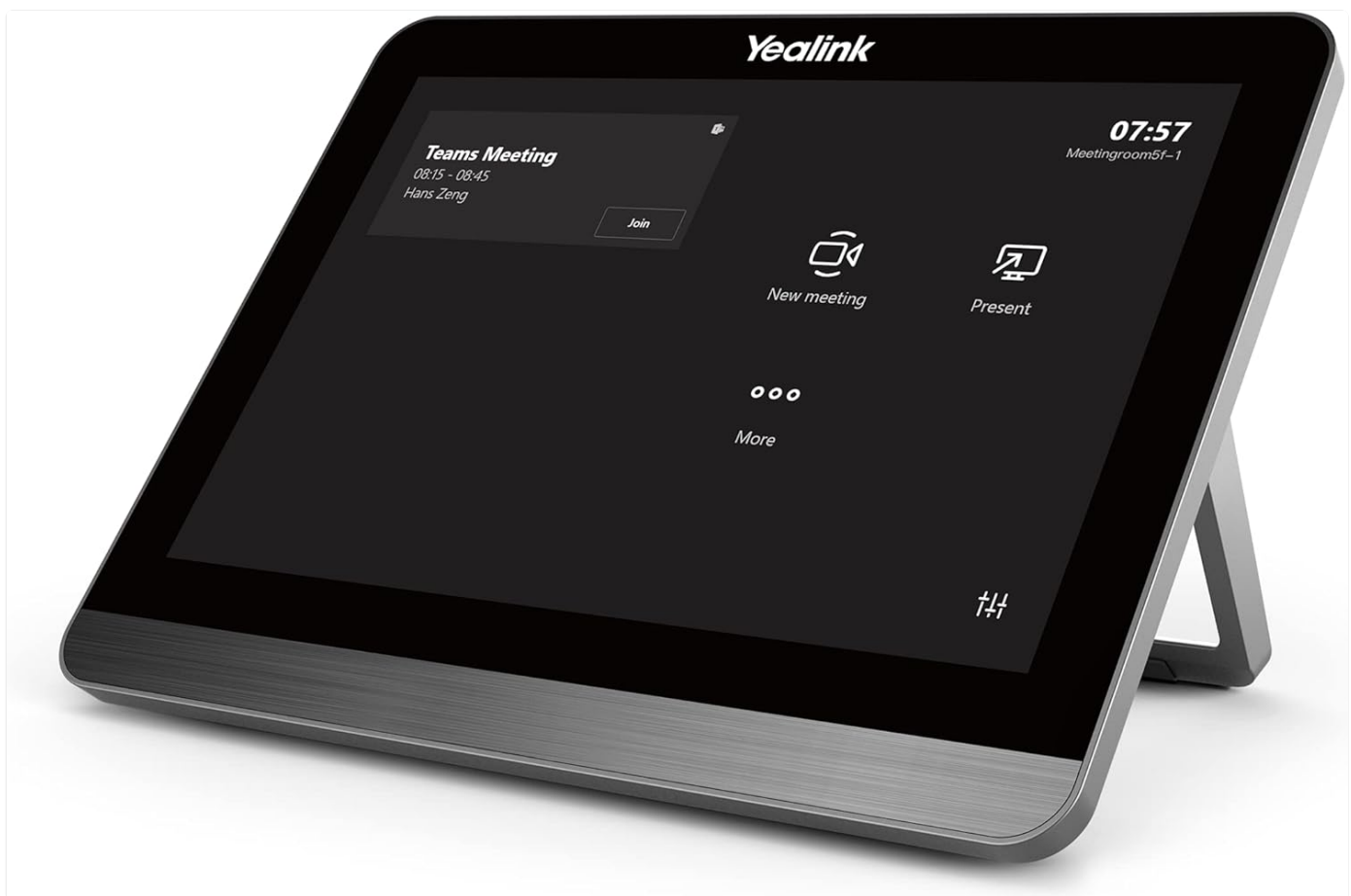
Figure 7: CTP18 Touch Panel Teams Interface. This image shows the CTP18 Touch Panel displaying the Microsoft Teams meeting interface, with options to join or start a new meeting.