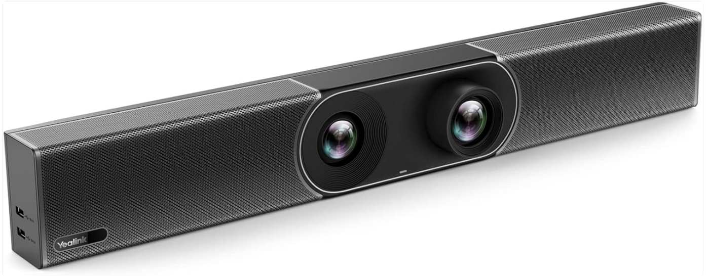
Figure 2: Yealink A30 Meeting Bar. This image shows the front view of the A30 Meeting Bar, highlighting its dual cameras and speaker grille.

The A30 Meeting Bar can be placed on a table or mounted above/below a display. Use the provided mounting bracket for wall or display mounting.