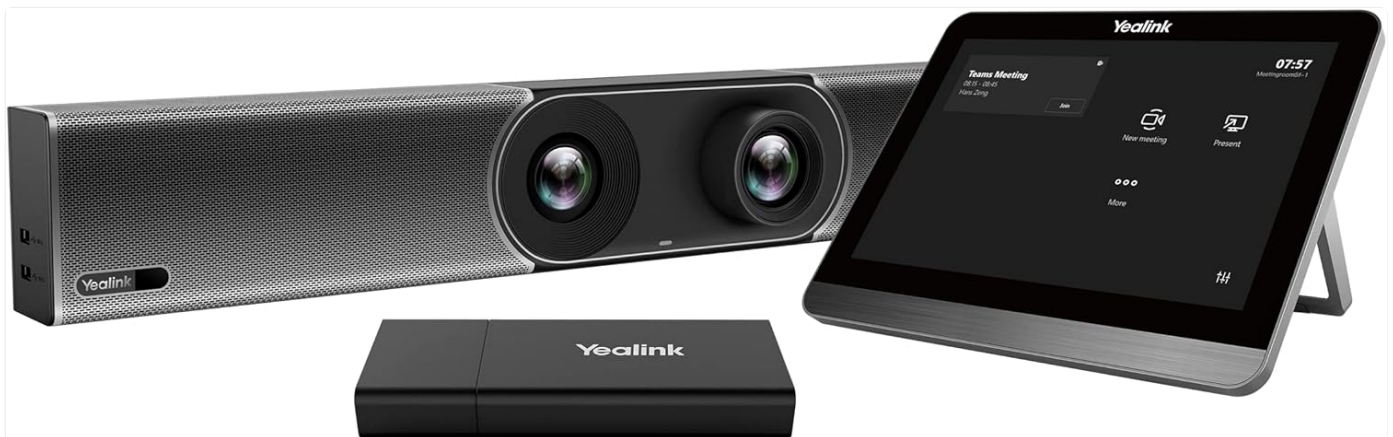
Figure 1: Complete Yealink A30 Meeting Bar Bundle. This image displays the Yealink A30 Meeting Bar, the CTP18 Touch Panel, and the VCH51 Sharing Box, which are the primary components of this video collaboration system.

The Yealink A30 Meeting Bar is an all-in-one video collaboration solution designed for medium-sized meeting rooms. This bundle includes the A30 Meeting Bar, the CTP18 Touch Panel, and the VCH51 Sharing Box, providing a comprehensive system for seamless video conferencing and content sharing, especially optimized for Microsoft Teams environments.