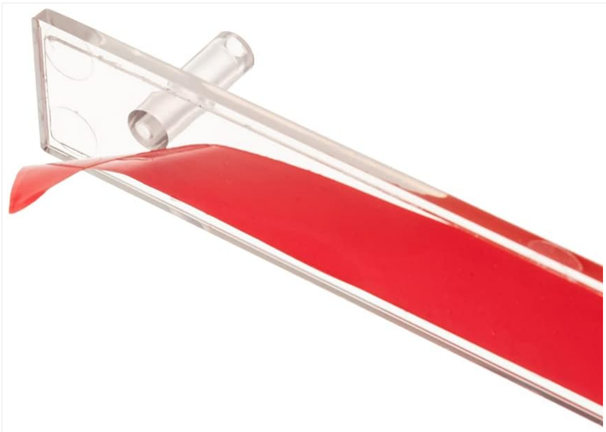
Figure 4.3: Detail of the adhesive backing on a mounting strip, ready for installation.