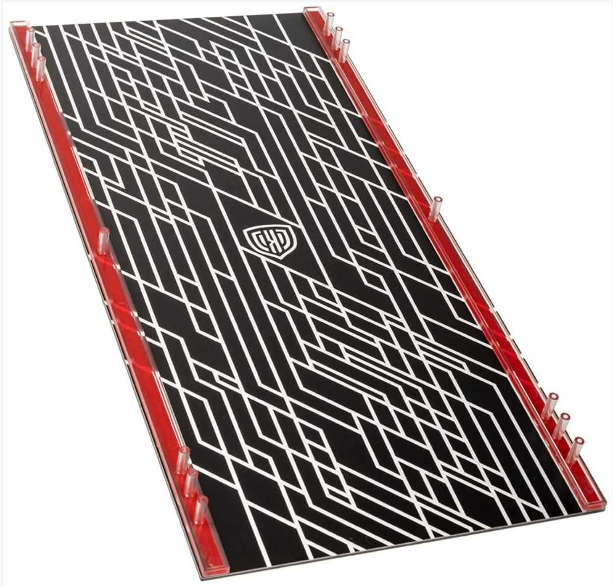
Figure 4.1: The Kolink Unity Nexus Landscape Alternative Replacement Front Panel.