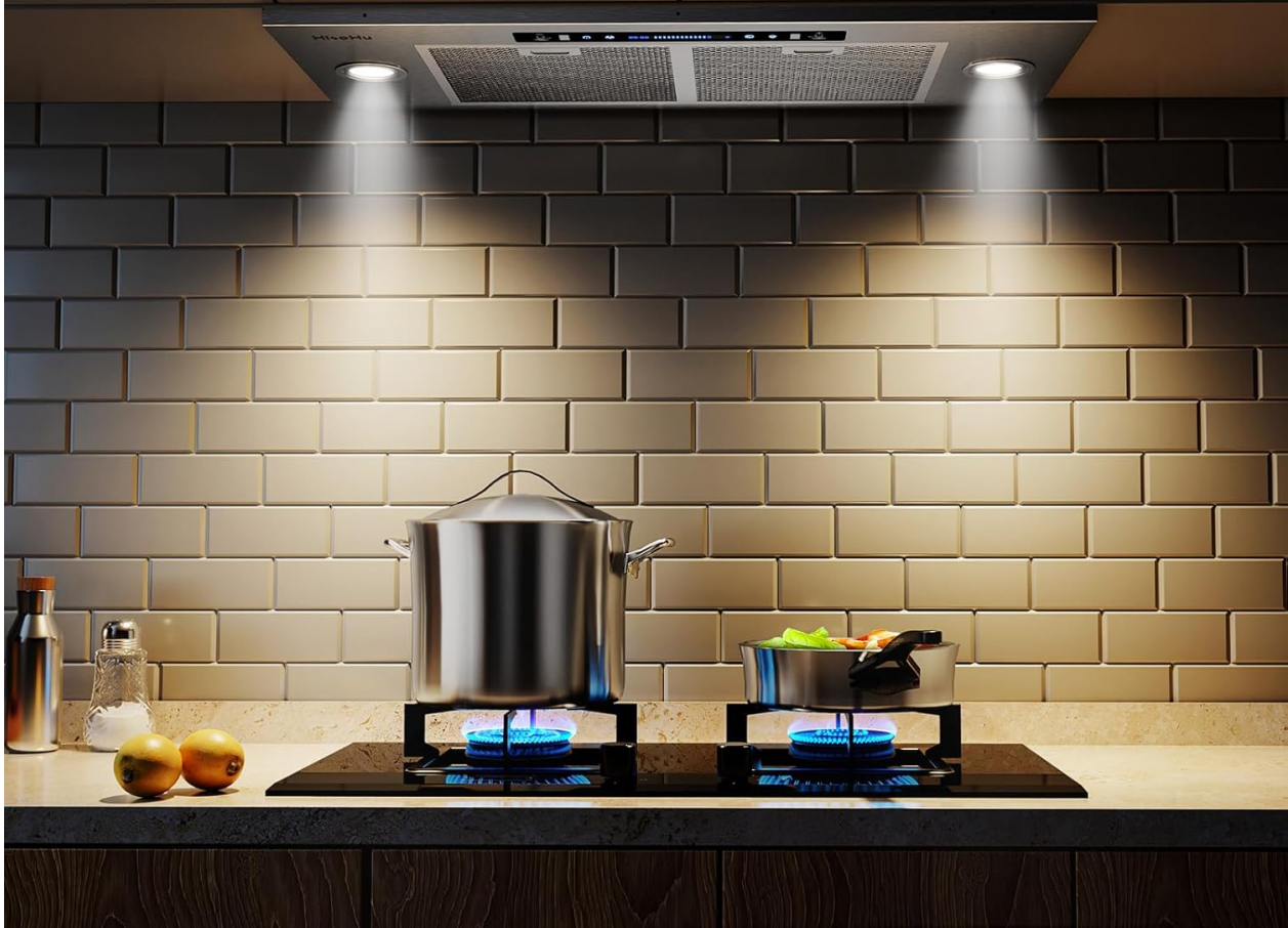
Figure 4.3: The range hood features dimmable 4500K LED lights for adjustable illumination.

4500K bright light and allowing you to adjust the illumination according to your preference.