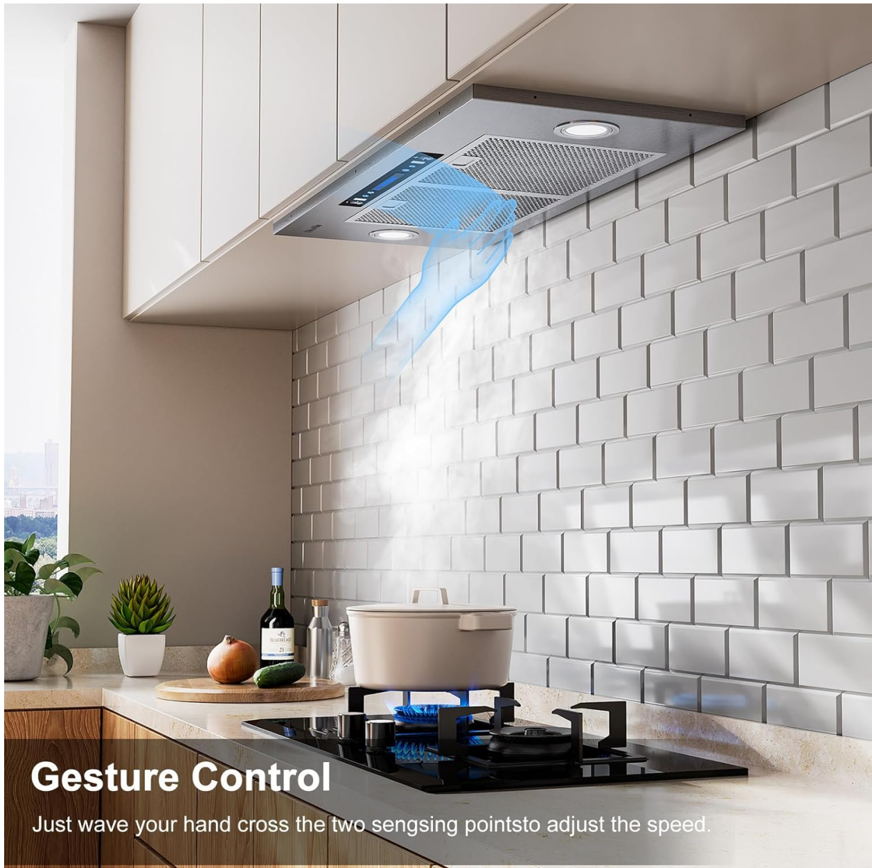
Figure 3.2: Wave your hand across the sensing points to adjust fan speed and light.

Experience hands-free operation with the precision gesture control system.