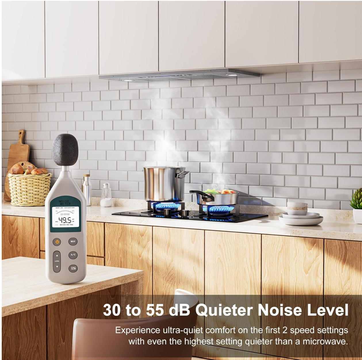
Figure 3.4: The range hood operates at an ultra-quiet 55 dB even at maximum power.