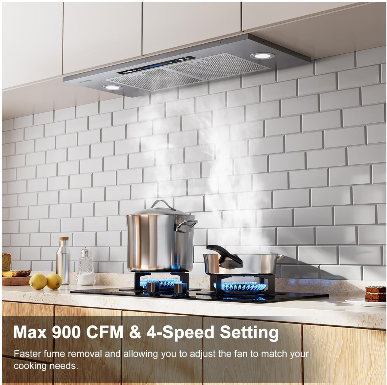
Figure 3.1: The range hood features 900 CFM airflow and 4-speed settings for efficient fume removal.