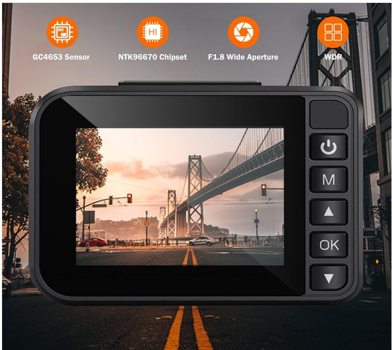
Image: The dash cam display showing enhanced night vision capabilities, capturing clear details in low light.

Enhances super night vision in low light conditions and prevents sharp images at night