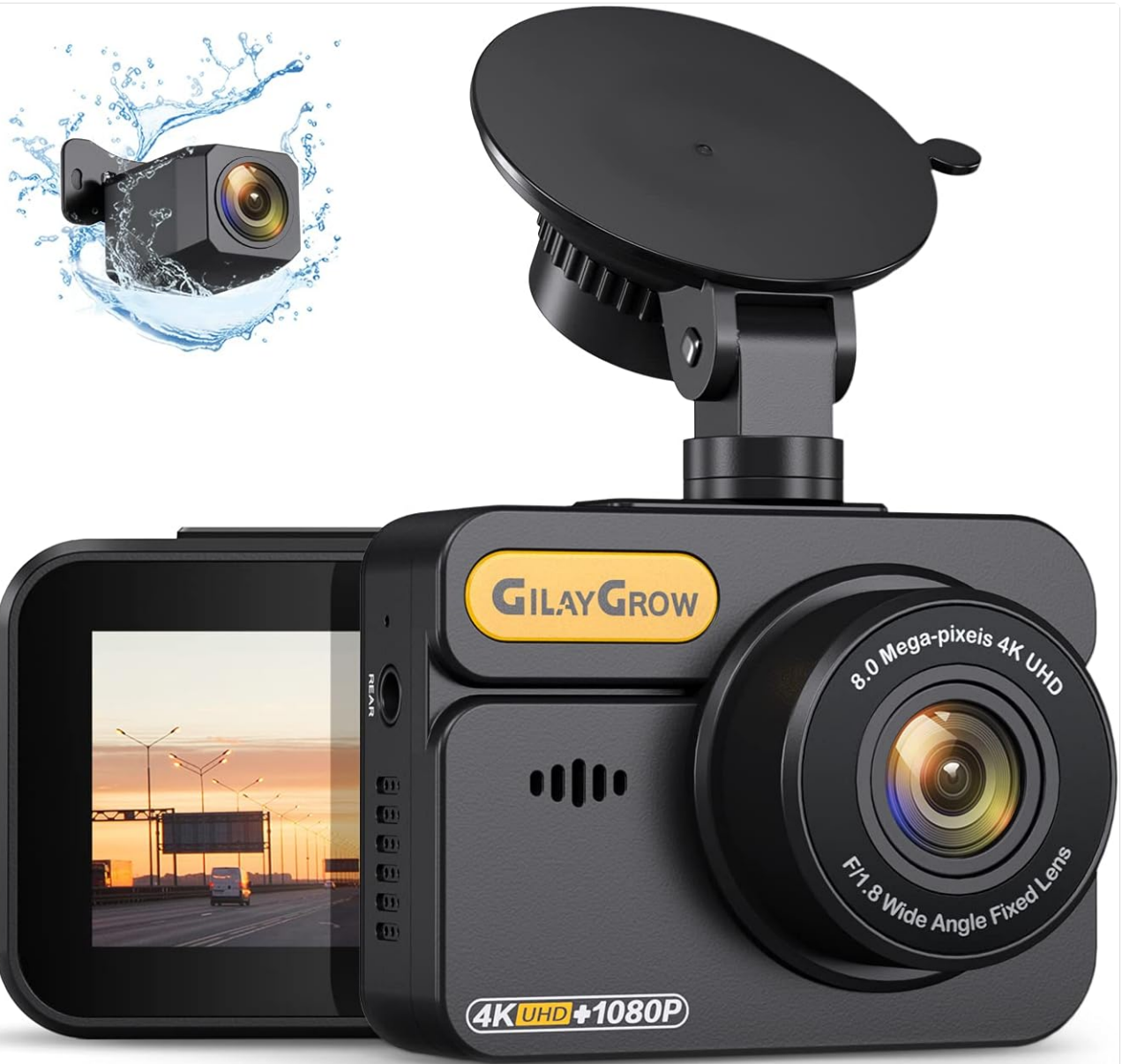
Image: The main GILAYGROW 4K Dual Dash Cam unit with its suction cup mount, alongside the smaller rear camera.