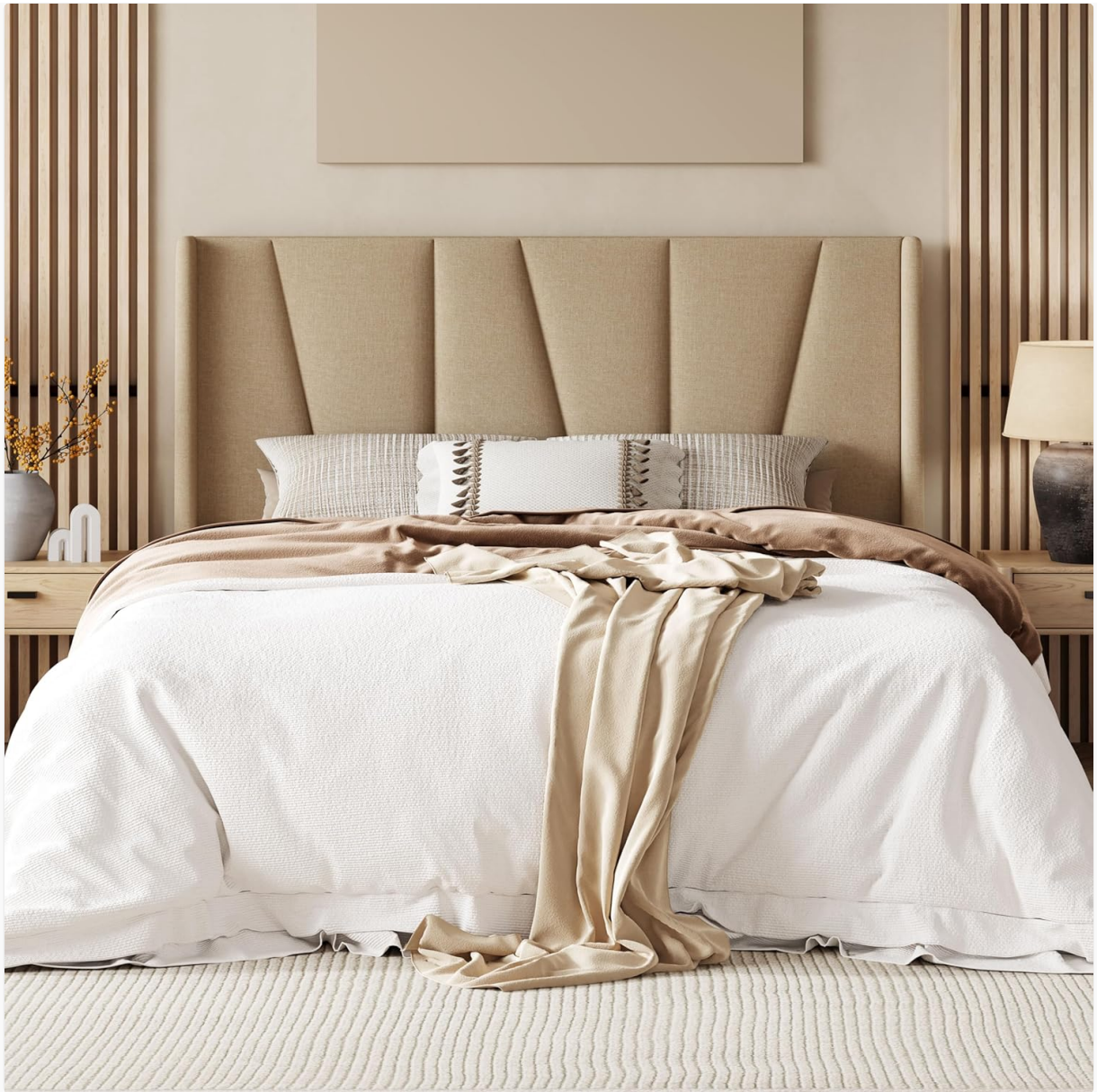
Image: The Allewie Queen Size Platform Bed Frame, showcasing its upholstered geometric wingback headboard and overall design.