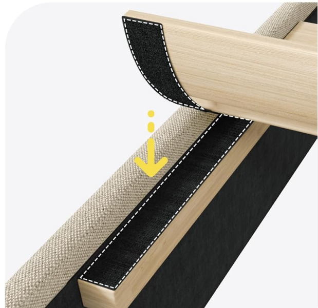
Image: Detail of the comfortable and breathable linen fabric.