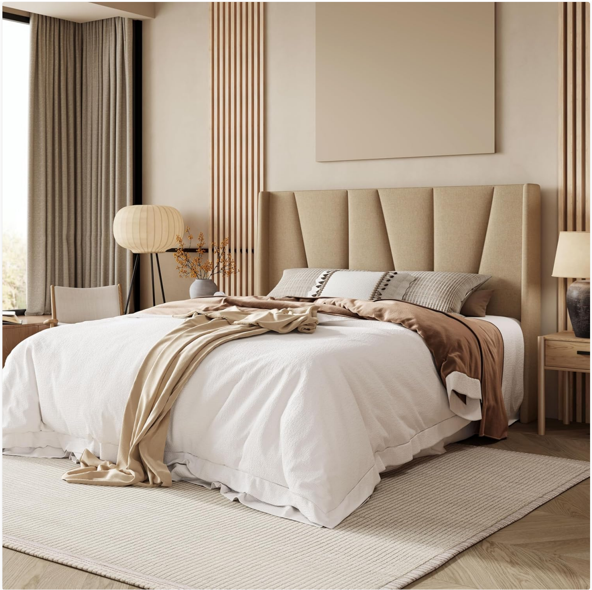
Image: Detailed view of the geometric upholstered headboard.