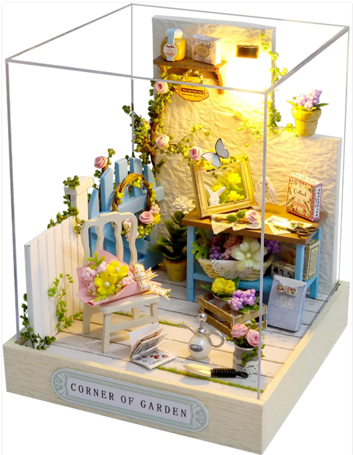
Image: The fully assembled CUTEROOM QT033 Miniature House Kit, showcasing the detailed garden scene with furniture and accessories, enclosed in a clear dust cover.