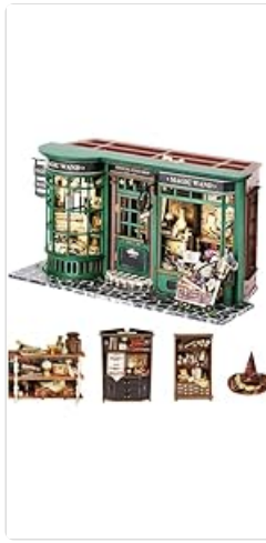
Image: The miniature house kit with its LED lights illuminated, showcasing the warm glow and enhanced details of the assembled scene.