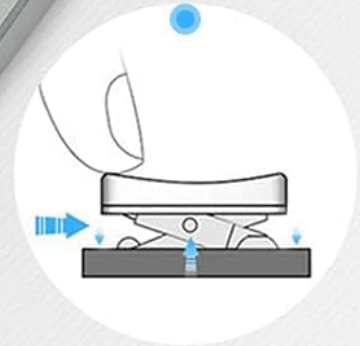
Interruptor de tijera

Gracias a su diseño de interruptor de tijera y perfil bajo, estas teclas garantizan una escritura silenciosa y cómoda