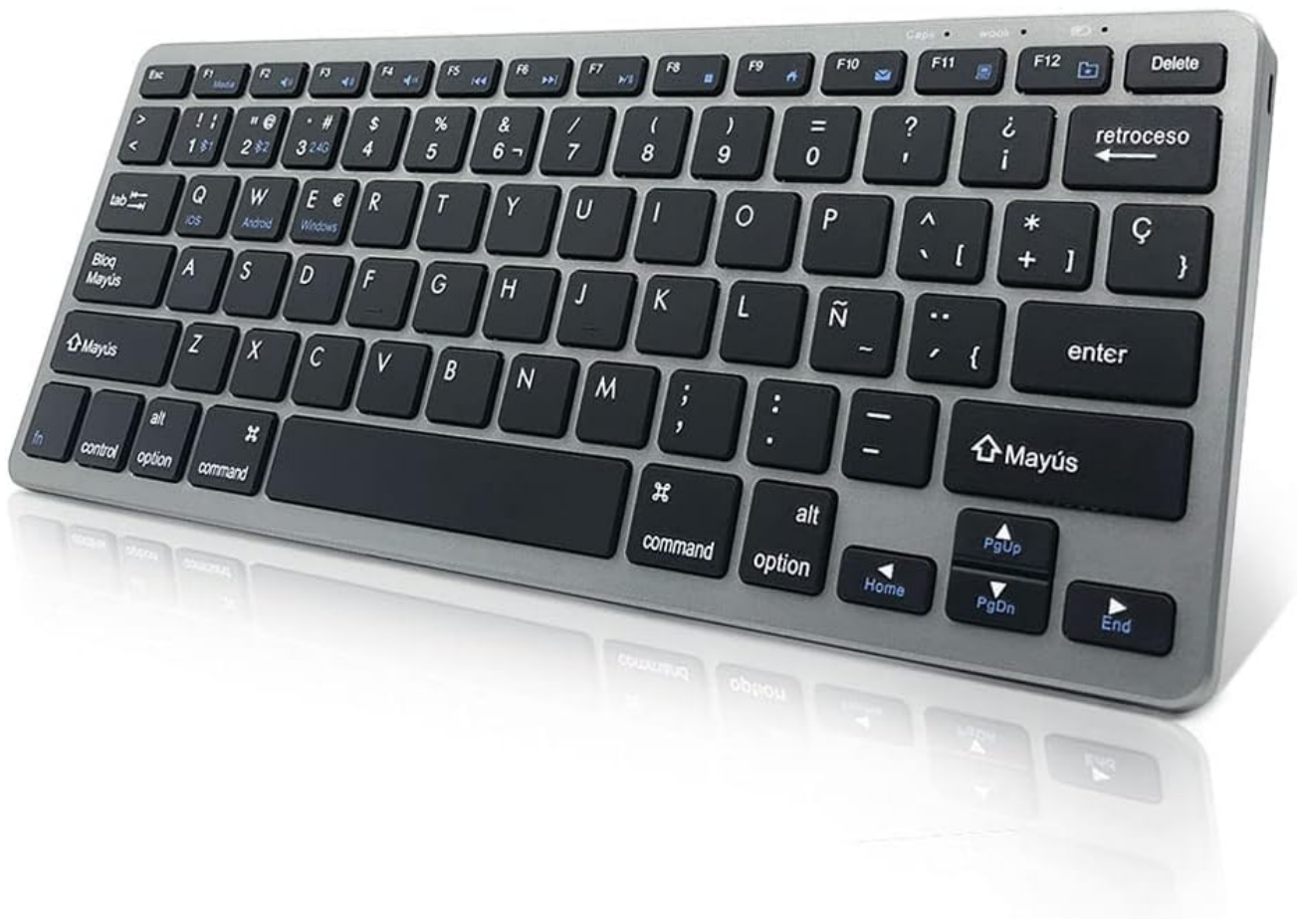
Figure 1: E T EASYTAO Wireless Keyboard (Black)