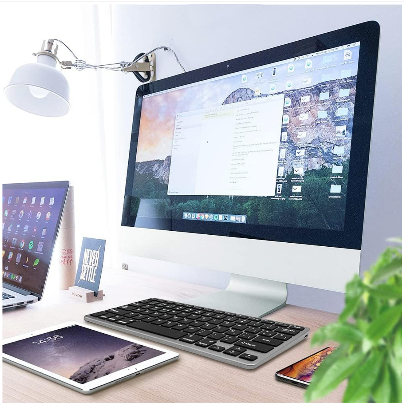
Figure 9: The E T EASYTAO keyboard in a typical office setup, demonstrating its compatibility and use with a desktop computer, laptop, and tablet.