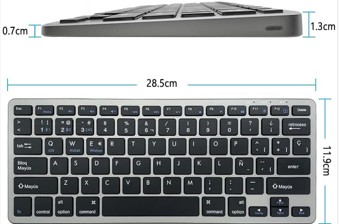
Figure 2: Ultra-slim design of the keyboard, showing dimensions of 28.5 cm length, 11.9 cm width, and thickness ranging from 0.7 cm to 1.3 cm.