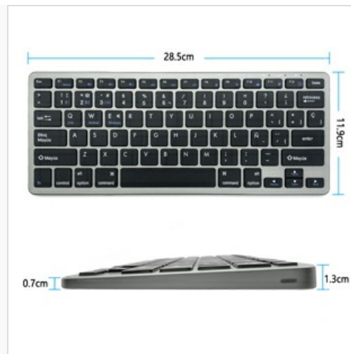
Figure 8: Overview of the keyboard's function keys (F1-F12) and their associated multimedia and system controls, accessible via the Fn key.