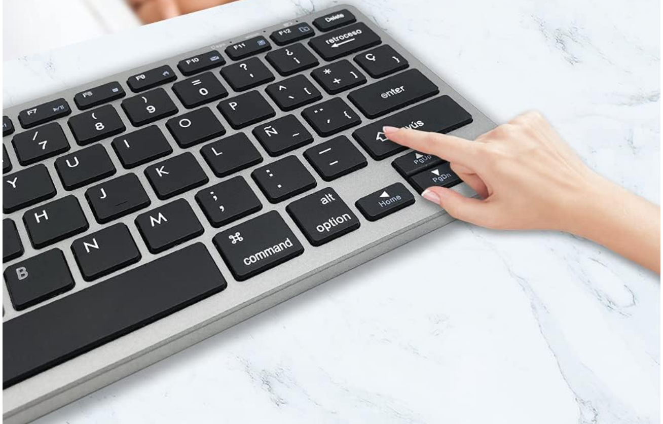
Figure 4: The keyboard's silent operation, featuring noise-reduction button design for a quiet typing experience that does not disturb others.