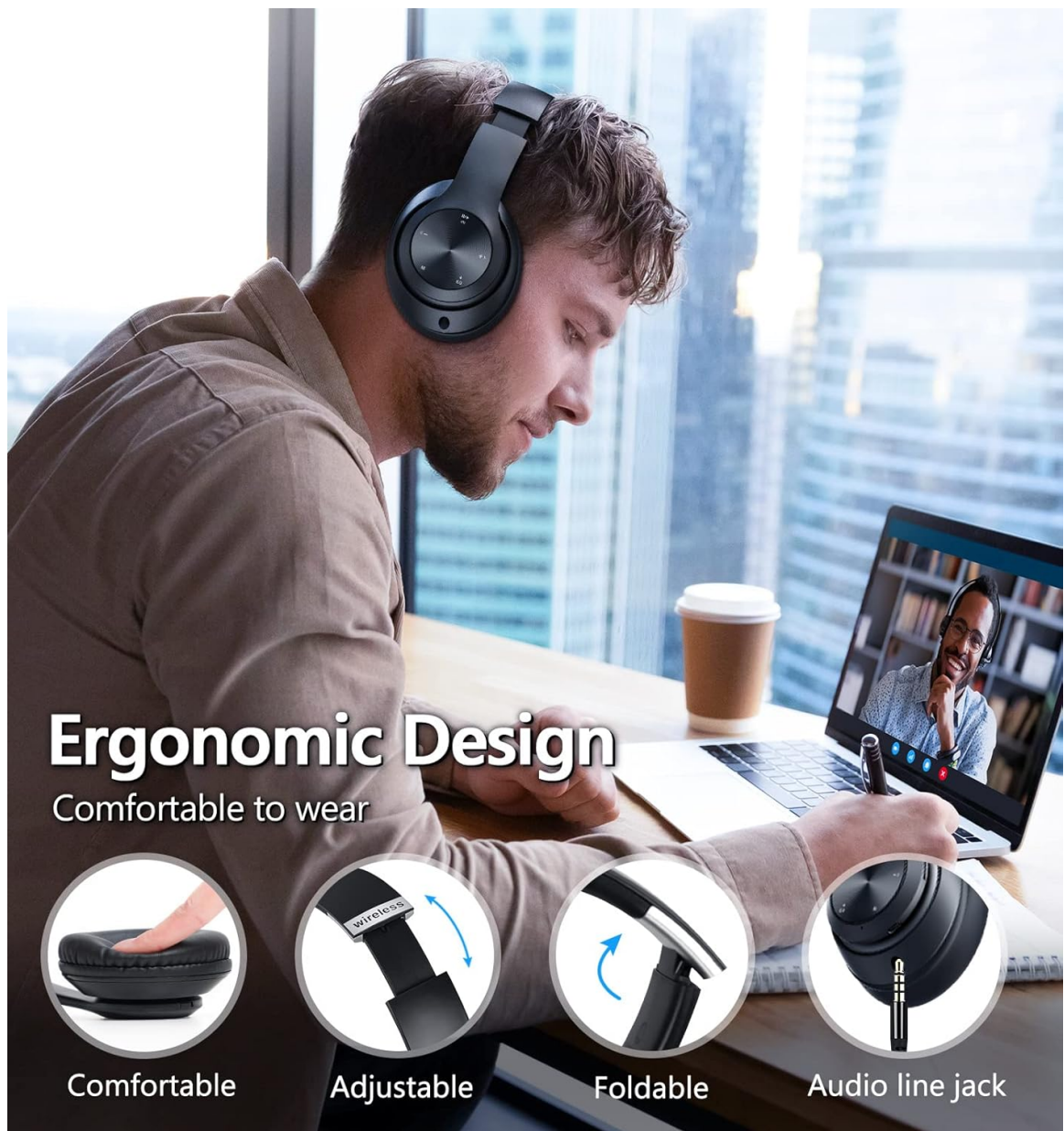
Image 5.1: Ergonomic and Foldable Design for Comfort and Portability