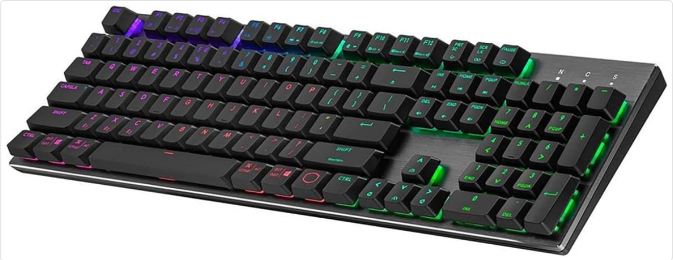
Figure 4: The SK653 keyboard showcasing its dynamic RGB lighting capabilities.

The 'Lighting' tab provides comprehensive control over the keyboard's RGB illumination. You can select from a wide spectrum of colors, adjust brightness values, and choose from various lighting modes and effects. Some effects allow for speed and direction adjustments.