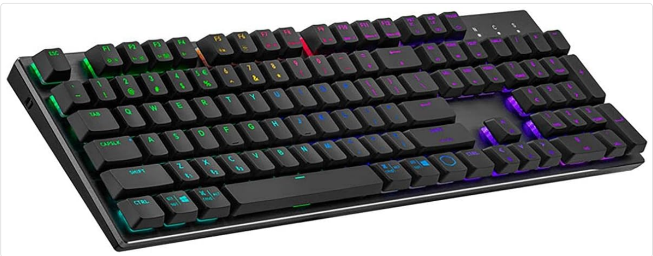
Figure 1: Cooler Master SK653 Wireless Mechanical Keyboard with customizable RGB lighting.

The Cooler Master SK653 hybrid wireless mechanical keyboard is designed for versatile use, offering both wired and wireless connectivity. Its full-size layout and brushed aluminum body provide a sleek, professional aesthetic suitable for any setup. Featuring low-profile mechanical switches and ergonomic keycaps, it delivers a satisfying typing experience. The keyboard supports wired USB-C and Bluetooth 4.0, allowing connection to up to three devices.