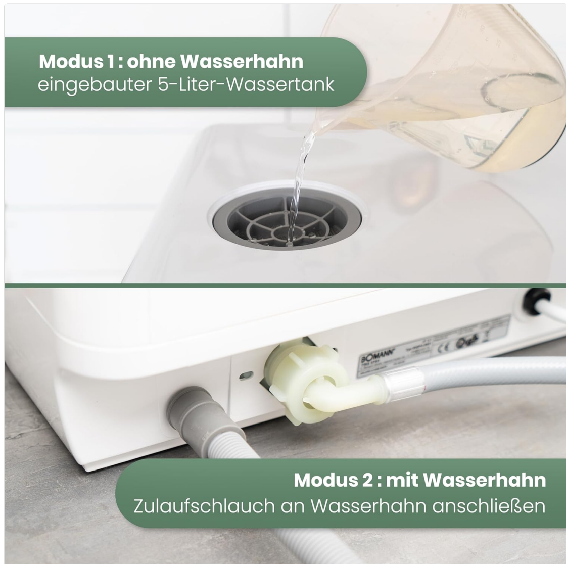
Figure 4.1: Manual water filling into the 5-liter tank (top) and optional faucet connection (bottom).

This mode is ideal for portability and locations without a direct water supply. Simply open the water inlet cap on top of the dishwasher and pour in approximately 5 liters of fresh water. The dishwasher will signal when the tank is full.