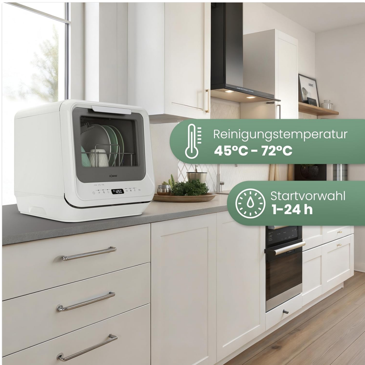
Figure 5.2: Dishwasher in use, highlighting cleaning temperature range (45°C-72°C) and 1-24h start delay.