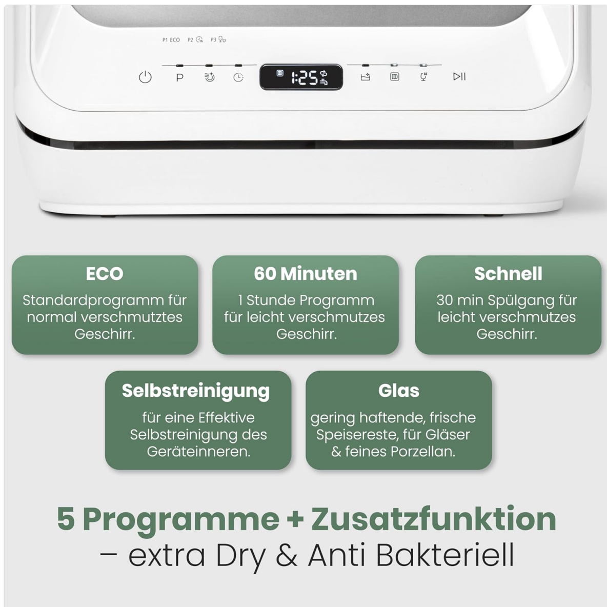
Figure 5.1: Overview of available wash programs.