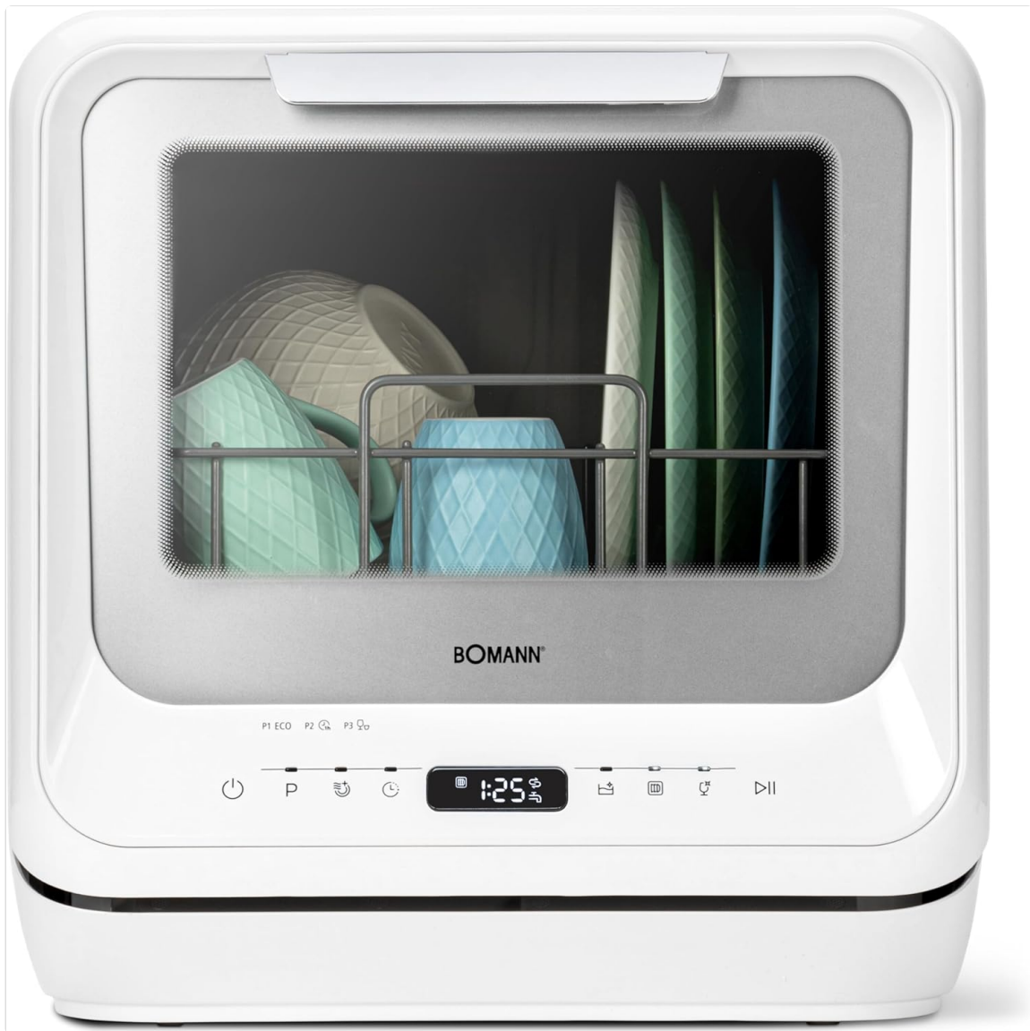
Figure 3.1: Front view of the dishwasher, showing the transparent door and control panel.

Familiarize yourself with the components of your Bomann TSG 5701 dishwasher.