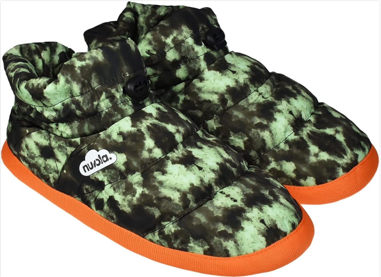
Figure 3.1: Front view of a pair of NUVOLA slippers, showcasing the design.