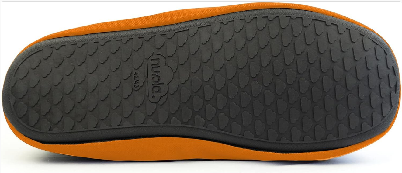
Figure 6.1: View of the durable, slip-resistant rubber sole.