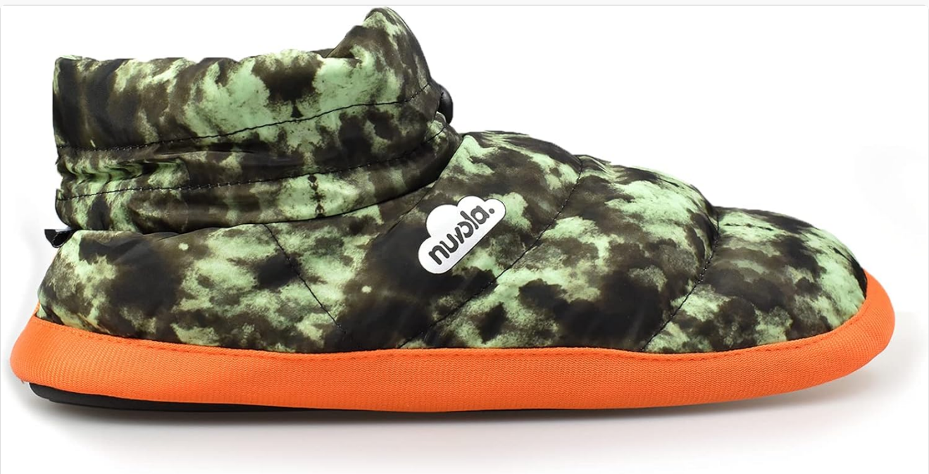
Figure 1.1: Side view of the NUVOLA Boot Home Printed Slipper in green camouflage.

NUVOLA Boot Home Printed slippers are designed for ultimate comfort and relaxation. These lightweight slippers feature a versatile design suitable for both indoor and outdoor use. They are crafted with a memory foam sole for exceptional softness and flexibility, providing a cloud-like walking experience. The high-quality rubber sole offers reliable slip resistance and stability on various surfaces. The interior lining ensures your feet remain comfortable, soft, and warm. Their simple yet effective design makes them an ideal choice for home wear, providing warmth and comfort for both men and women.