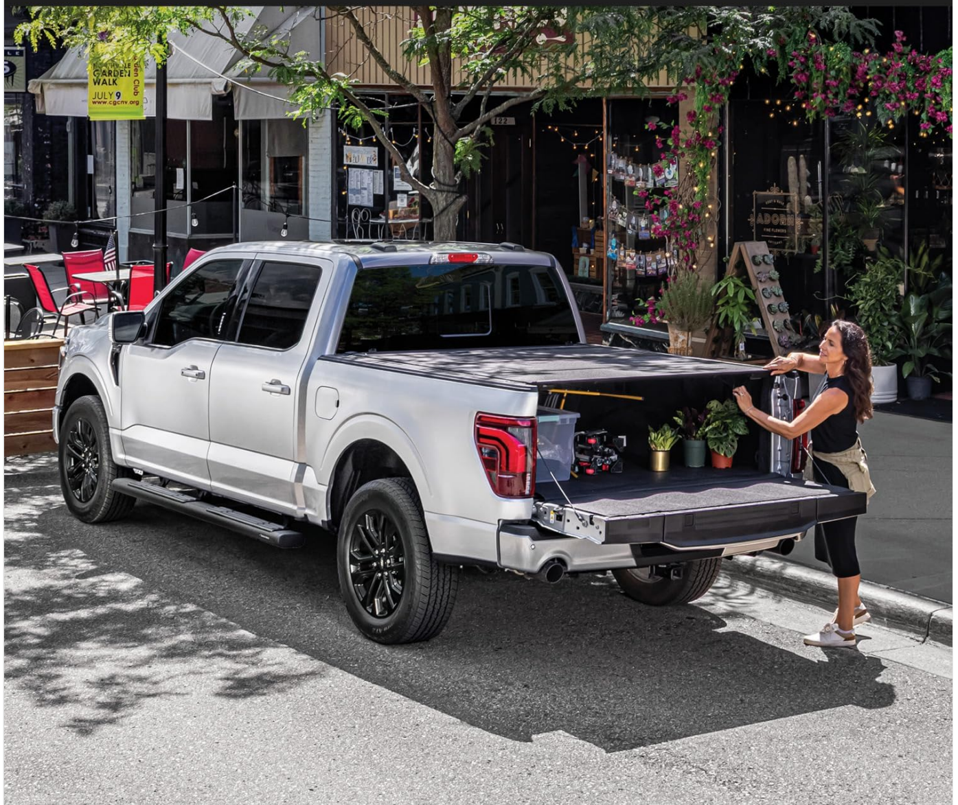
Image: A user demonstrating the process of opening the BAKFlip MX4 Tonneau Cover to access the truck bed.