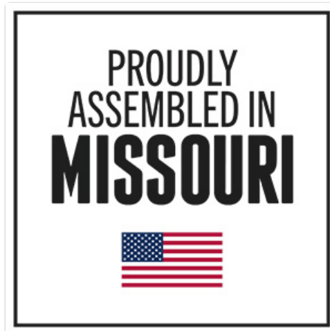
Image: Confirmation of manufacturing location.