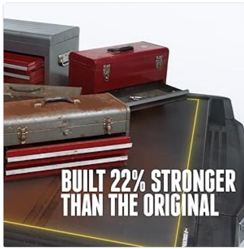
Image: Illustration of the cover's strength and durability, capable of supporting significant weight.