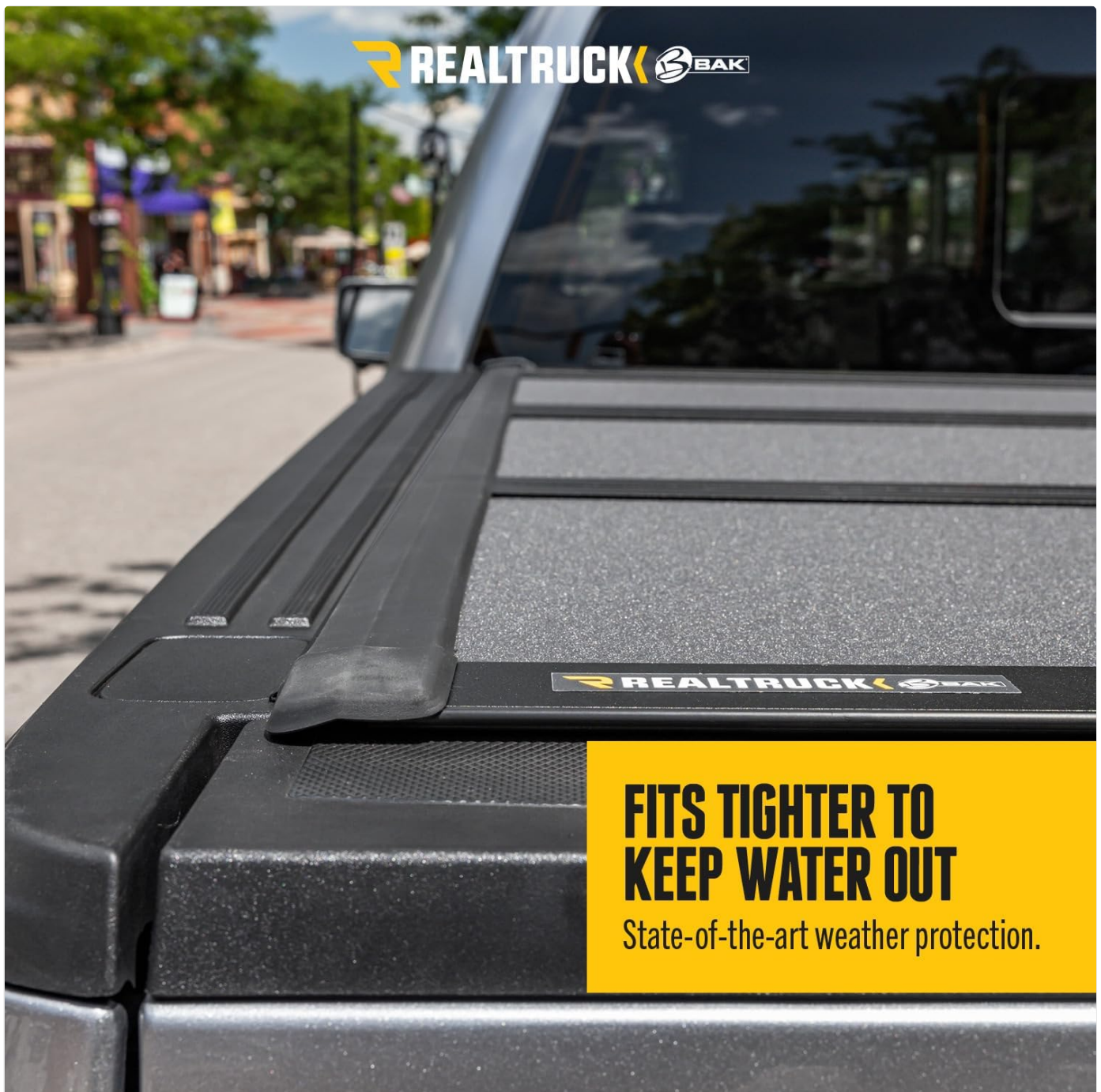
Image: Detail of the cover's sealing mechanism, emphasizing its design for water resistance.