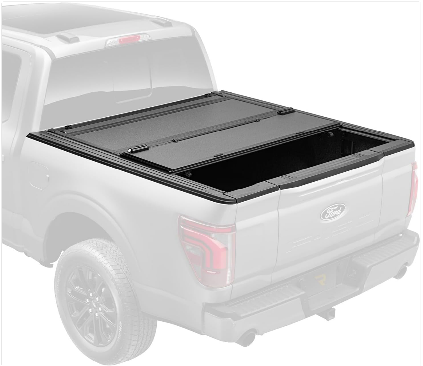
Image: The BAKFlip MX4 Tonneau Cover securely installed on a truck bed, demonstrating its sleek, closed profile.