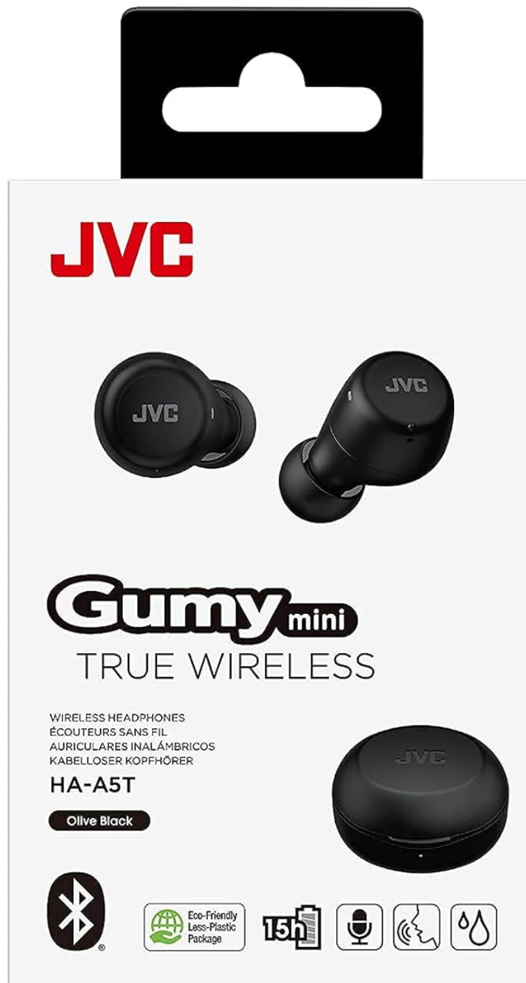
Image: The retail packaging for the JVC HA-A5T Gummy Mini True Wireless Earbuds, showing the earbuds and charging case.