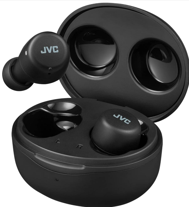
Image: The JVC HA-A5T earbuds placed inside their open charging case, ready for charging.