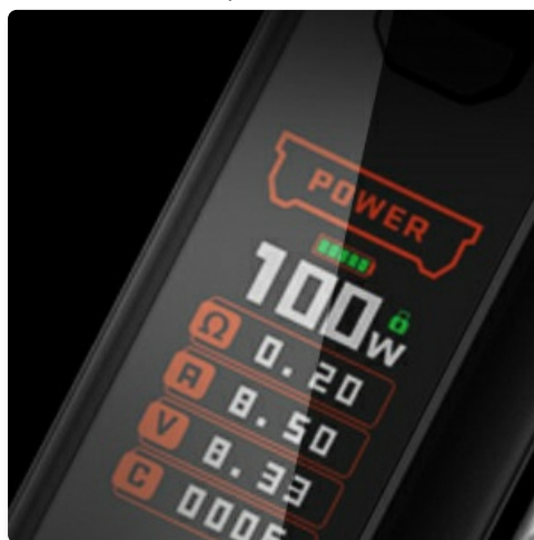
Image: A detailed view of the 1.08-inch full screen display showing power, resistance, amperage, voltage, and puff counter.