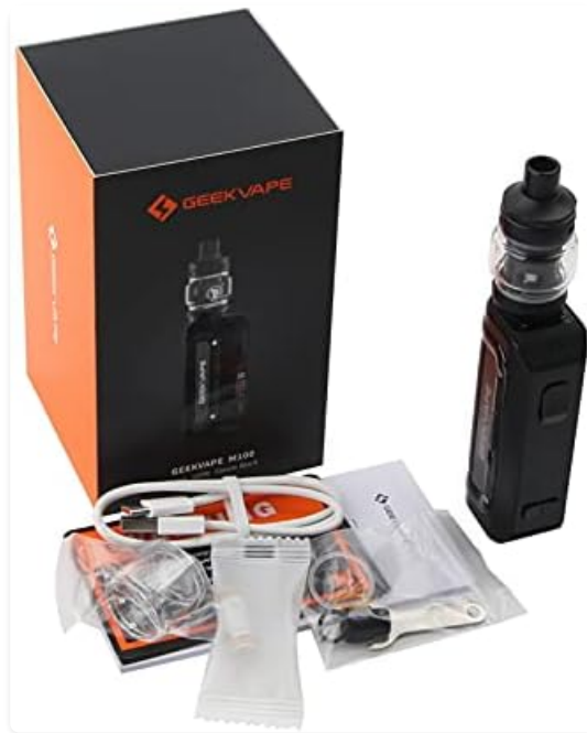
Image: The GeekVape M100 Aegis Mini 2 Kit, its packaging, and all included accessories laid out.