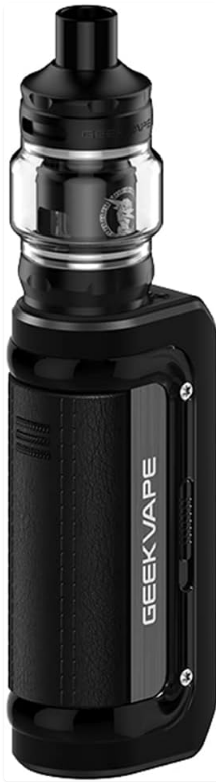
Image: Front view of the assembled GeekVape M100 Aegis Mini 2 Kit in classic black.