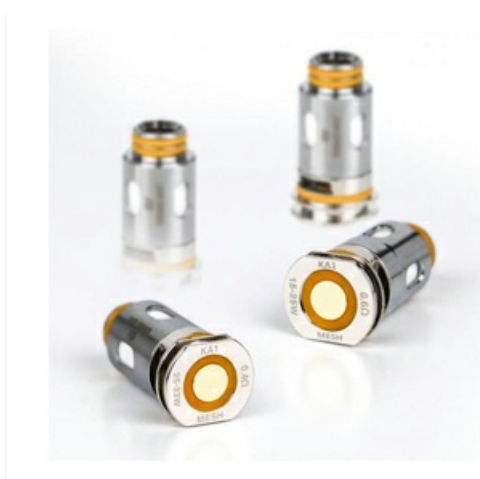
Image: Several GeekVape B Series Coils, highlighting their mesh design and resistance markings.