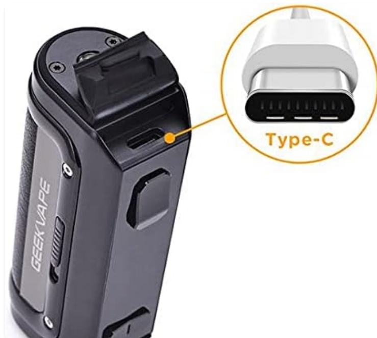
Image: Close-up of the GeekVape M100 Mod showing the Type-C charging port with its protective cover open.