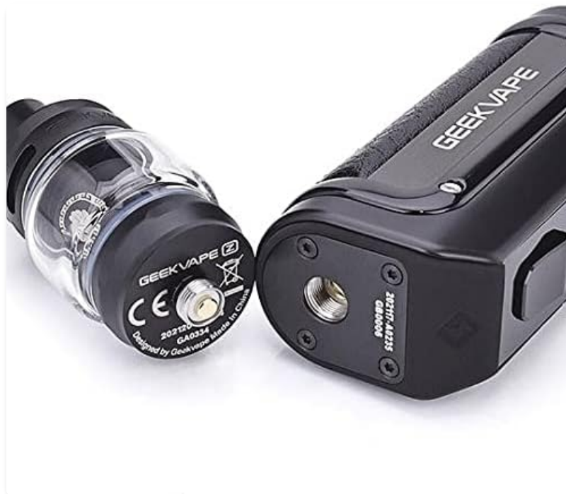
Image: Close-up view of the 510 connection point on the mod and the base of the Z Nano 2 Tank.