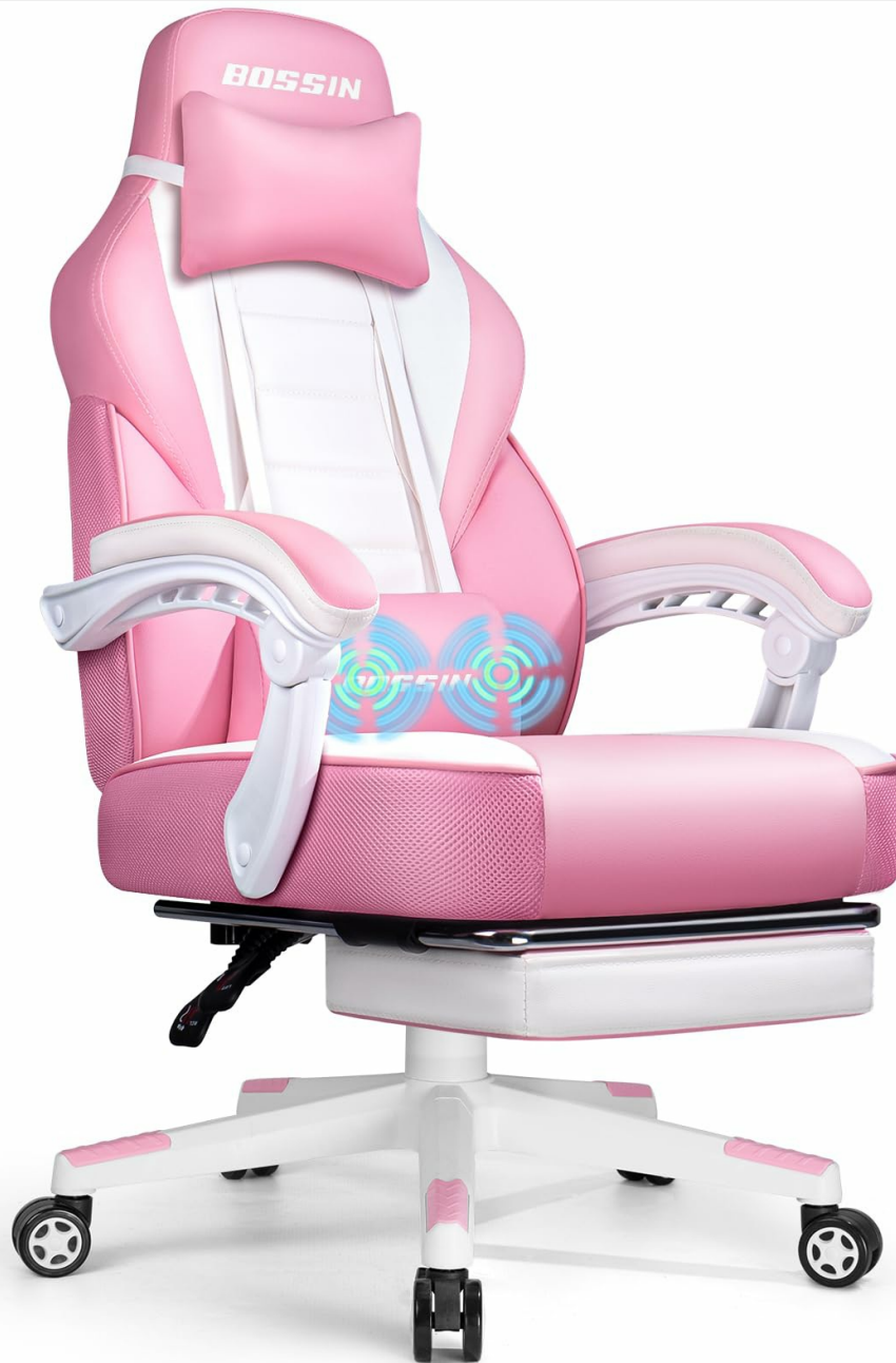
Figure 1: BOSSIN Big and Tall Gaming Chair (Pink variant shown).