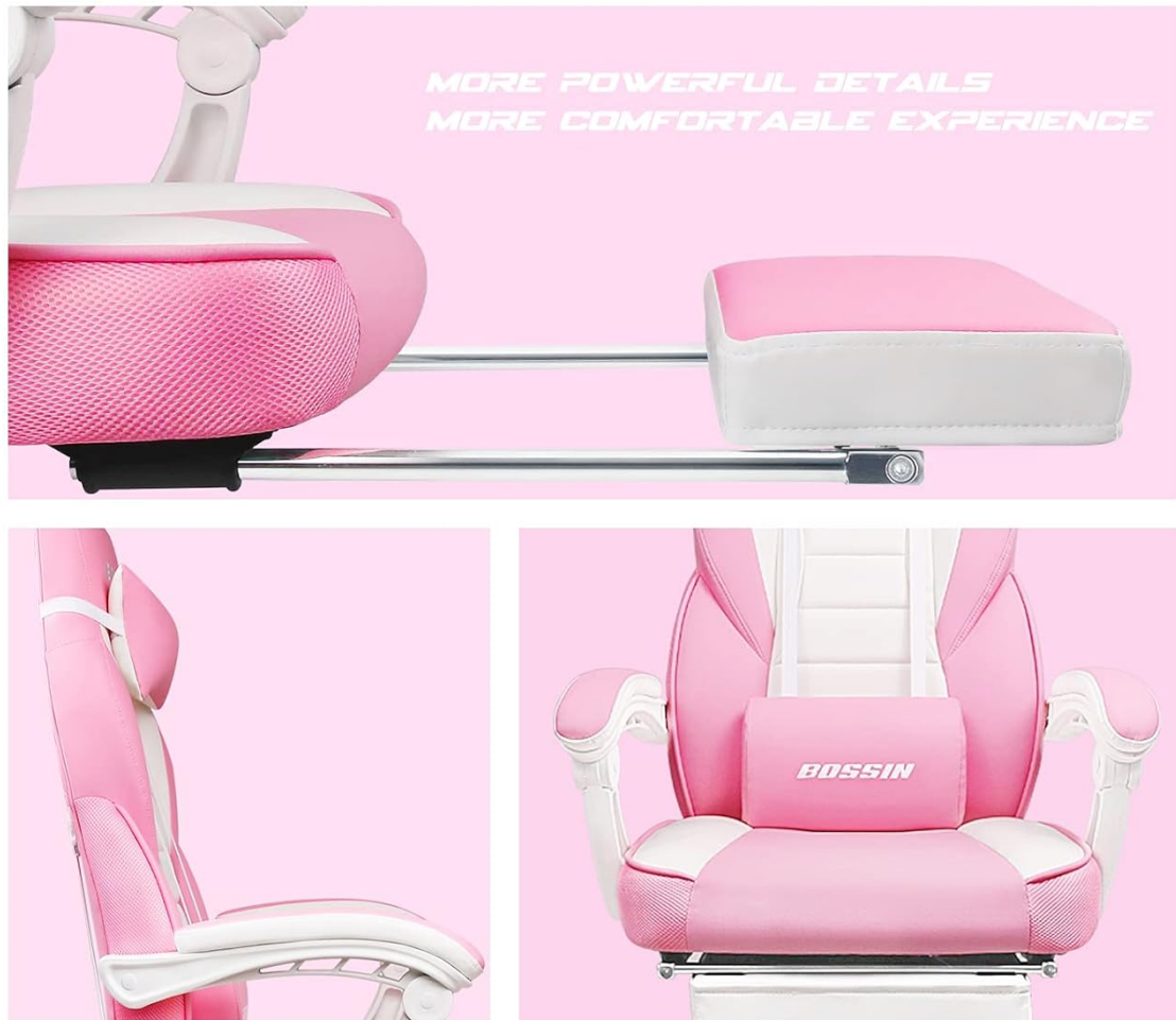
Figure 4: Detailed view of the retractable footrest and adjustable lumbar support pillow.