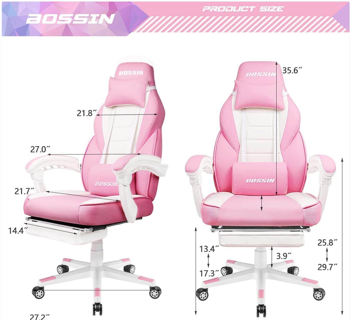
Figure 6: Detailed dimensions of the BOSSIN Gaming Chair.