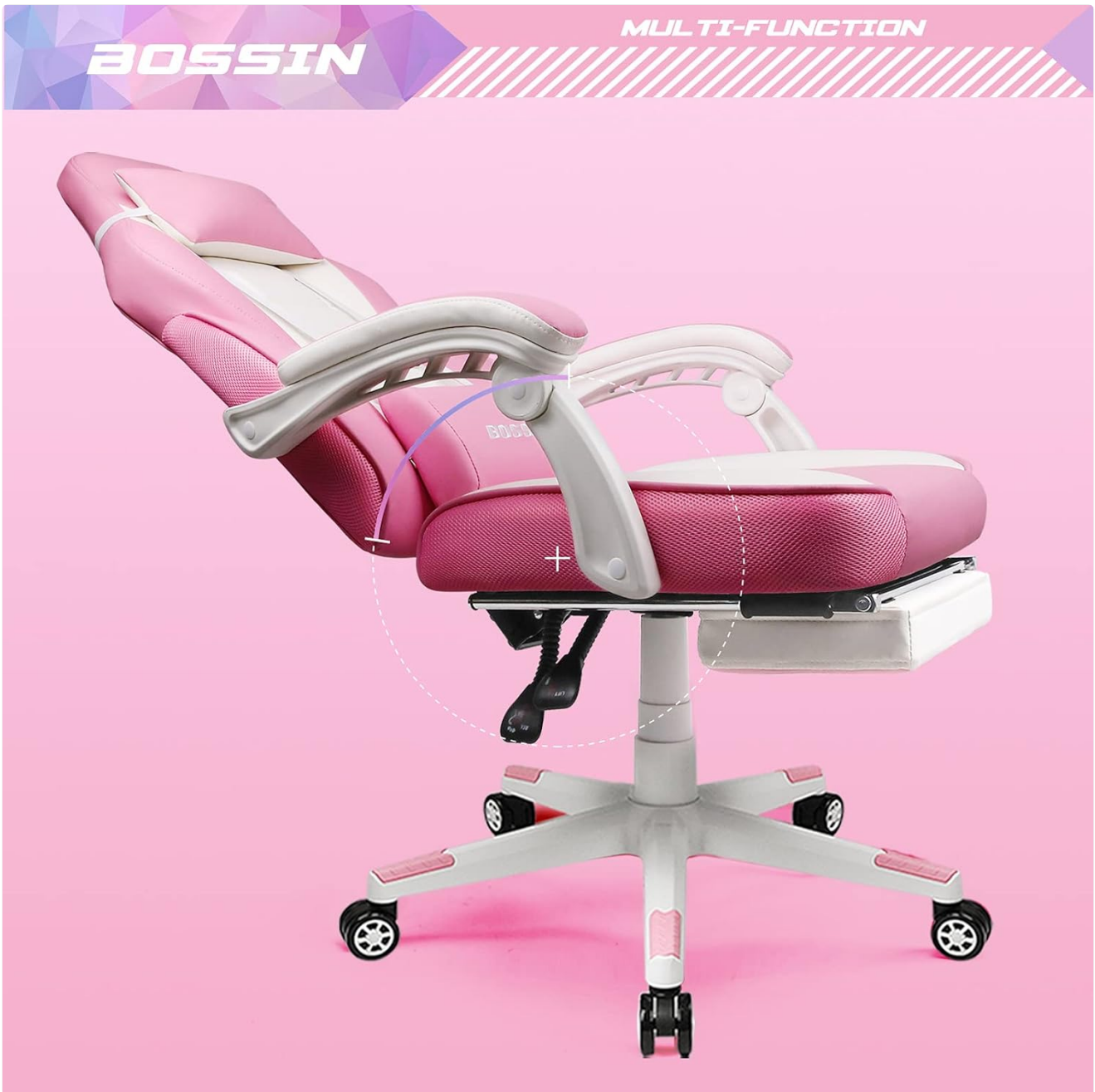
Figure 5: The chair's multi-functional adjustments, including recline and footrest extension, for various comfort positions.