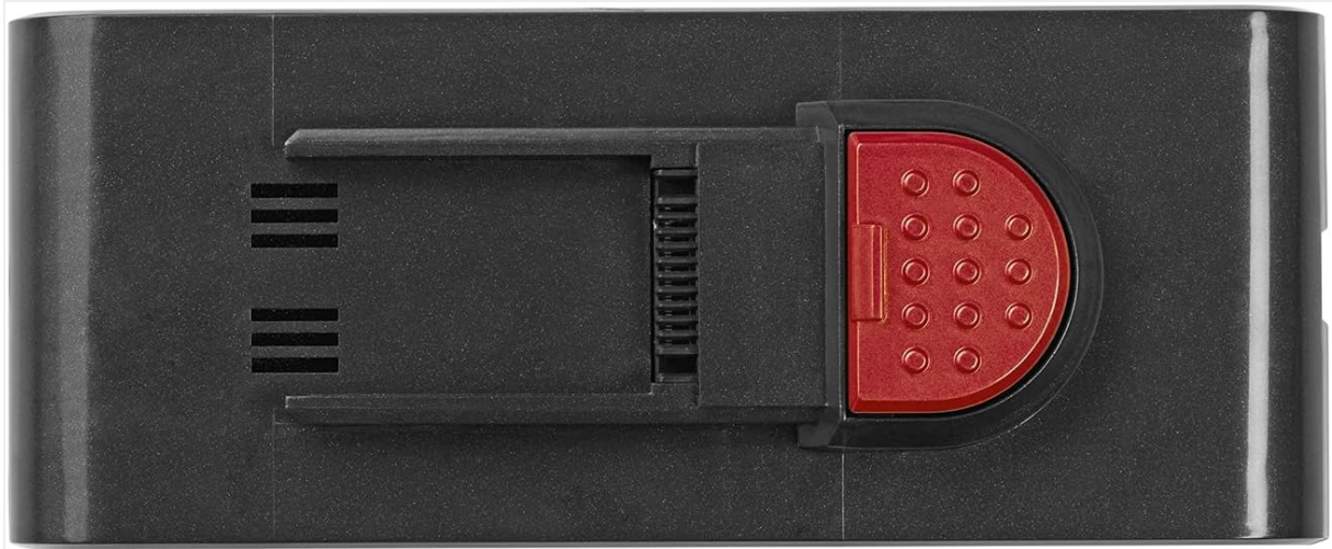
Image 1: Top view of the MAXXMEE replacement battery. This image highlights the battery's overall shape and the red release mechanism.