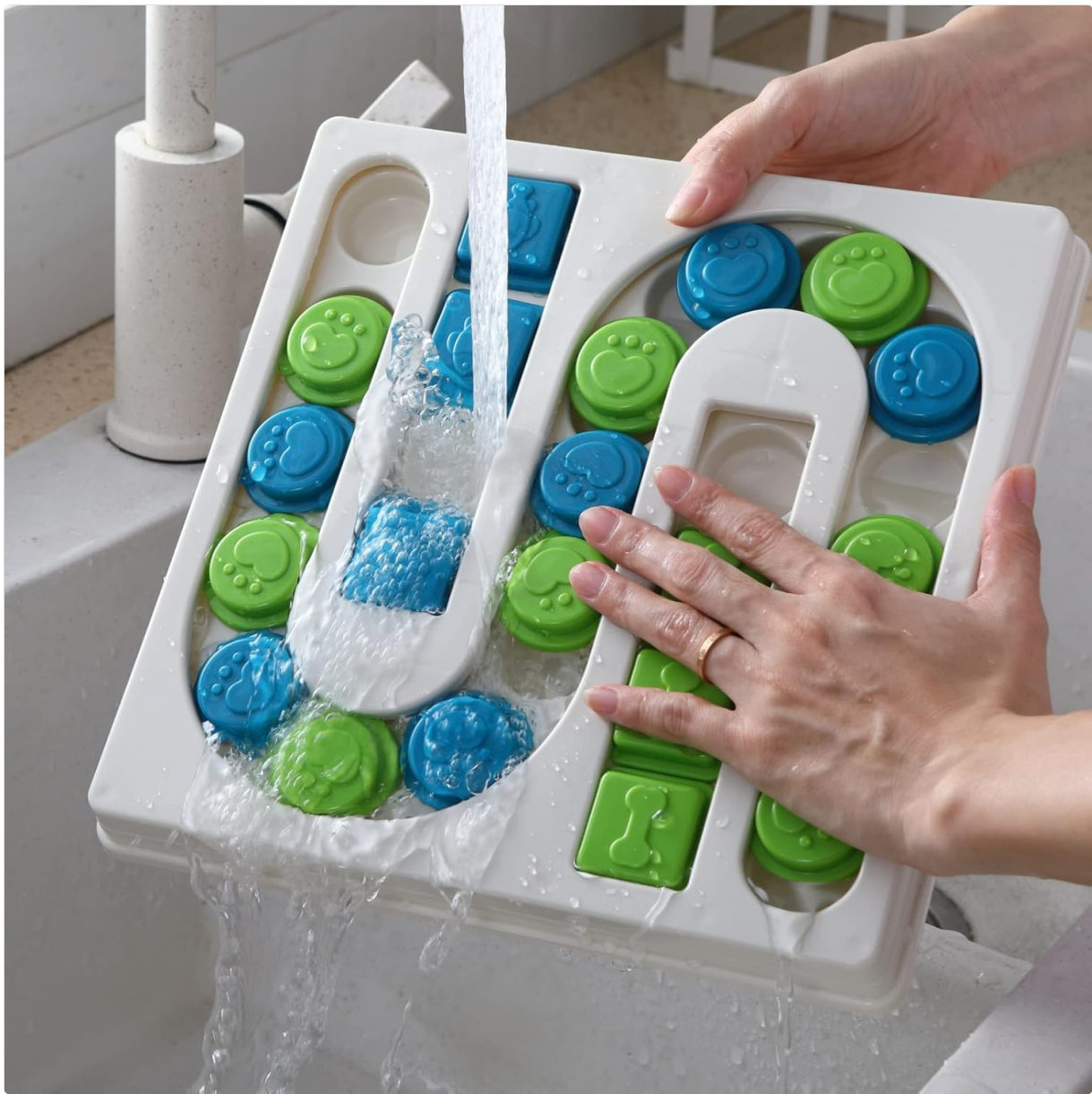
Image: Hands demonstrating the hand washing process for the puzzle toy under a faucet.