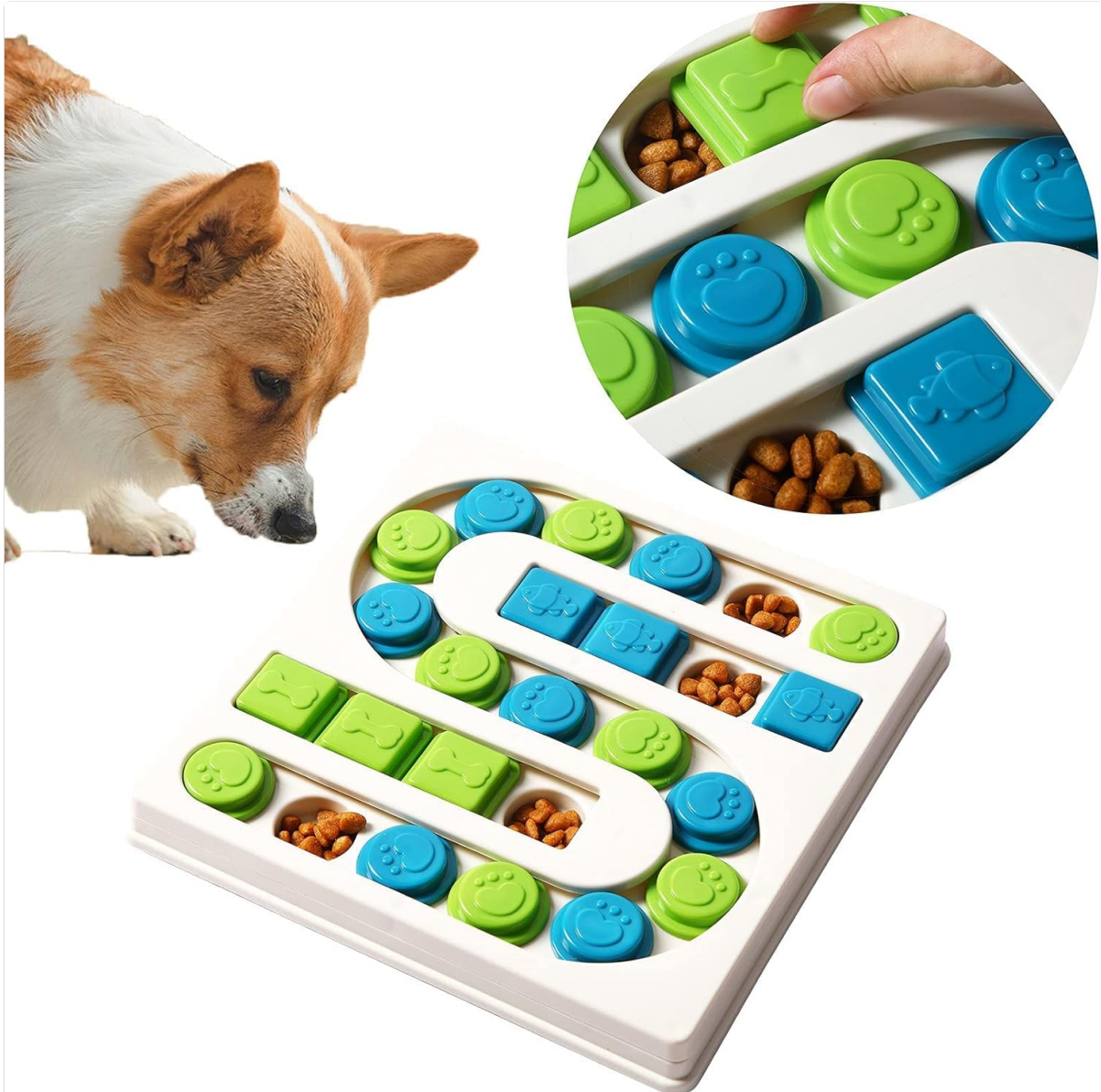
Image: A dog engaging with the puzzle toy, sniffing for hidden treats.

Video: A short clip demonstrating how cats can interact with and enjoy the Smart Paws puzzle toy.