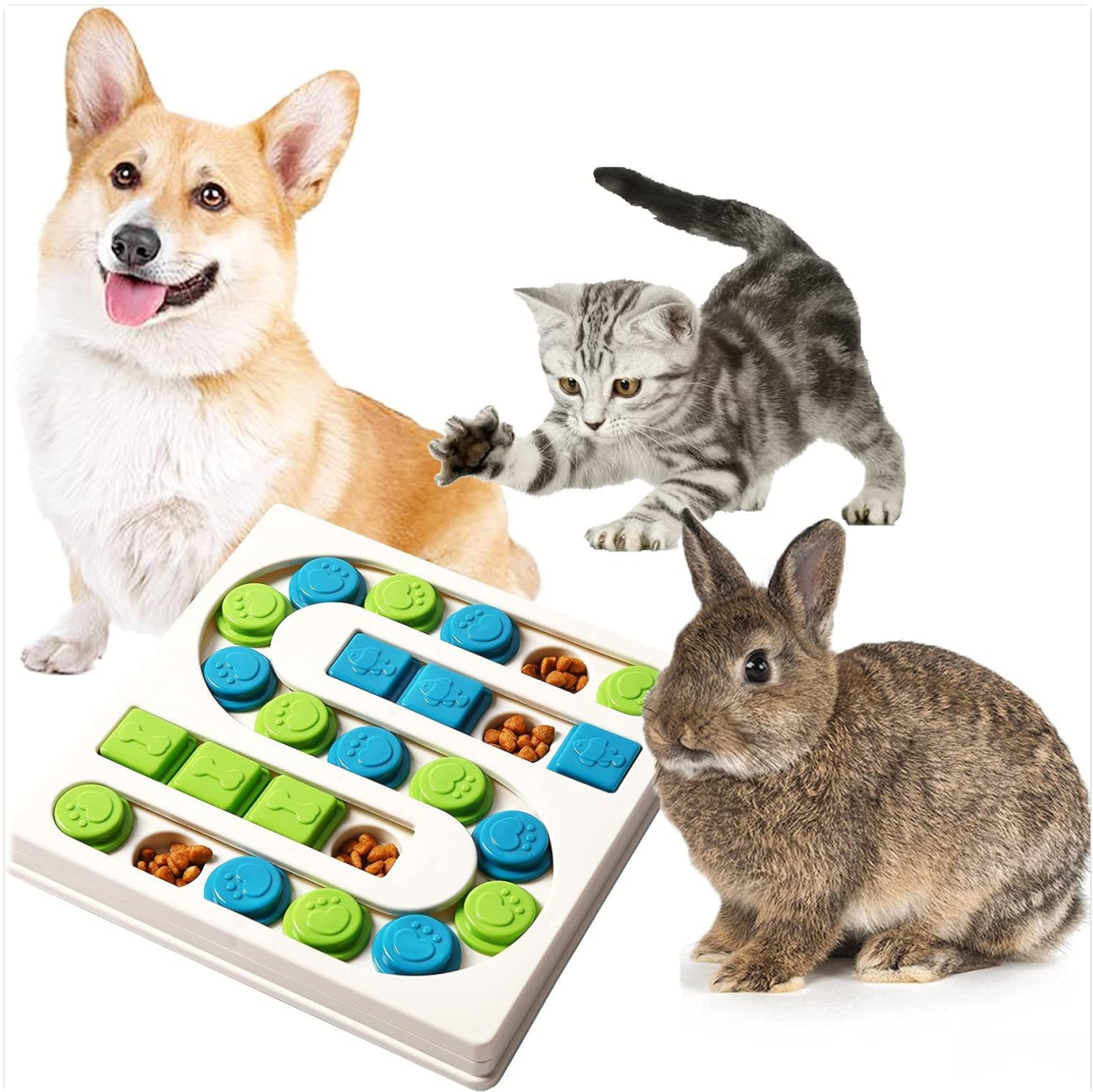
Image: The puzzle toy shown alongside a dog, cat, and rabbit, illustrating its suitability for multiple pet types.