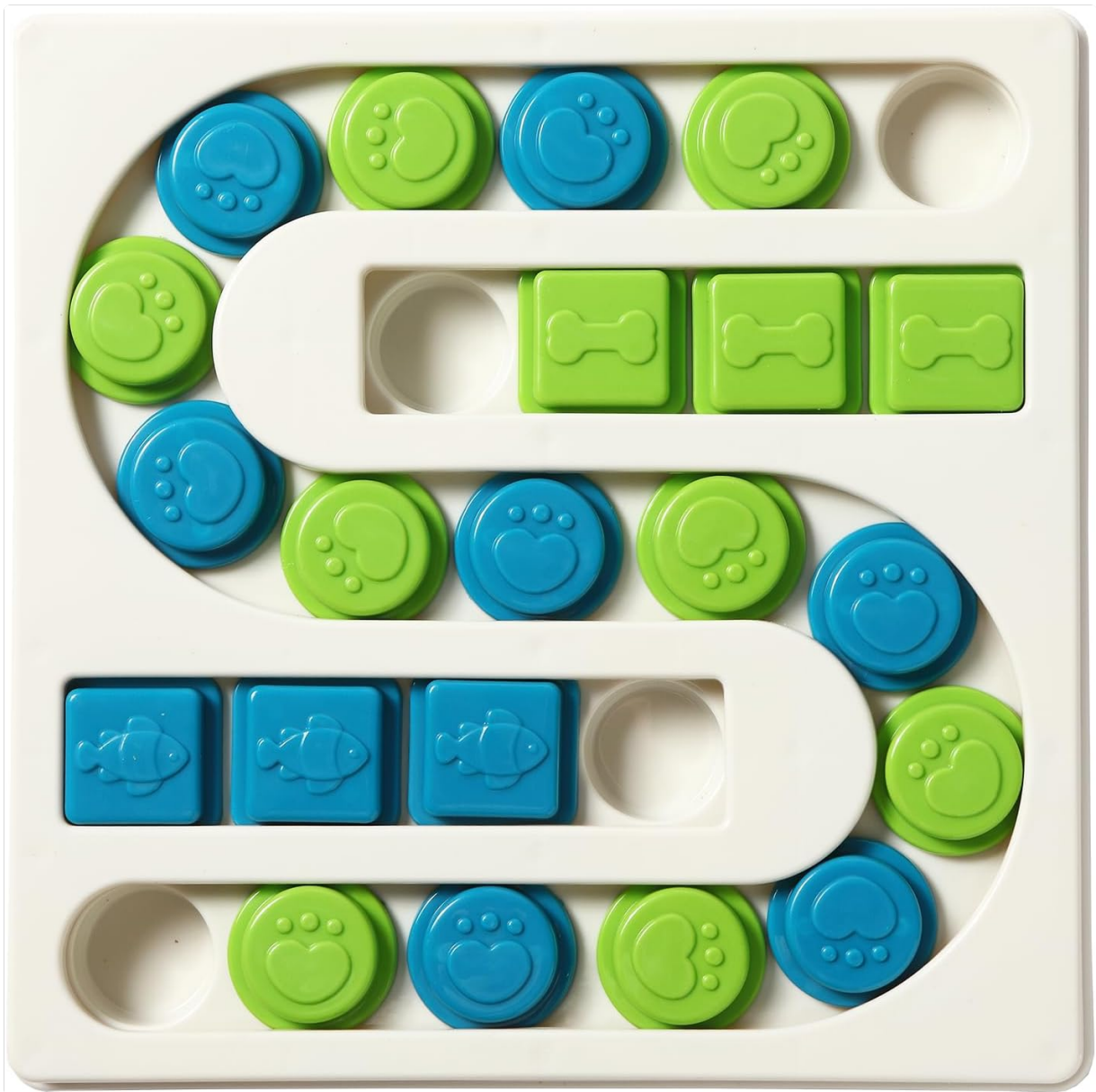
Image: The Smart Paws 25 Holes Interactive Pet Puzzle Toy, featuring a white base with blue and green sliding covers.

Key features include 25 individual compartments for treats, covered by sliding pieces that pets must manipulate. This interactive design helps reduce boredom, prevent destructive behaviors, and promote healthier eating habits by slowing down mealtime.