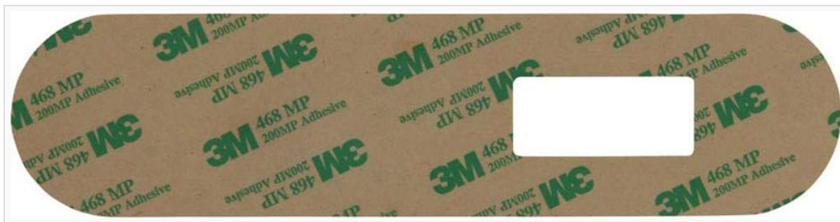
Figure 2: Back view of the Balboa 12511 TP400 Temp P1 Lt Aux Overlay. This image displays the 3M adhesive backing, which is peeled off during installation to secure the overlay to the control panel.