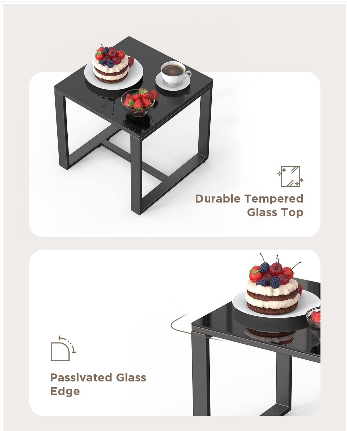
Figure 6.2: Tempered glass tabletop for easy maintenance.