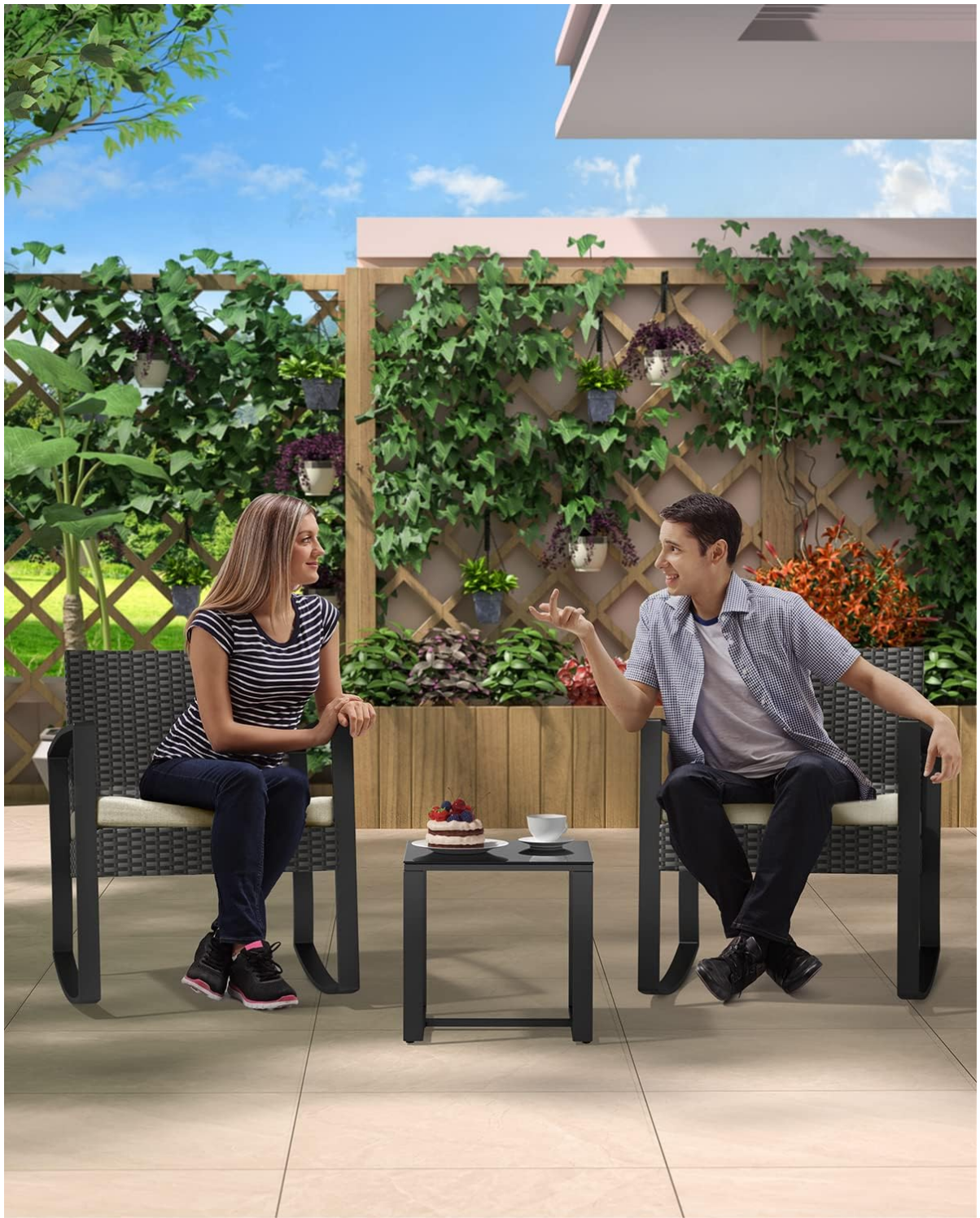
Figure 5.2: The bistro set in use on a patio.