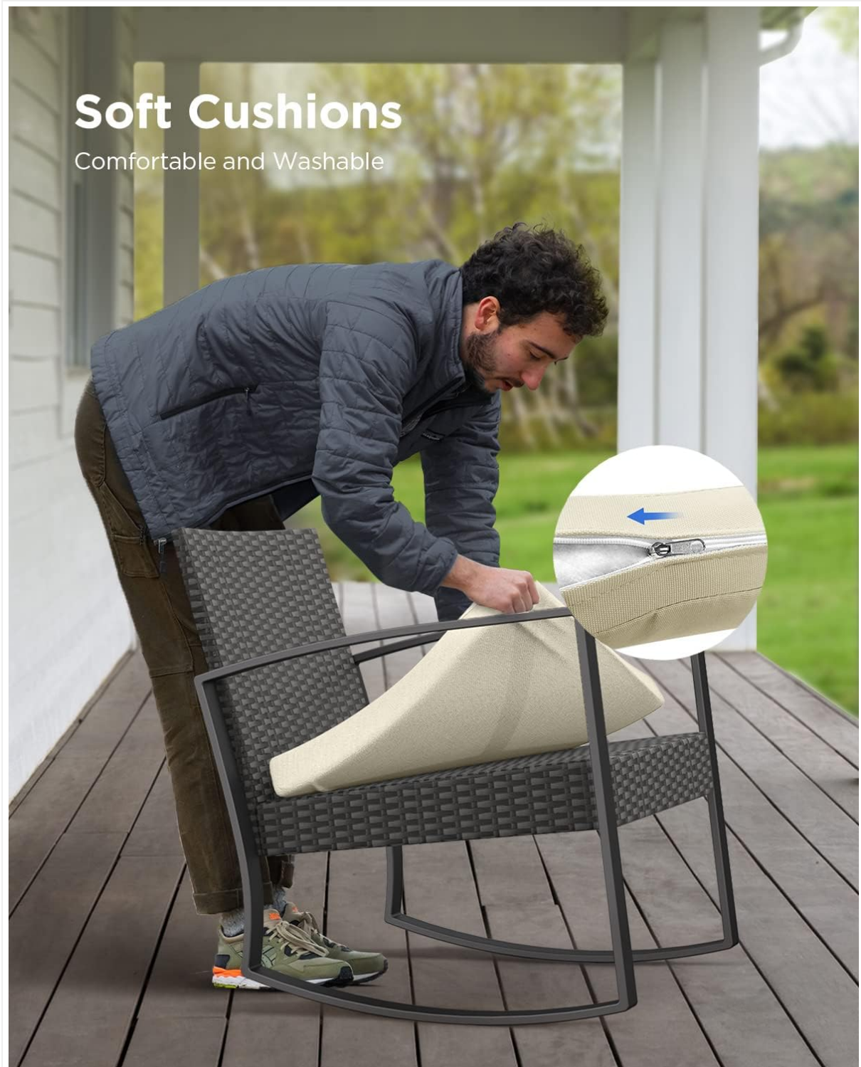
Figure 6.1: Cushion with hidden zipper for easy cleaning.