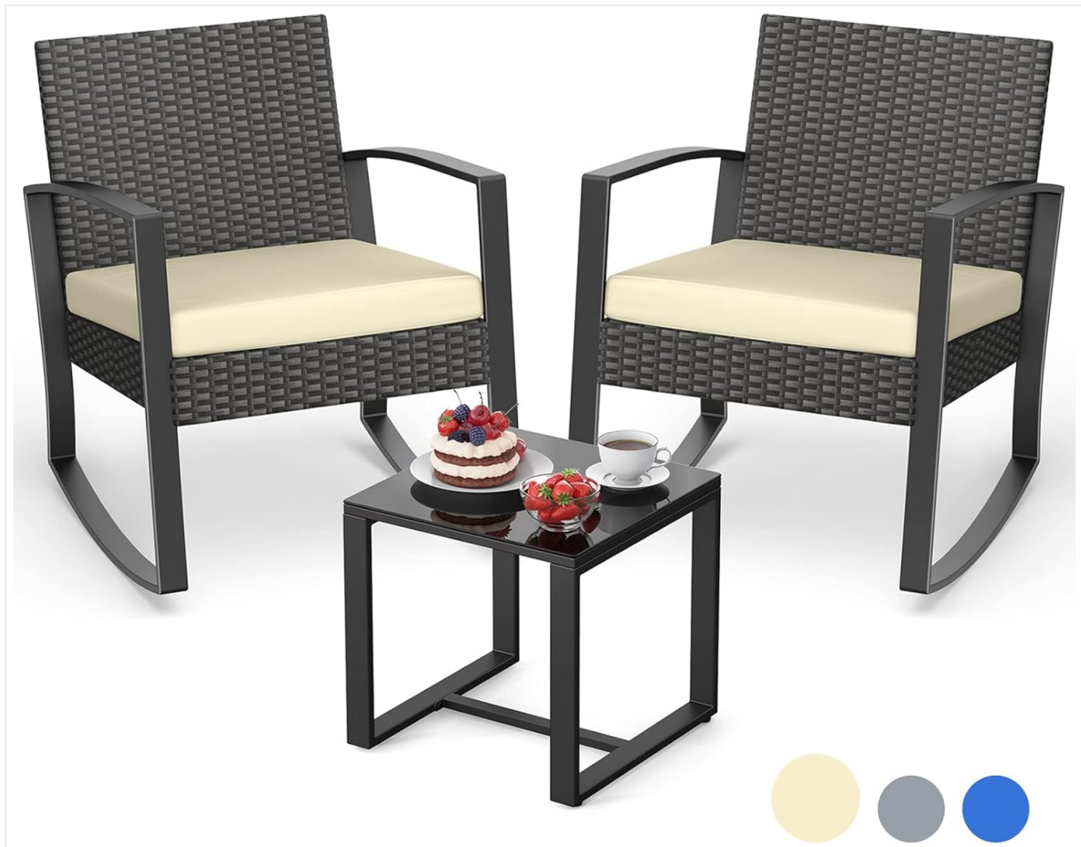
Figure 4.1: Fully assembled Aiho Outdoor Wicker Bistro Rocking Chair Set.