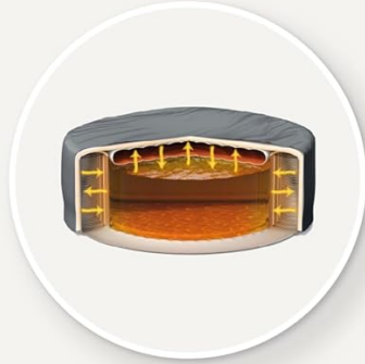
Energy Efficient Cover