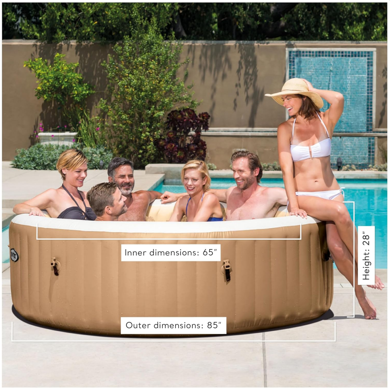
The Intex PureSpa shown with its approximate dimensions: 85 inches outer diameter, 65 inches inner diameter, and 28 inches height.