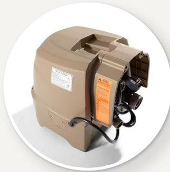
Spa Control Base

A visual representation of the main components included with the PureSpa: the energy-efficient cover, the digital control panel, and the spa control base unit.