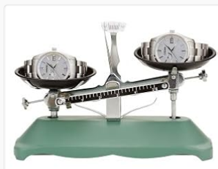
Image: A scale balancing two watches, visually representing the lighter weight of Super Titanium compared to other materials.

Citizen's Super Titanium™ is a proprietary material that is five times harder and 40% lighter than stainless steel. This makes the watch more resistant to scratches, comfortable to wear, gentle on the skin (hypoallergenic), and rust-resistant.