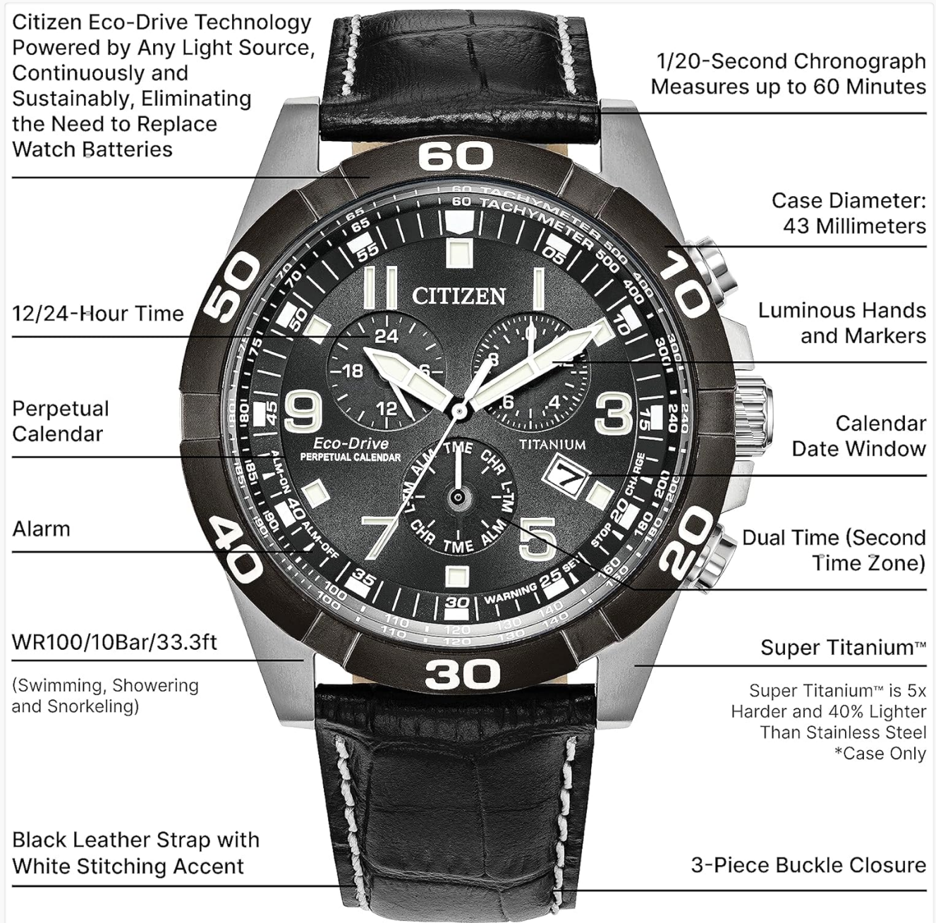
Image: Detailed annotated diagram of the watch face, indicating the crown, pushers, chronograph subdials, perpetual calendar, 12/24 hour time, alarm, date window, and luminous markers.

Refer to the annotated diagram below for component identification.