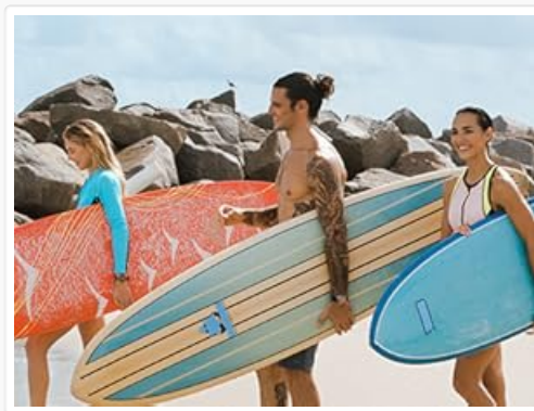
Image: Individuals on a beach with surfboards, demonstrating the watch's suitability for water-related activities like swimming and snorkeling.

This watch is rated for 100 meters (WR100/10Bar/33.3ft) water resistance, making it suitable for swimming, showering, and snorkeling. It is not intended for scuba diving.