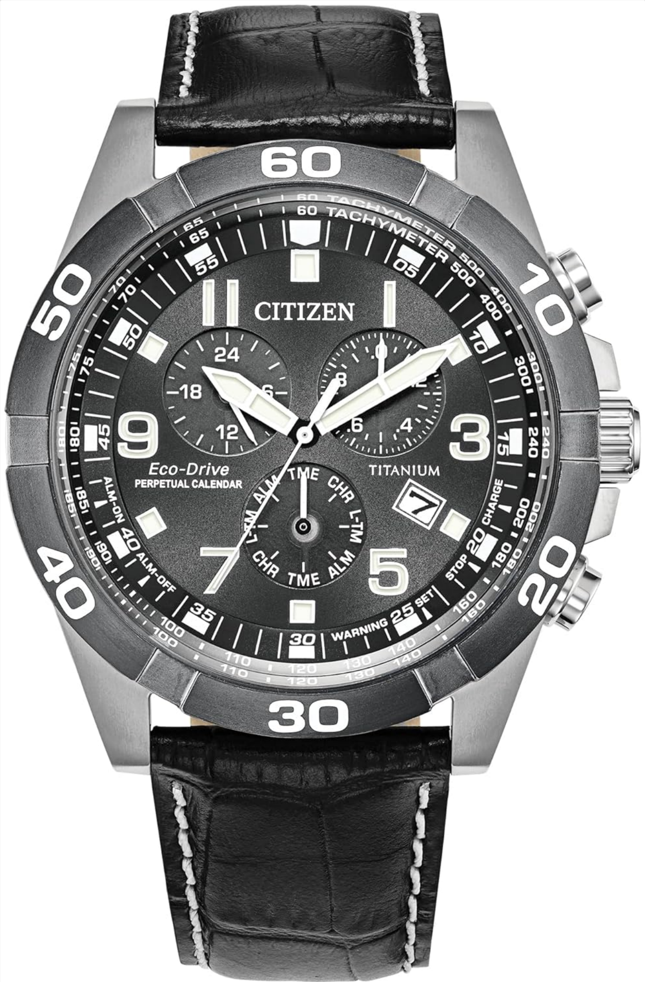
Image: Front view of the Citizen Brycen Chronograph Watch, showcasing its grey dial, chronograph subdials, and black leather strap